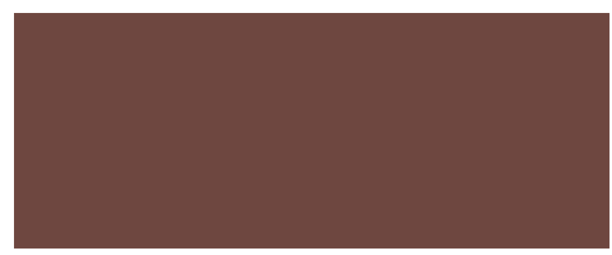
Building B2 - Cementitious Siding Color #3

September 22, 2016 Materials - Building B2