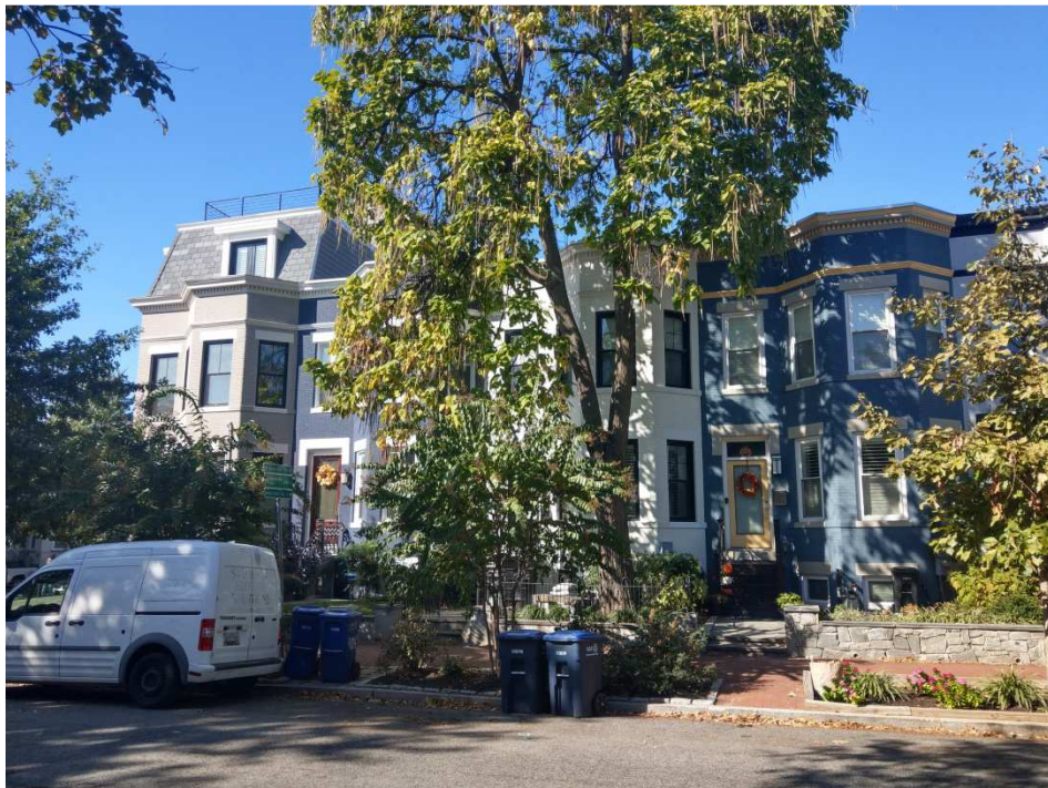
Context Photo of Adjacent Rowhomes (906 11 th St NE is the Blue one with yellow trim)