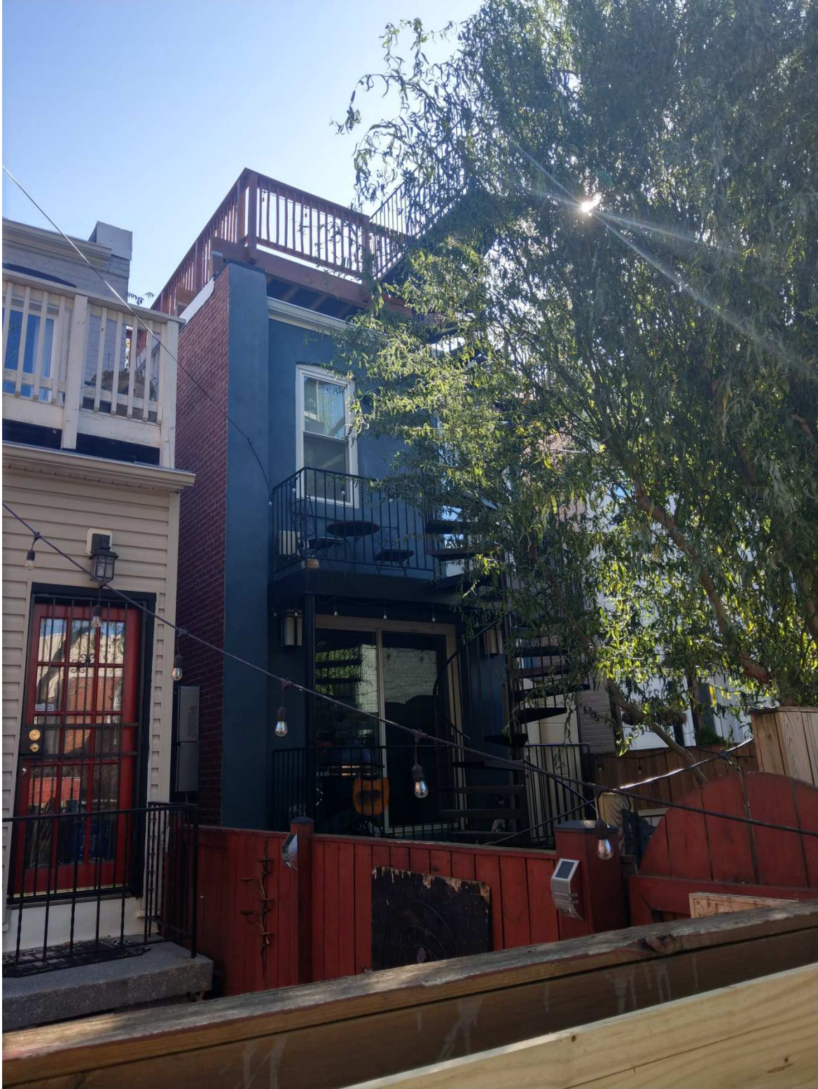
Existing Rear Elevation (From rear neighbor's yard)