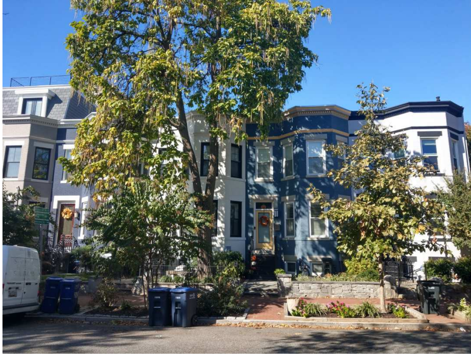
Context Photo of Adjacent Rowhomes (906 11 th St NE is the Blue one with yellow trim)