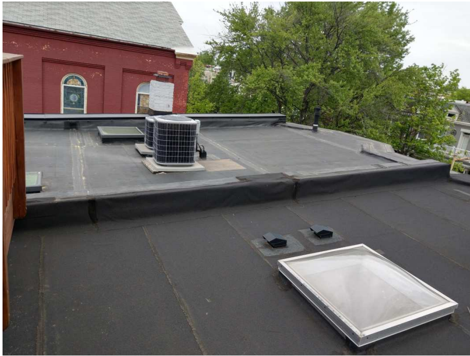
View in front of existing roof deck looking towards Holy Name of Jesus Parish Church on 11 th Street.