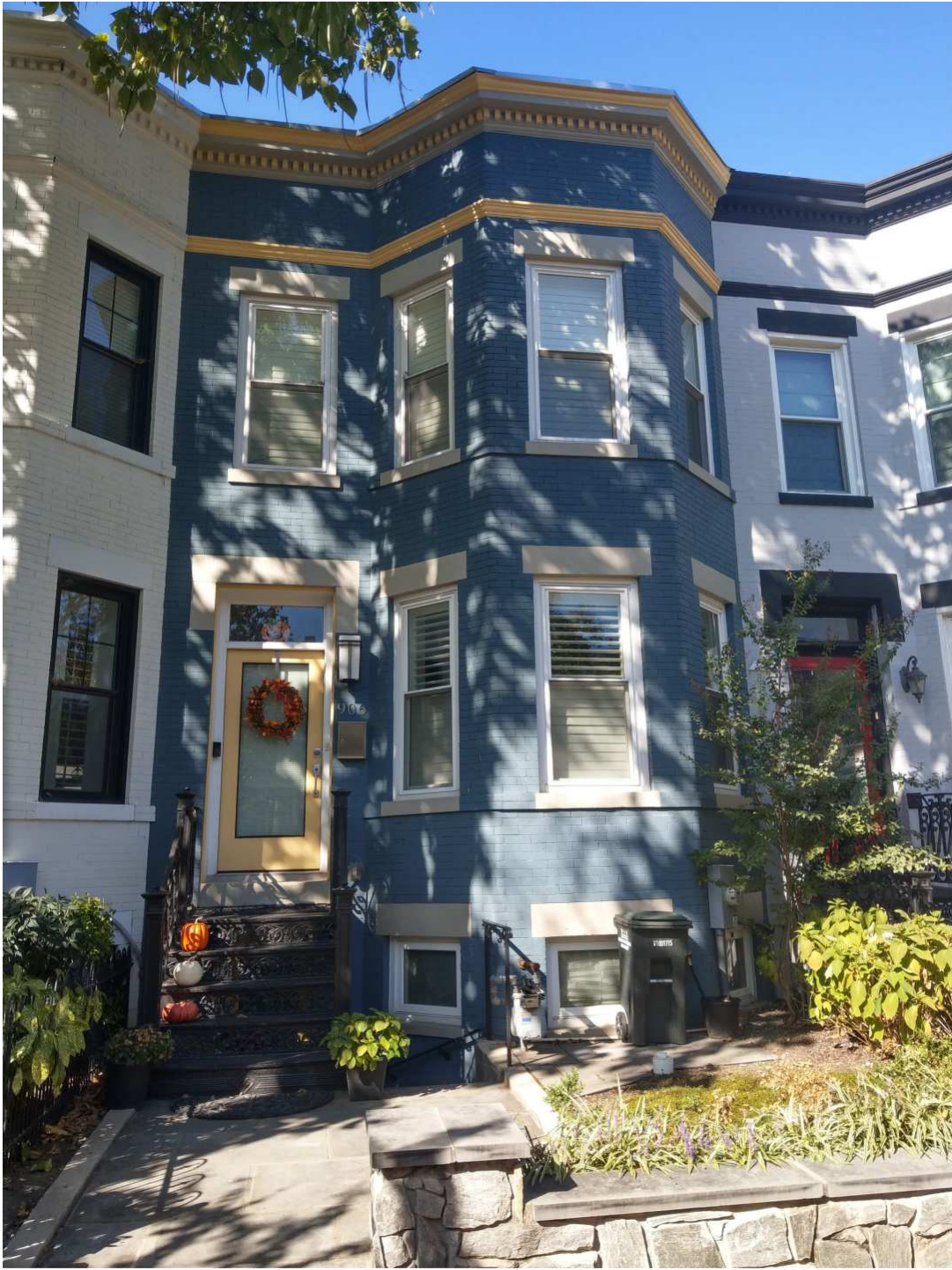
Existing Front Elevation (Street Side)