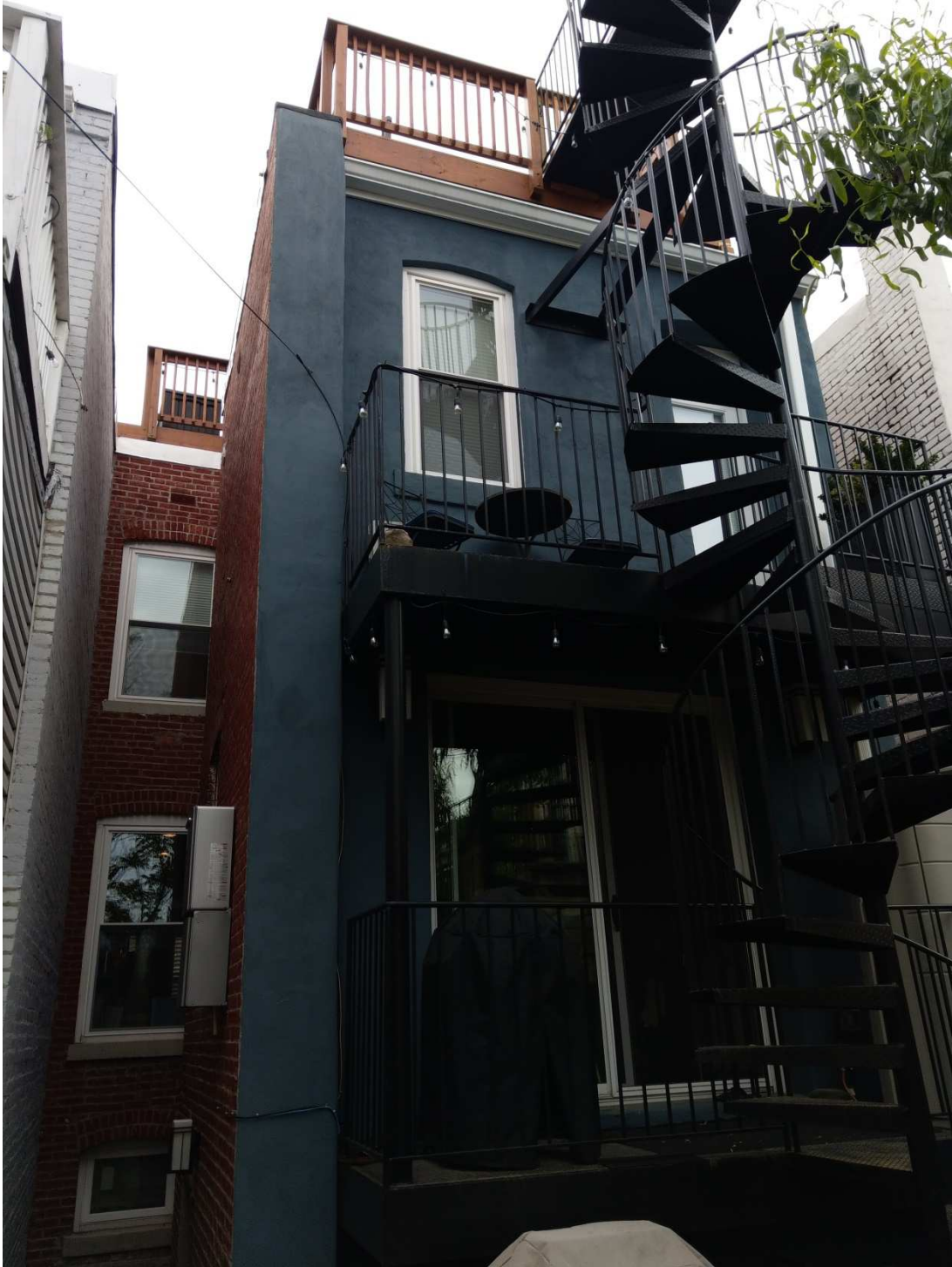
Existing Rear Elevation (From inside yard)