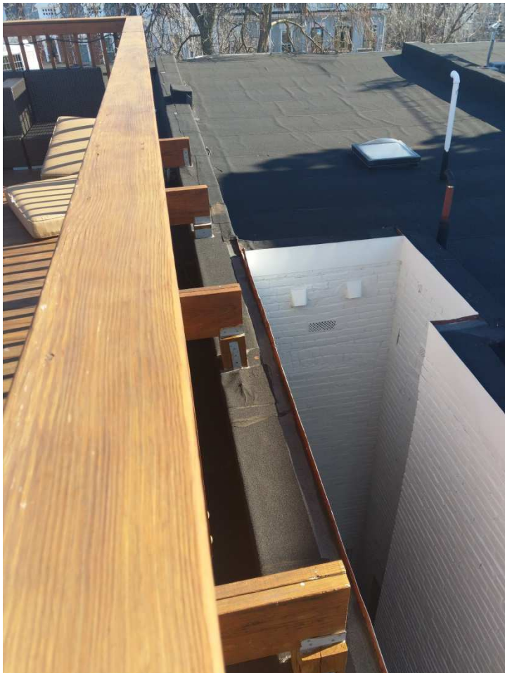
View of Existing Roof Deck and rail on side wall/Open court condition