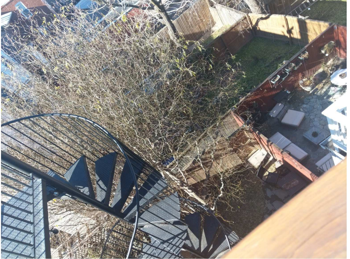
View from Existing Roof Deck to Existing Spiral Stair Access