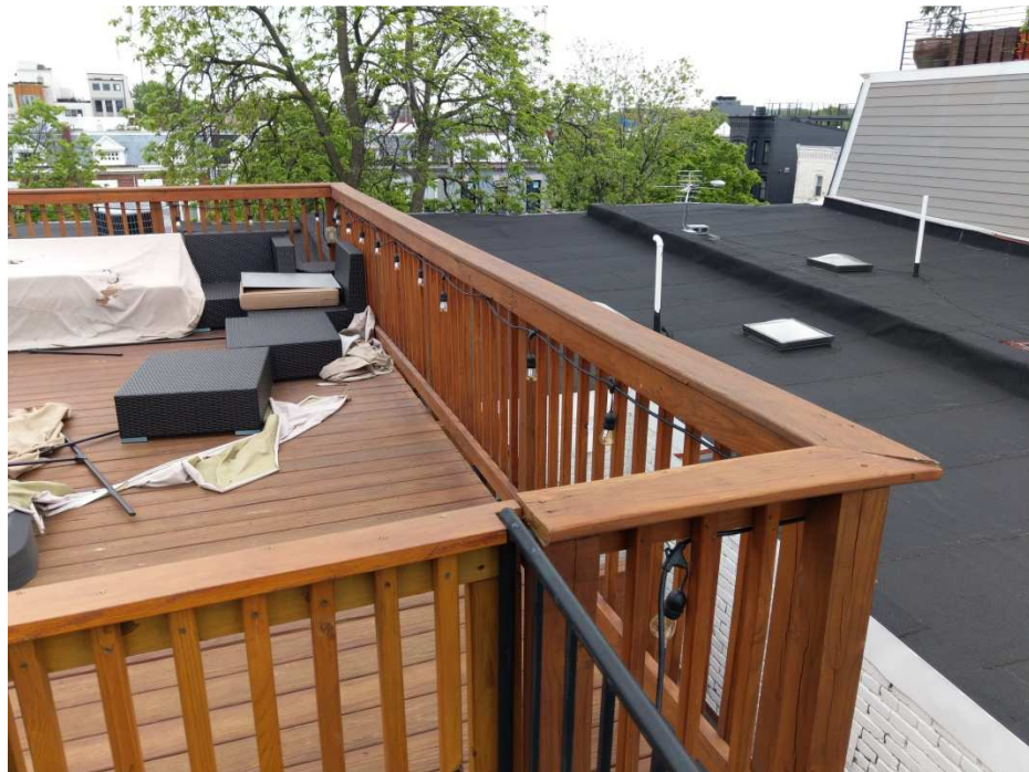
View of Existing Roof Deck looking towards 11 th Street and Eye Street (at right corner is third story and roof deck of 900 11 th Street NE)