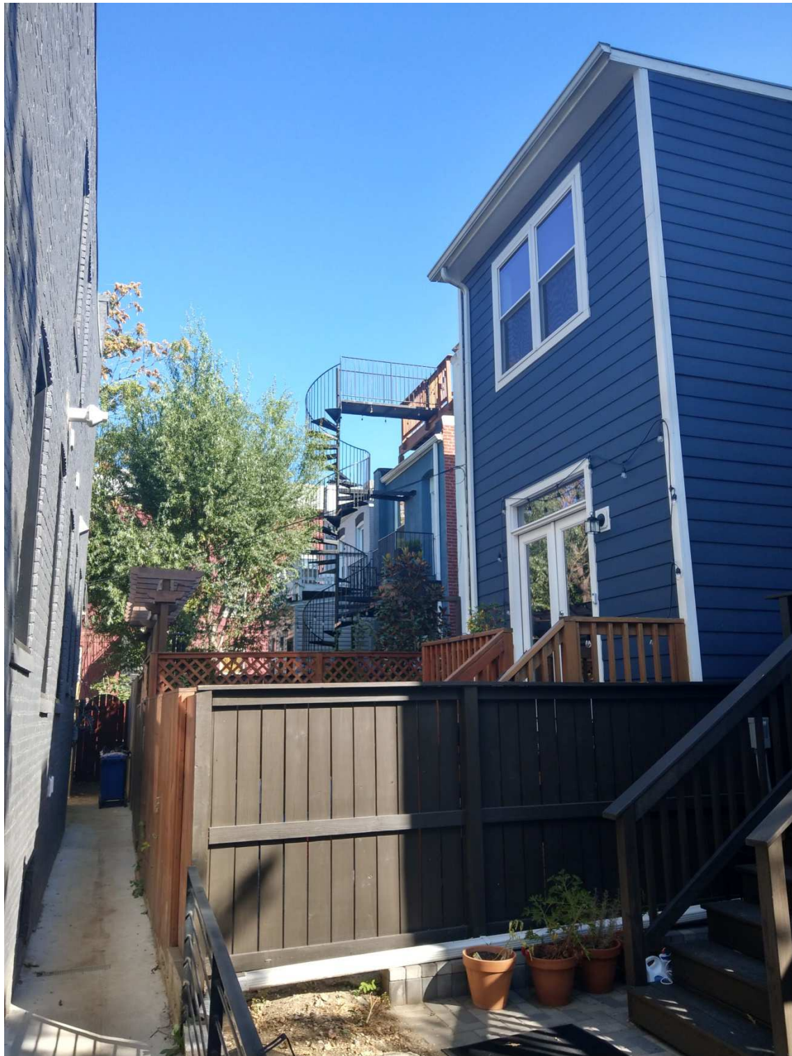
Existing Spiral Staircase and Catwalk (Seen from Pedestrian walkway entrance at Eye Street, NE)