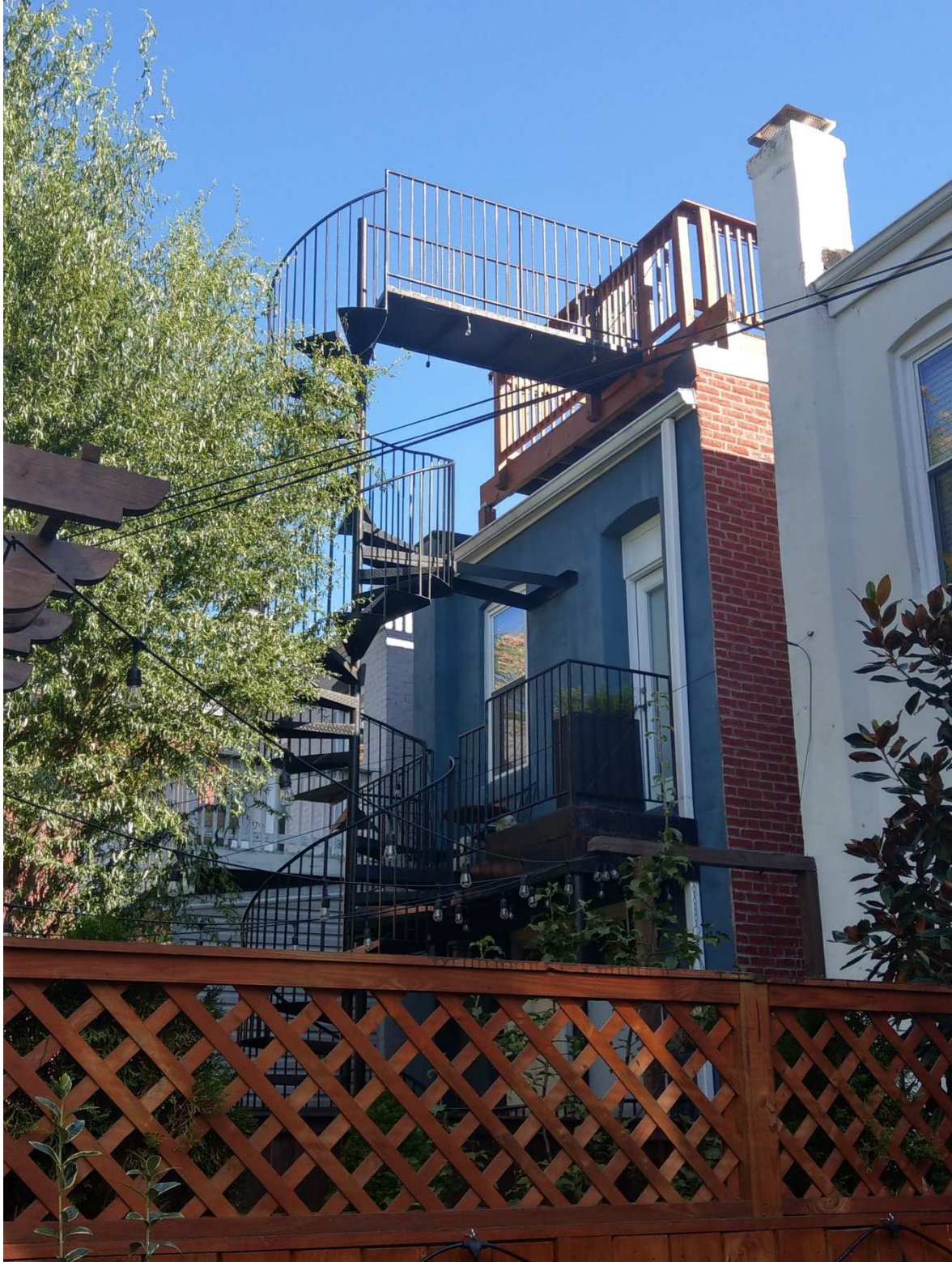
Existing Rear Elevation (From Pedestrian walkway)