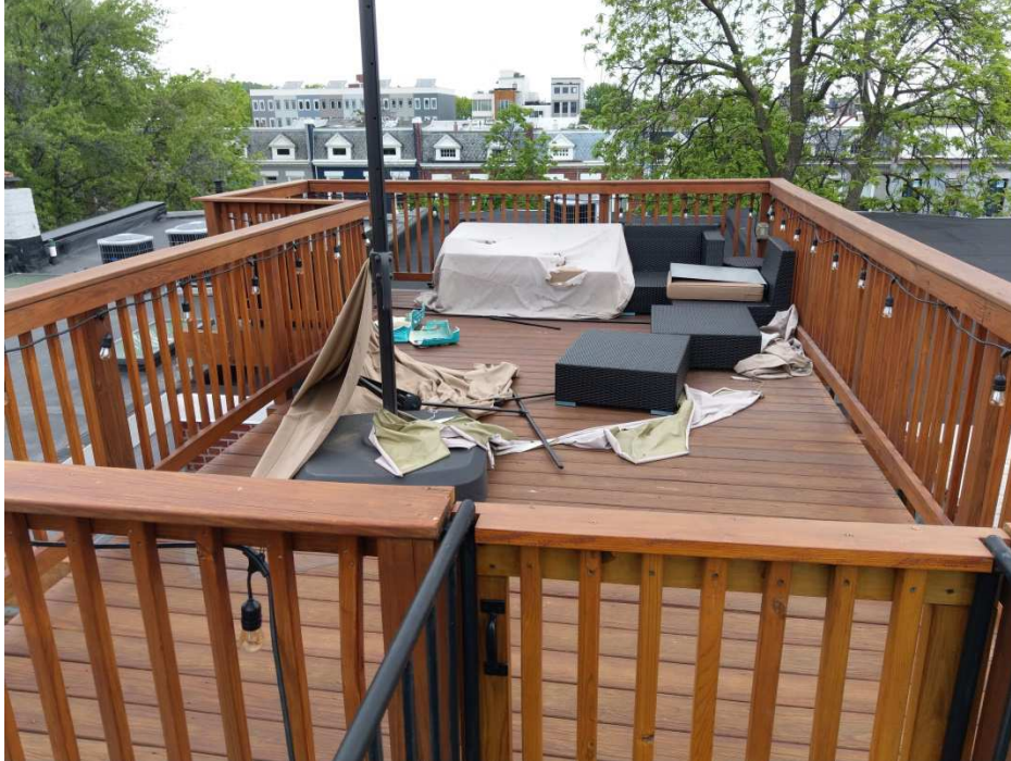
View of Existing Roof Deck looking towards 11 th Street NE