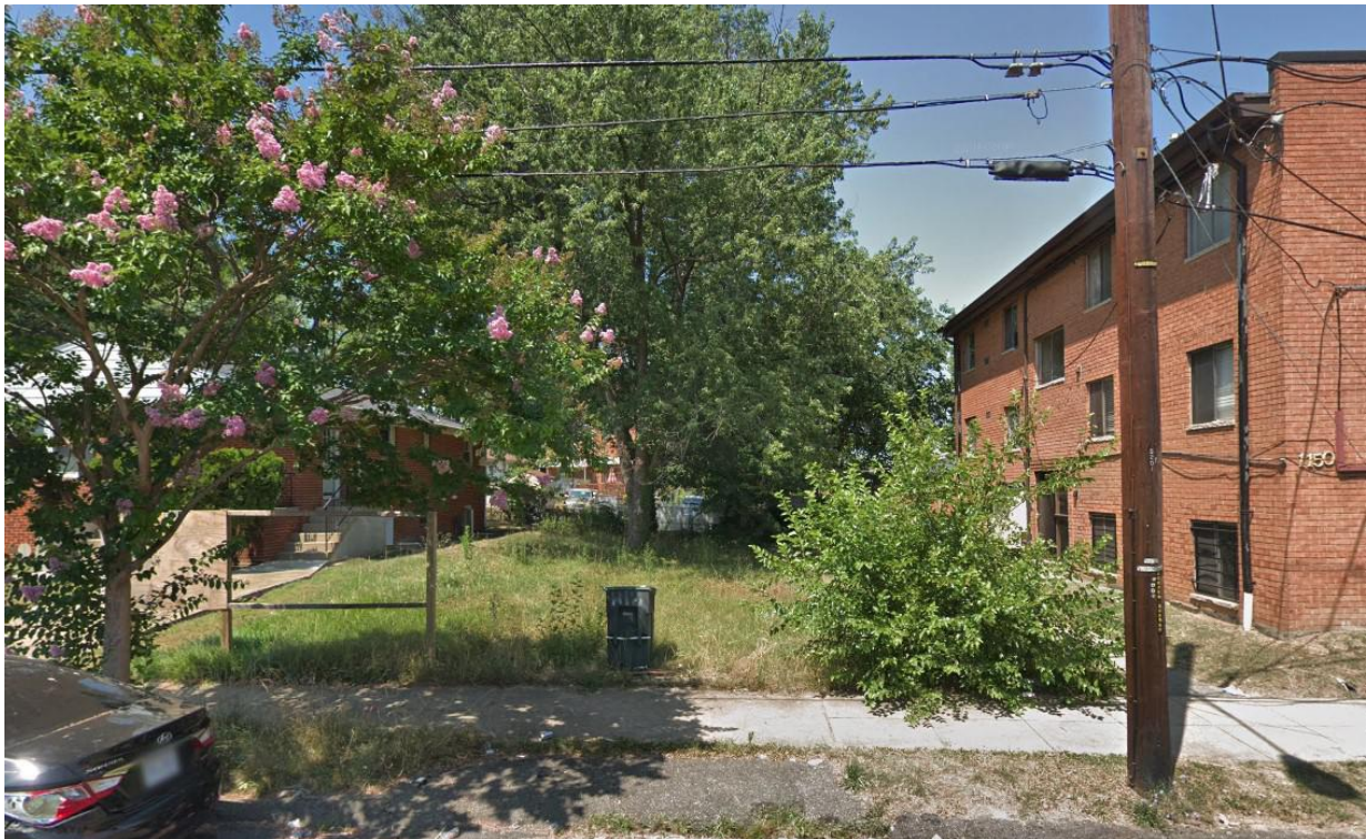
Project Site Street View