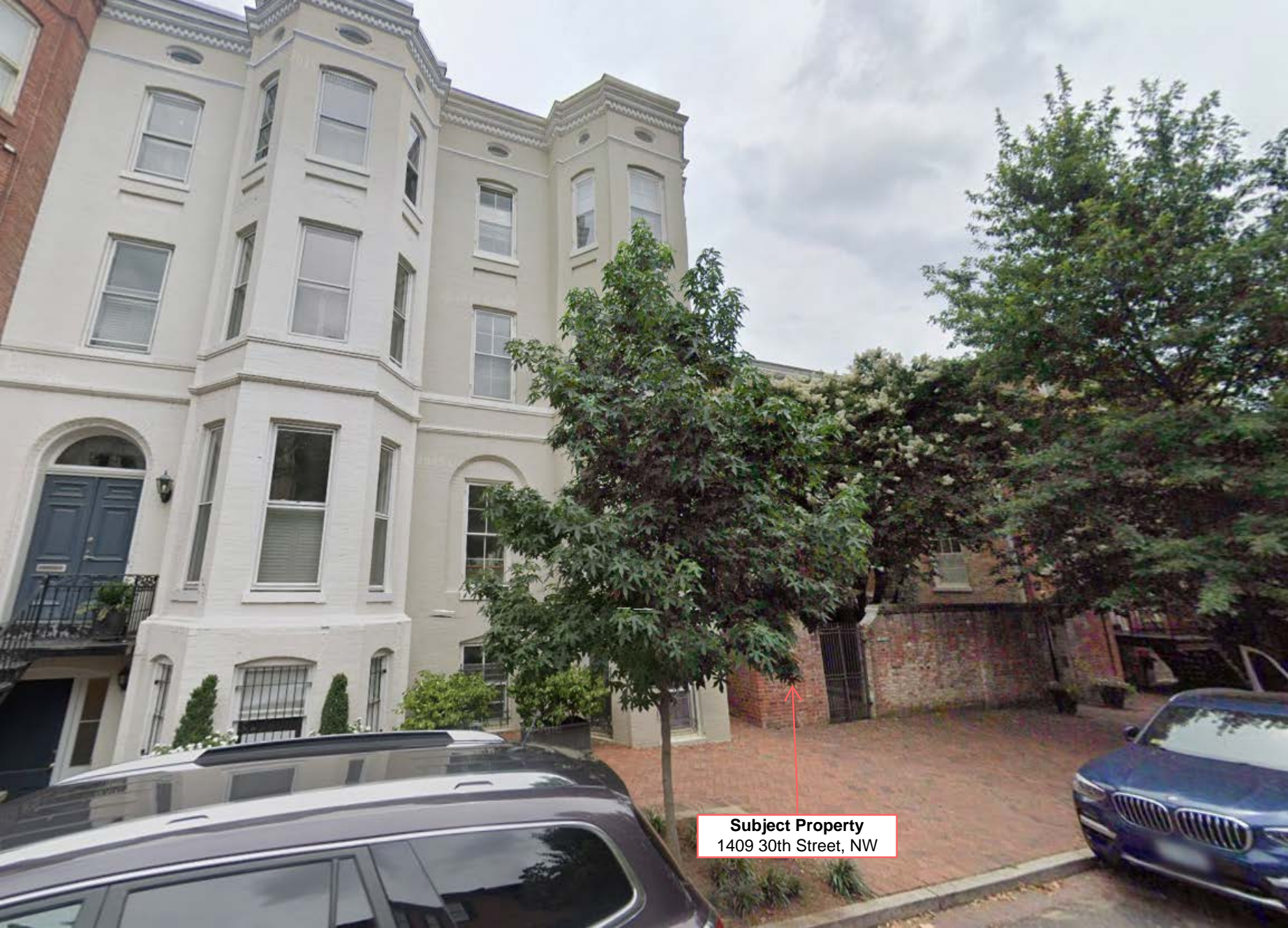
Subject Property 1409 30th Street, NW