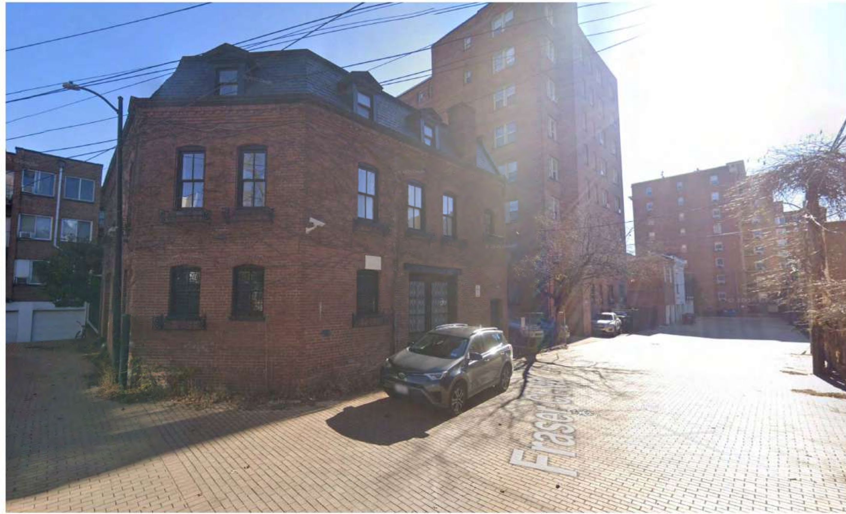
1 WINTER VIEW FROM ALLEY SCALE: NONE