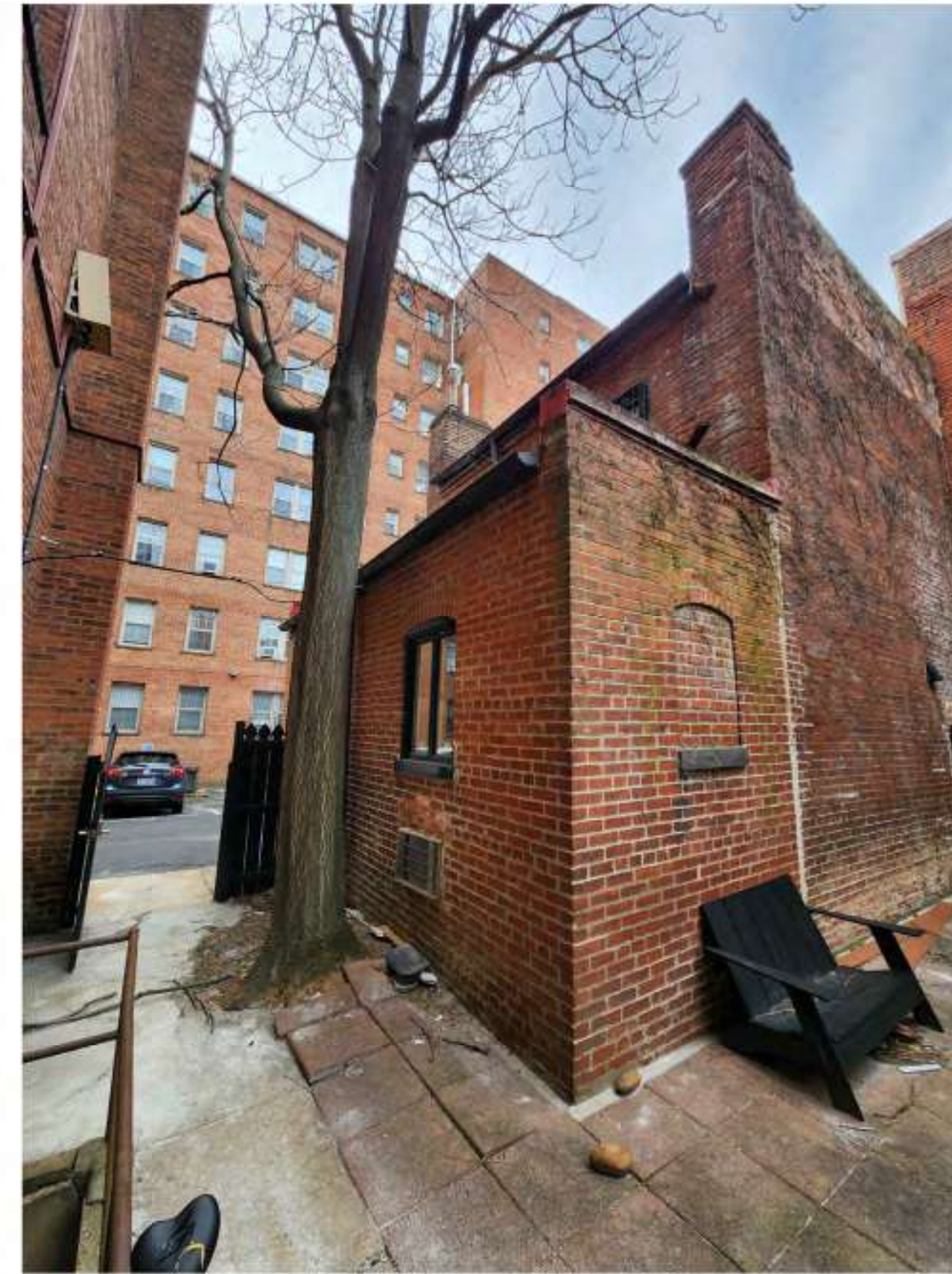
4 EXISTING VIEW OF REAR SCALE: NONE