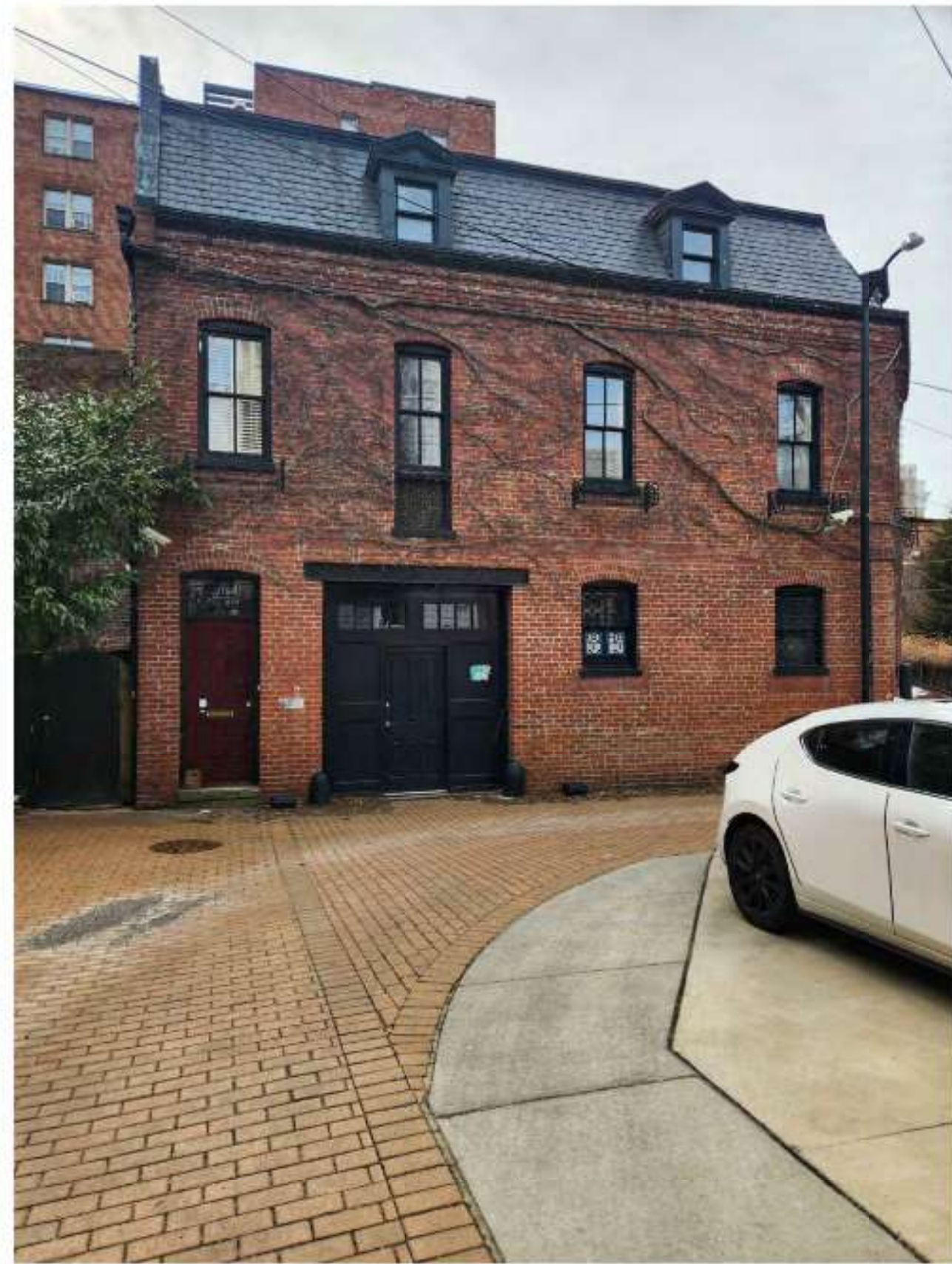
1 EXISTING VIEW TO THE NORTH SCALE: NONE