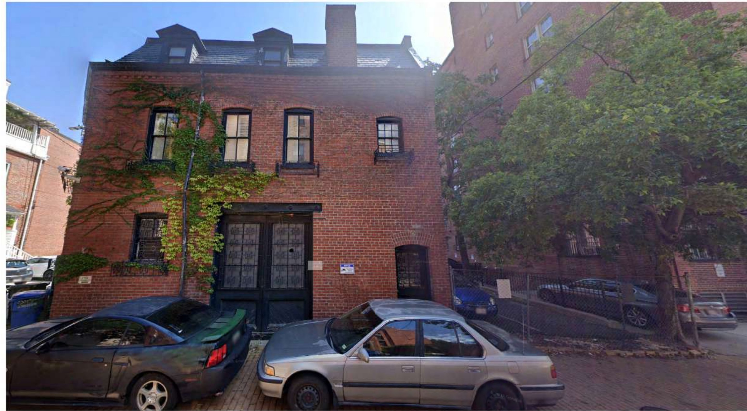
2 EXISTING VIEW TO THE WEST SCALE: NONE