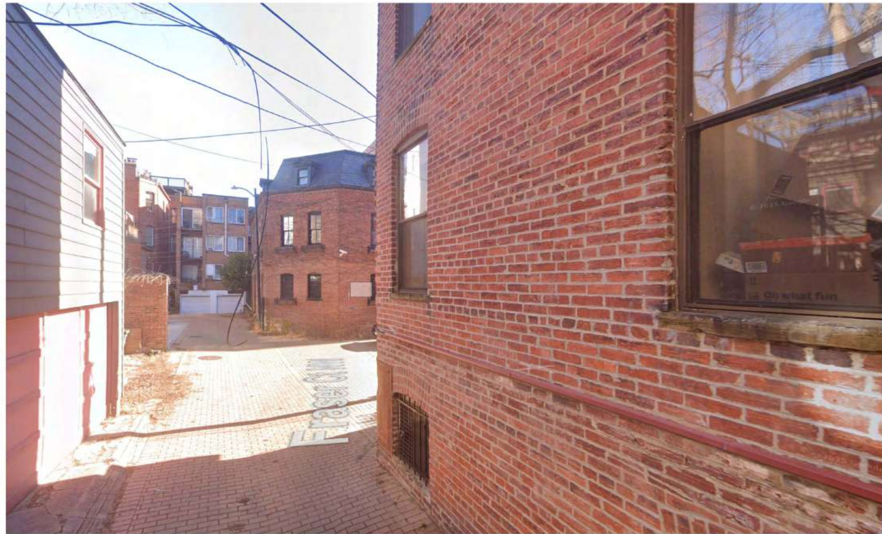
3 EXISTING VIEW FROM ALLEY SCALE: NONE