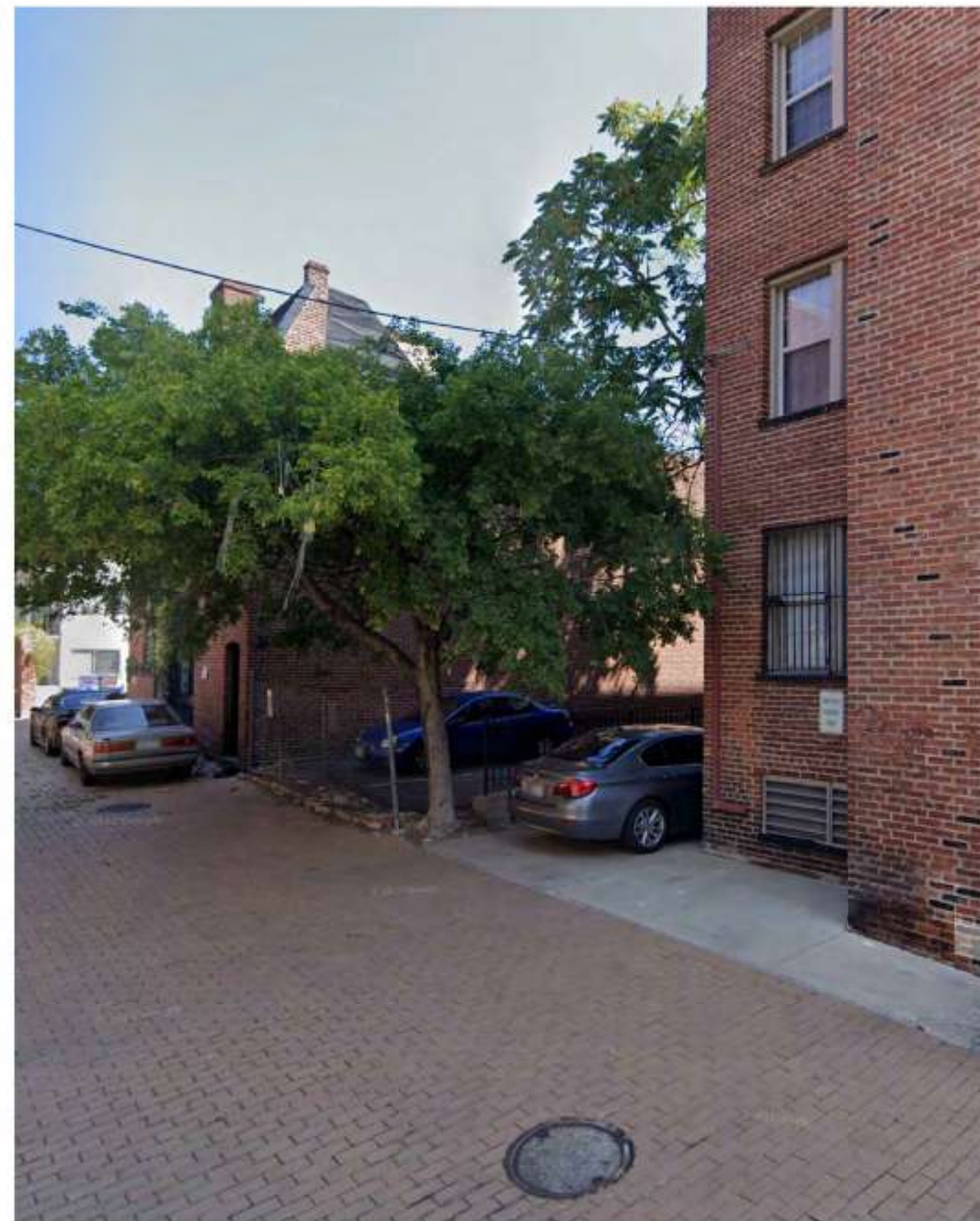
4 EXISTING VIEW FROM ALLEY TO THE SOUTHWEST SCALE: NONE