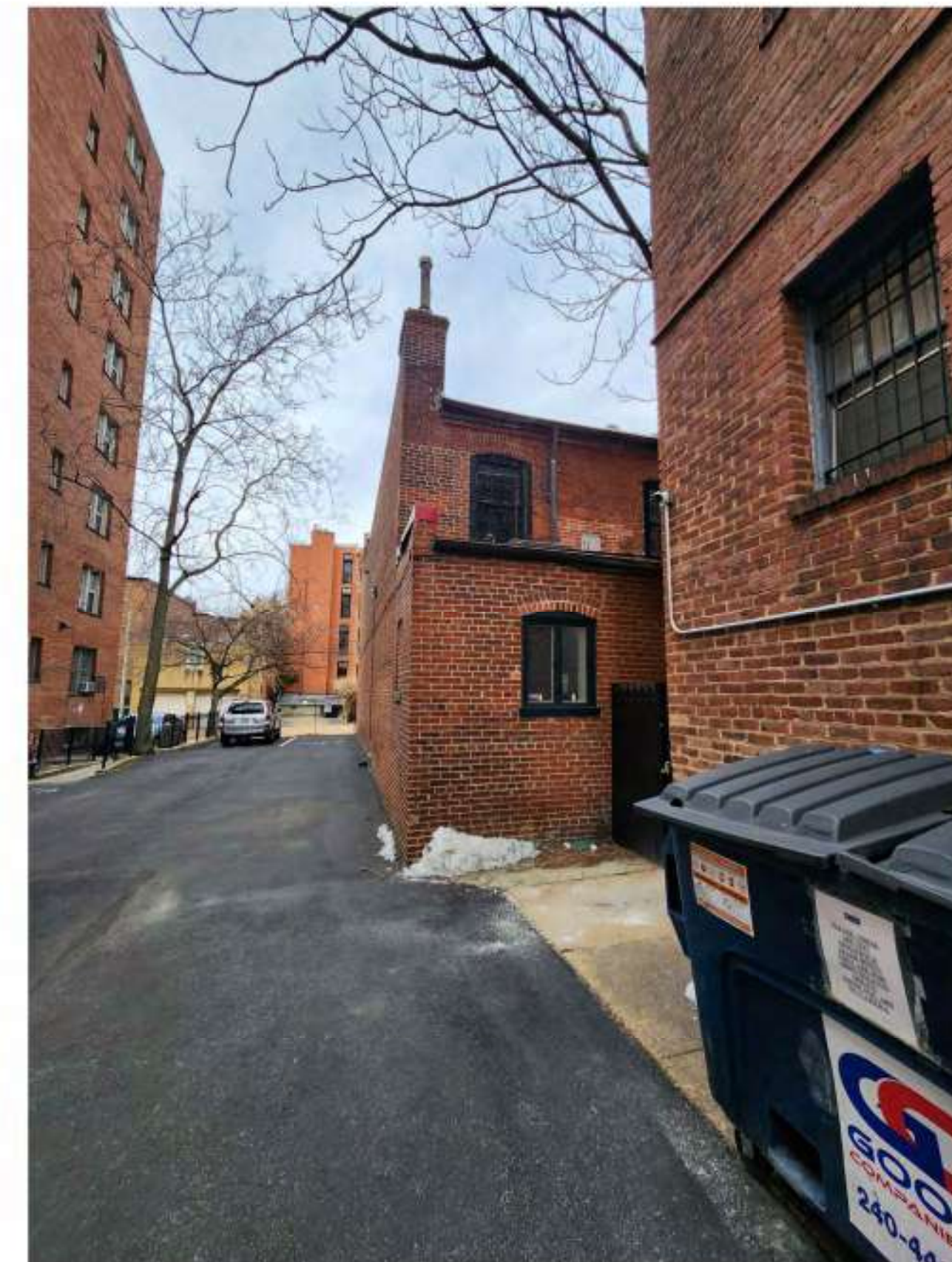
5 EXISTING VIEW FROM REAR NEIGHBORING PARKING LOT SCALE: NONE