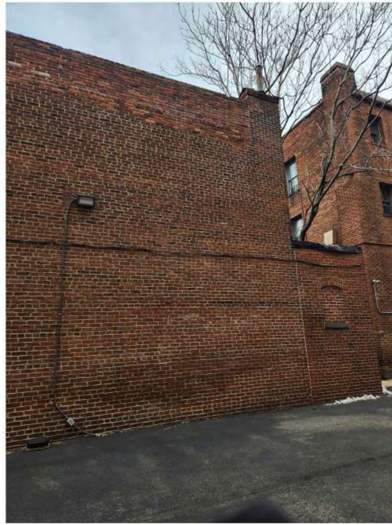
2 EXISTING VIEW FROM REAR NEIGHBORING PARKING LOT SCALE: NONE