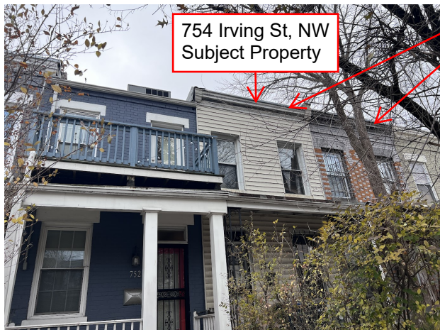
754 Irving St, NW Subject Property

740 Irving St, NW End unit rebuilt into 3-story, 3-unit condo