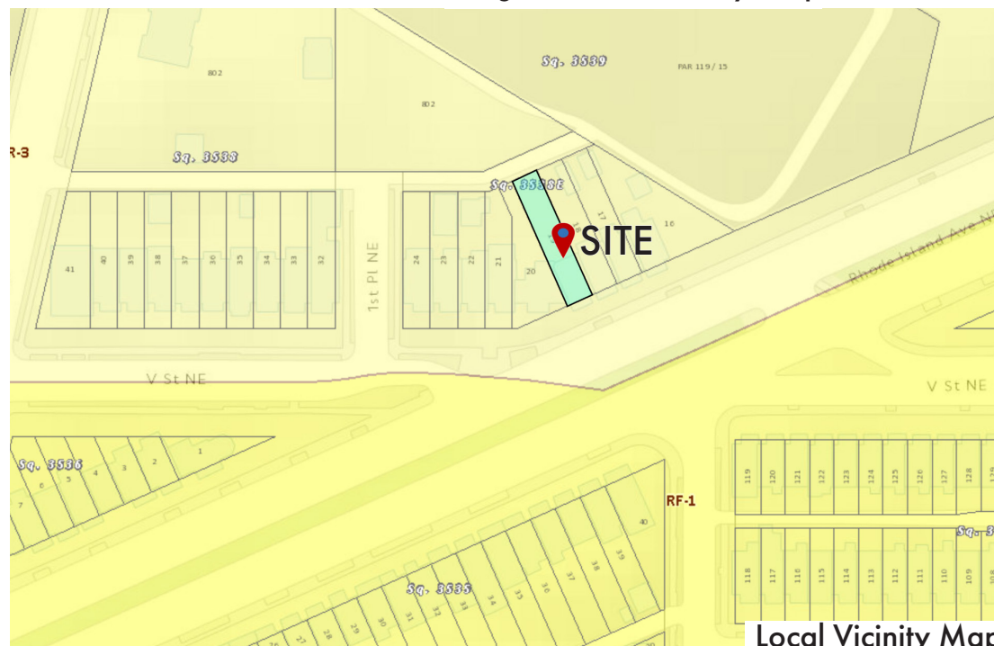
Local Vicinity Map