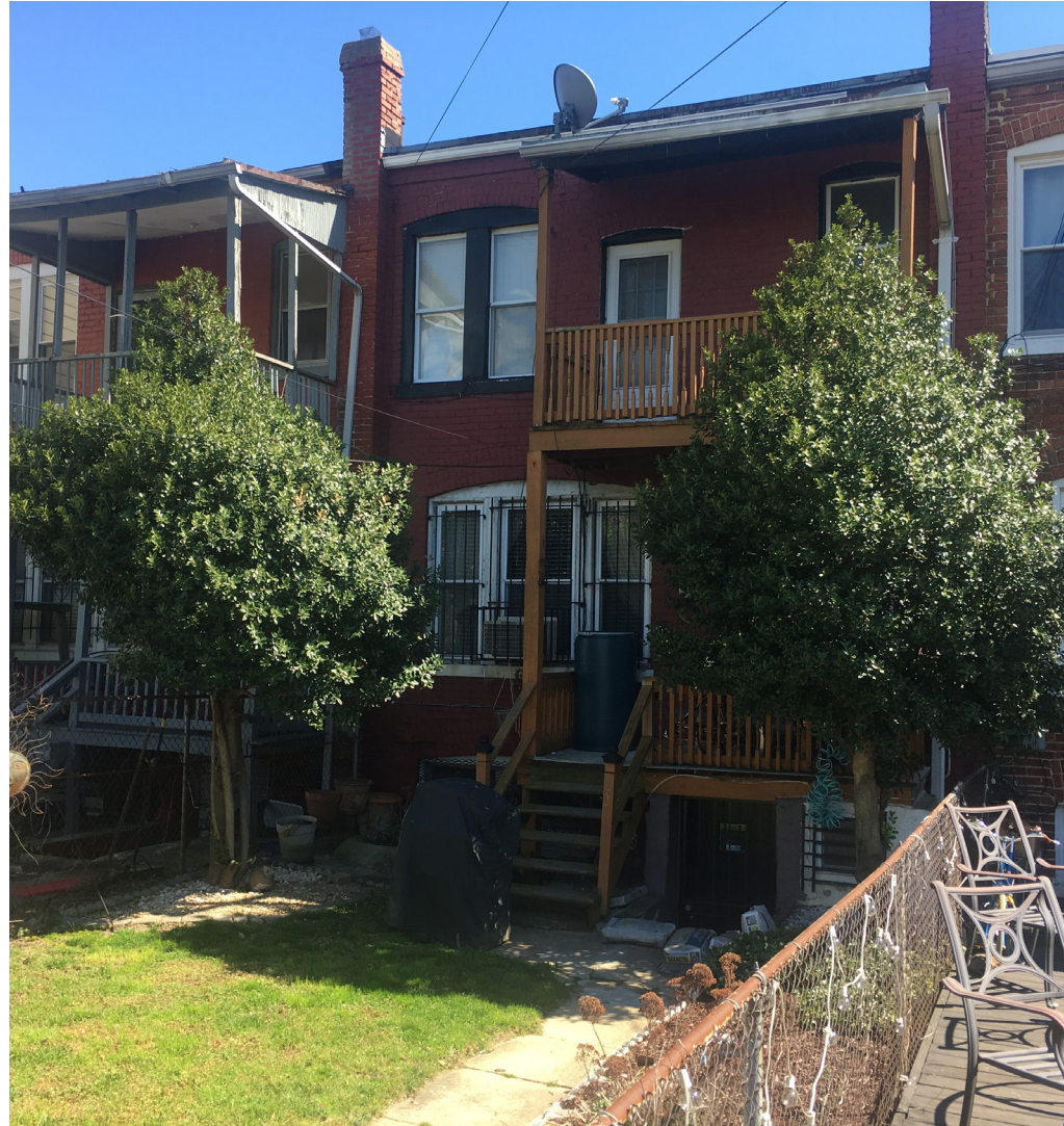
132 Rhode Island Avenue NE Eastern Adjoining Rowhouse