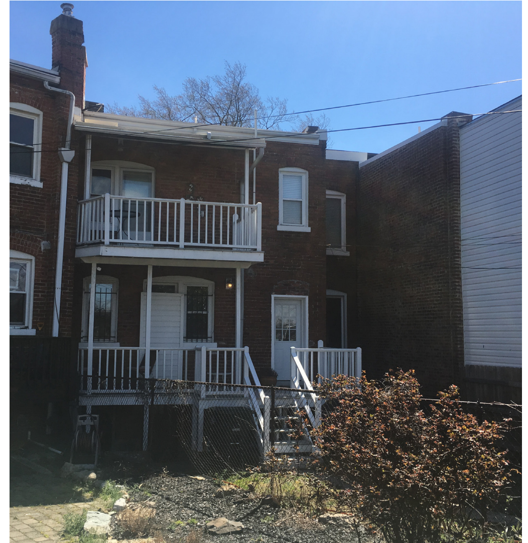
128 Rhode Island Avenue NE Western Adjoining Rowhouse