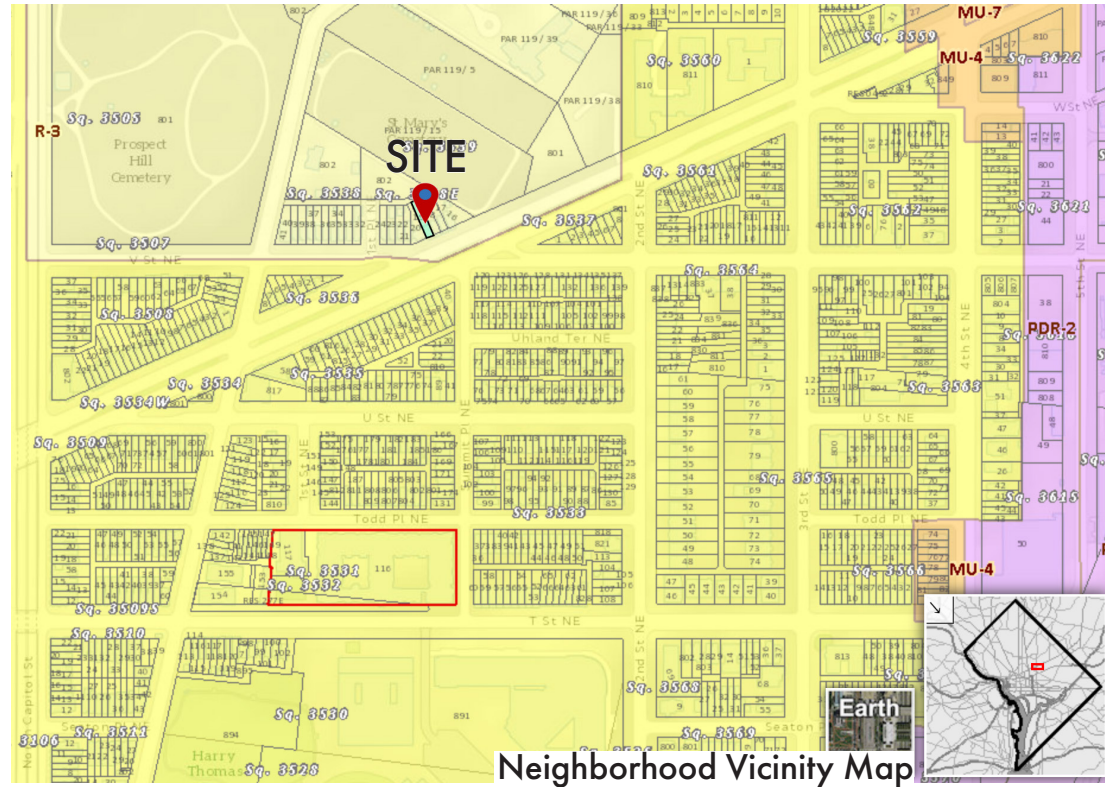
Neighborhood Vicinity Map