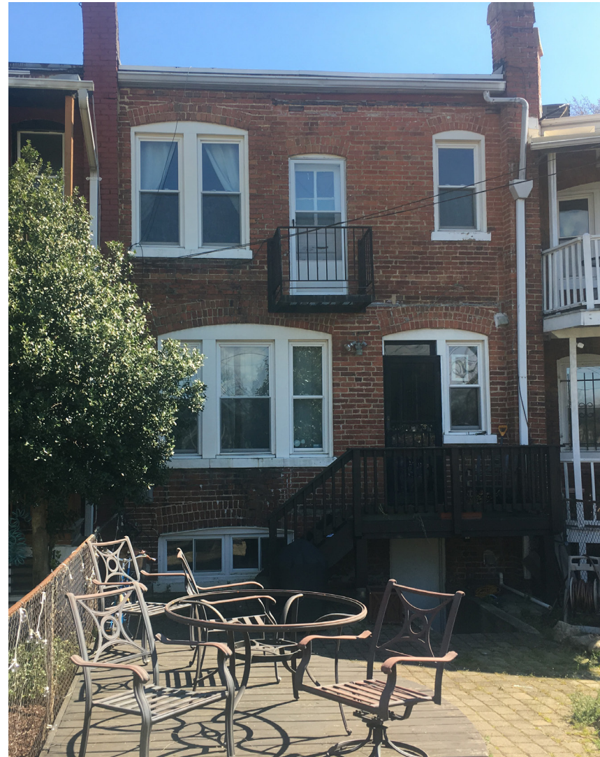
130 Rhode Island Avenue NE Rear Yard of Site