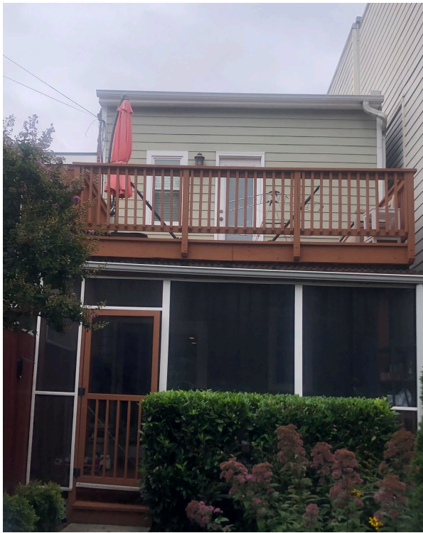
EXISTING REAR FACADE