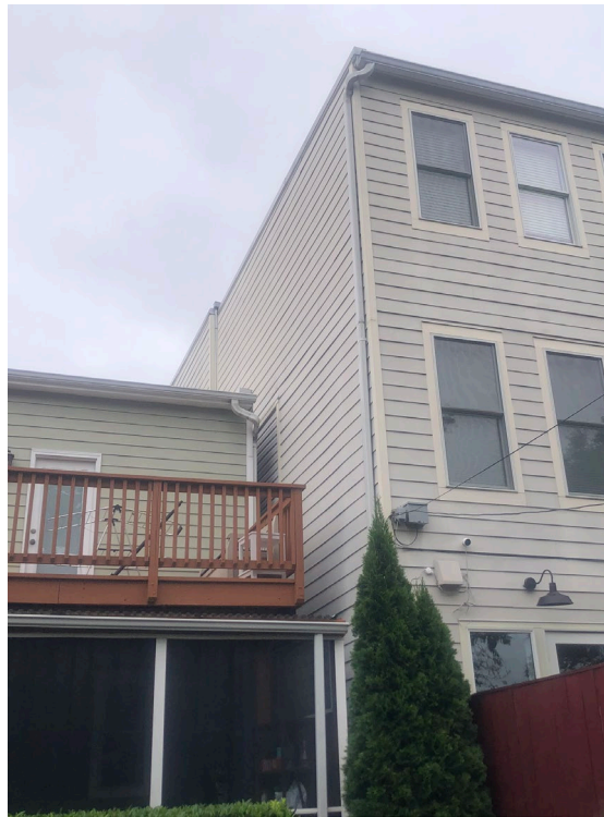
REAR FAÇADE, TOWARD 1429 D STREET SE