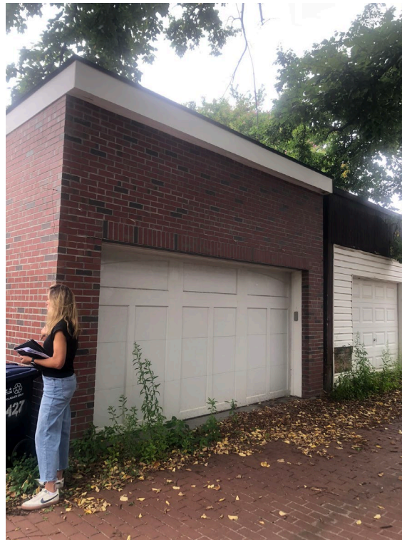
ALLEY VIEW, LOOKING EAST