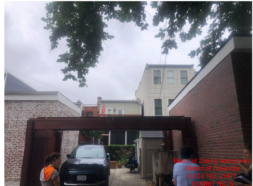
EXISTING VIEW FROM ALLEY

Board of Zoning Adjustment District of Columbia CASE NO. 21418 EXHIBIT NO. 5