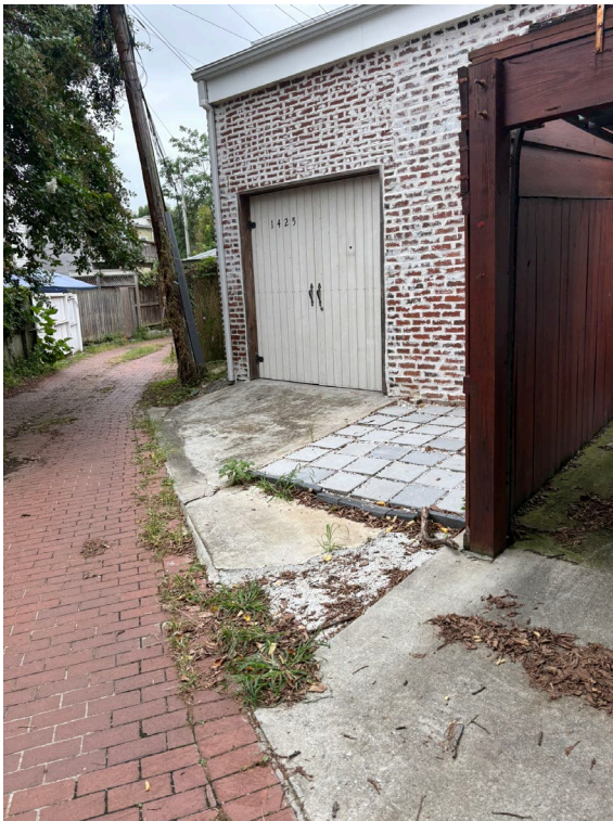
ALLEY VIEW, LOOKING WEST