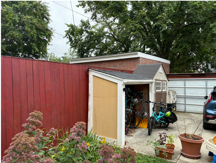
VIEW FROM REAR YARD, LOOKING EAST