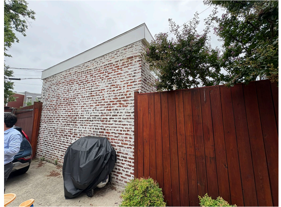
VIEW FROM YARD, LOOKING WEST