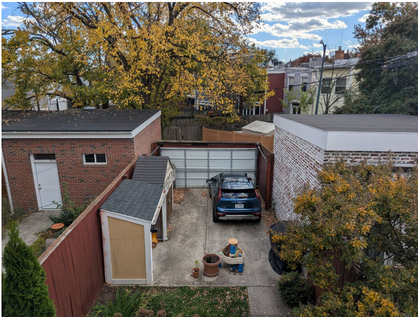
EXISTING REAR YARD, VIEW FROM SECOND FLOOR