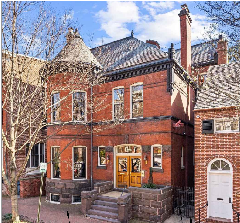
5-Front Facade, 3032 N St