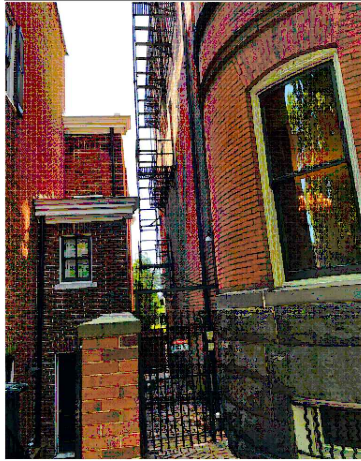
4-N St View Toward Rear Yard