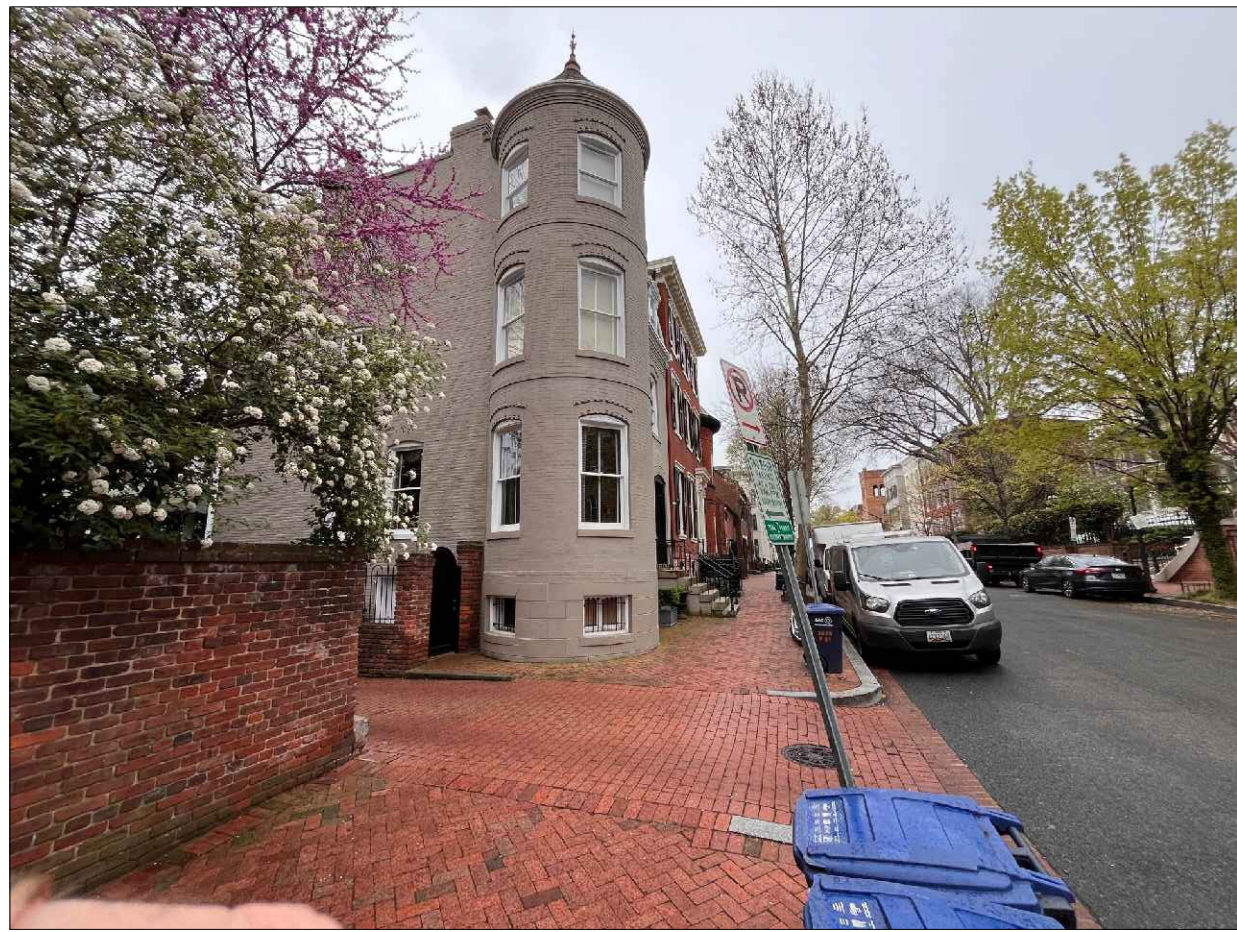
1-N St View