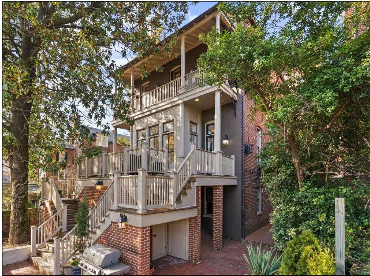
10 - Rear Yard View