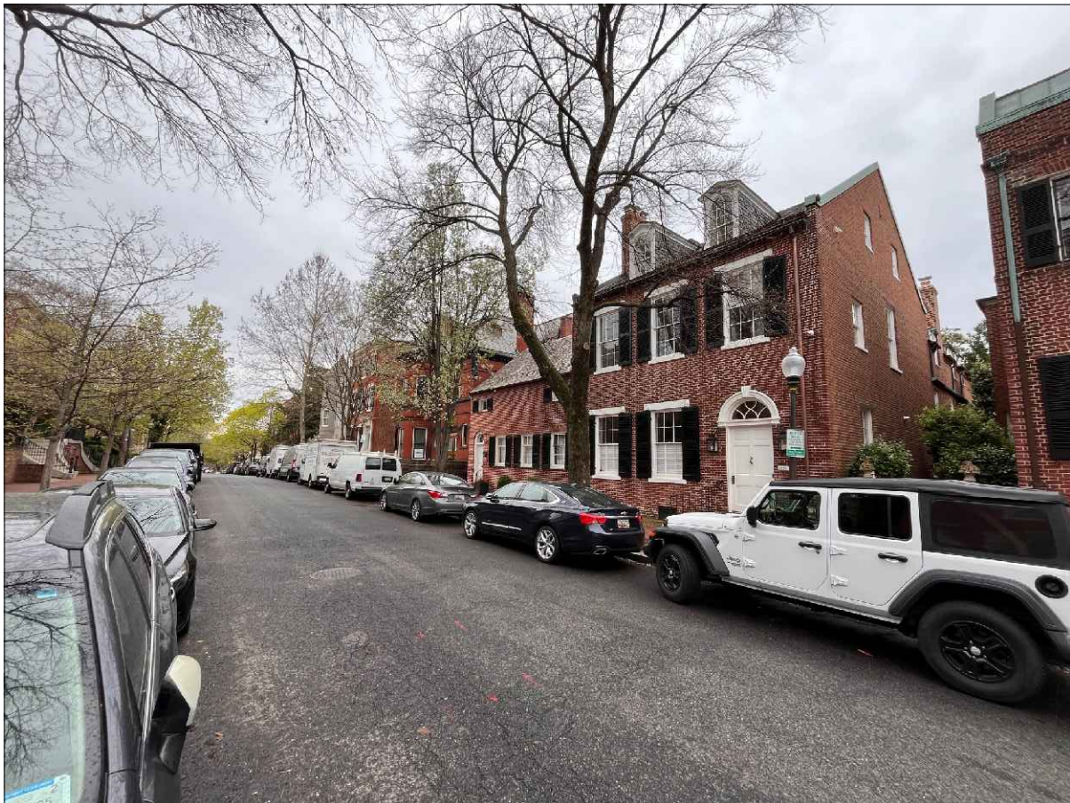
7-N St View