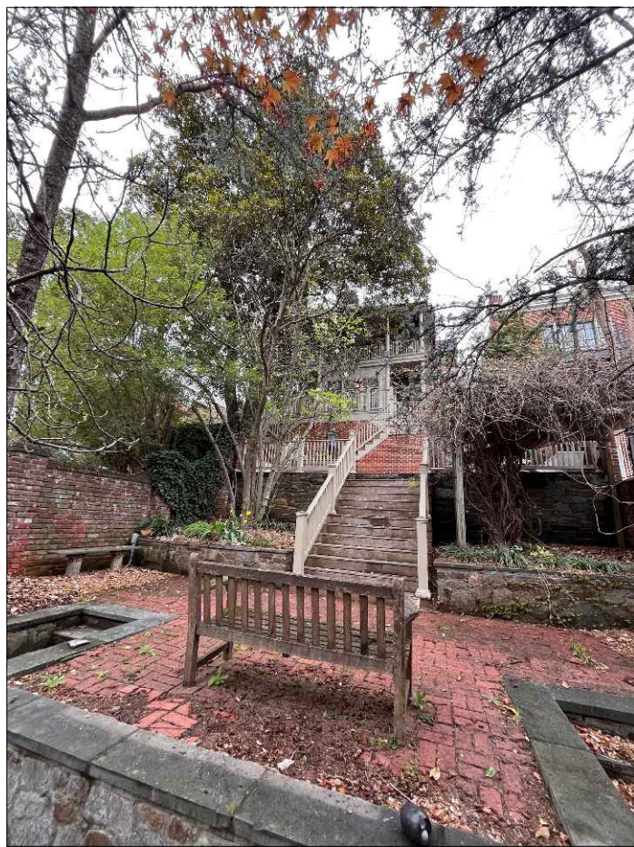
9 - Rear Yard View