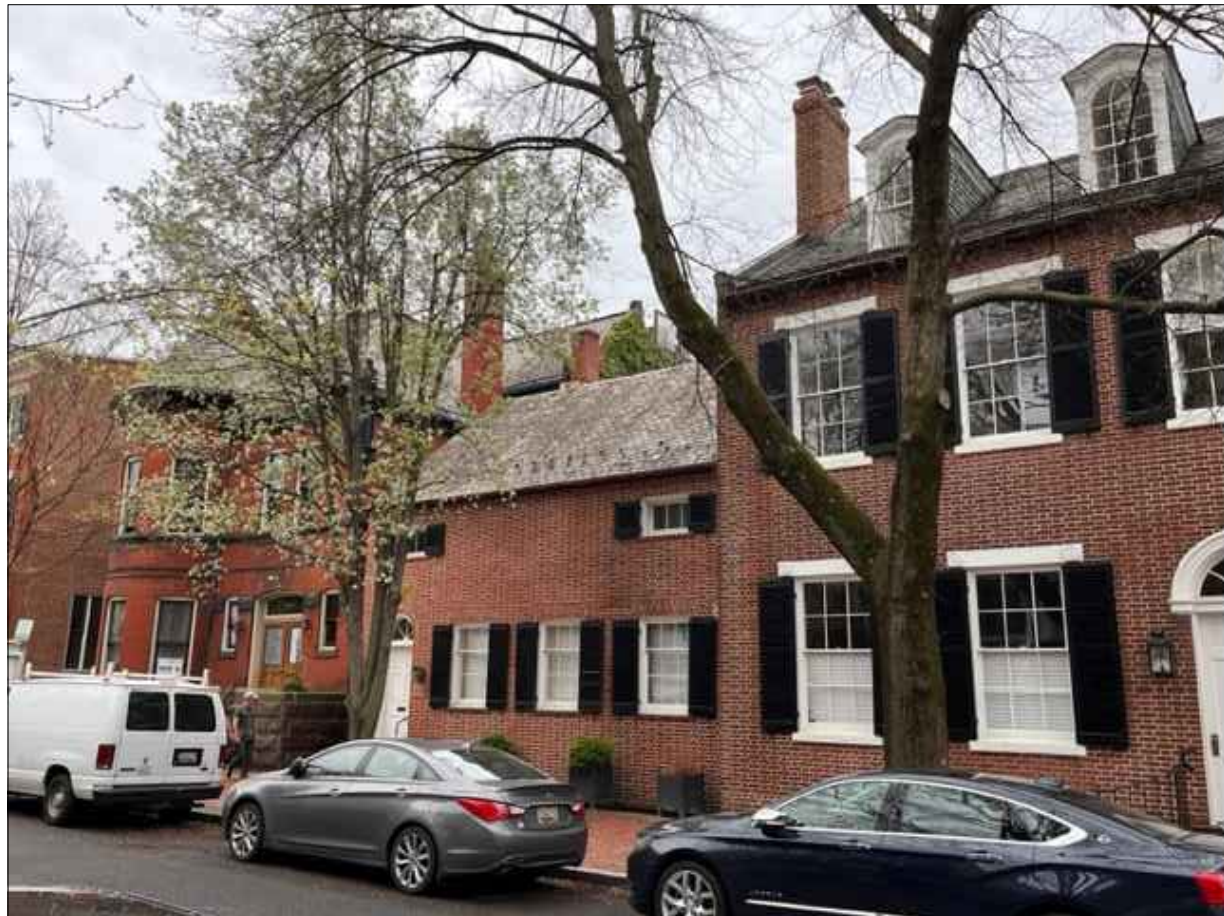
6-N St View