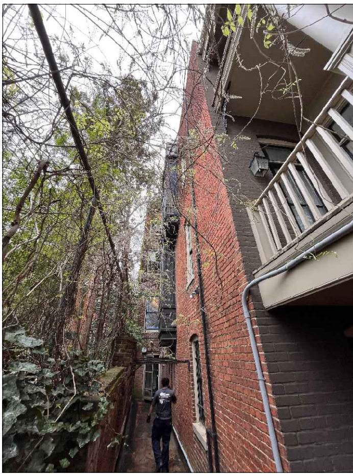
11 - Side Walkway View