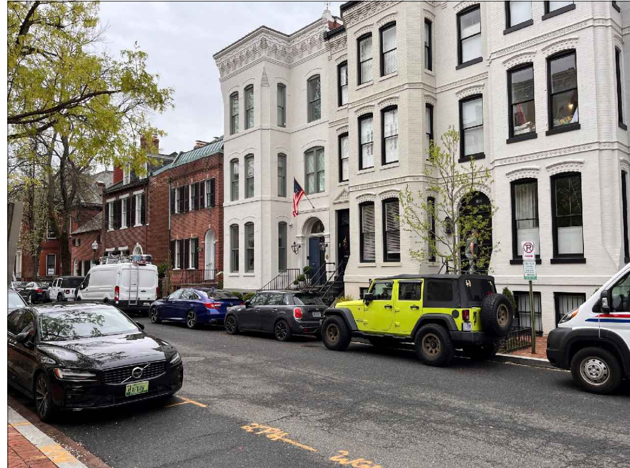
8-N St View