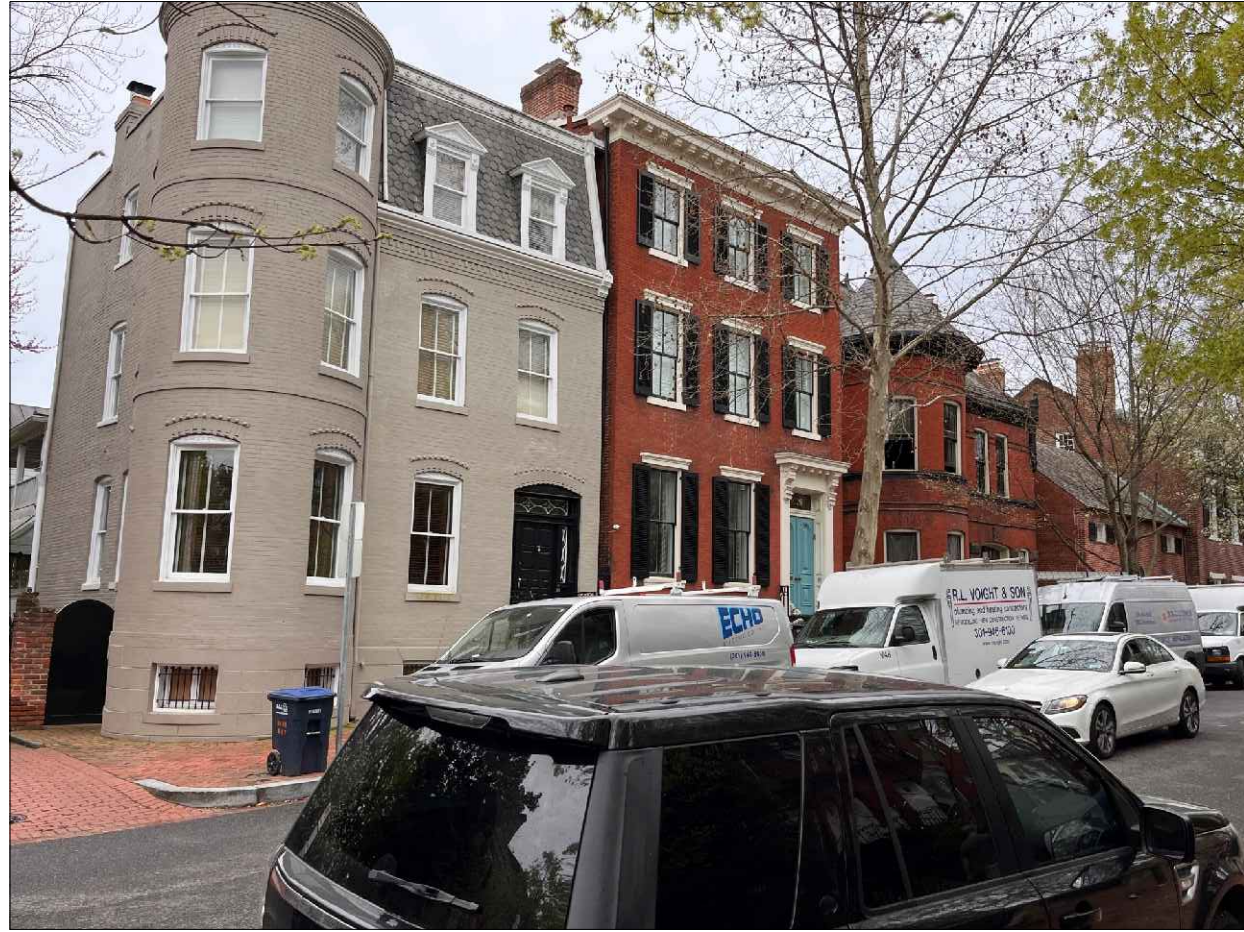
2-N St View