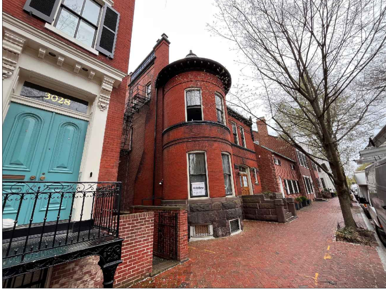
3-N St View