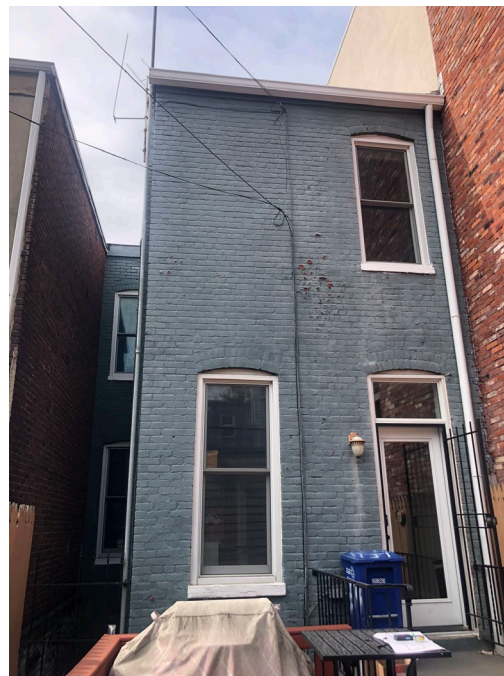
EXISTING REAR FACADE