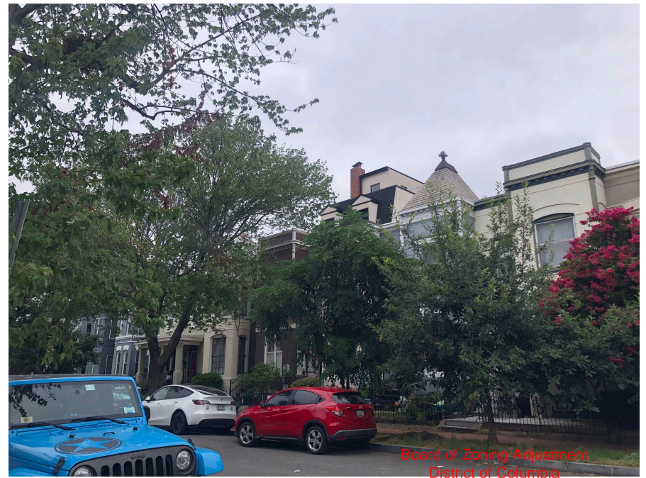
STREET VIEW, LOOKING WEST

Board of Zoning Adjustment District of Columbia CASE NO. 21413 EXHIBIT NO. 3