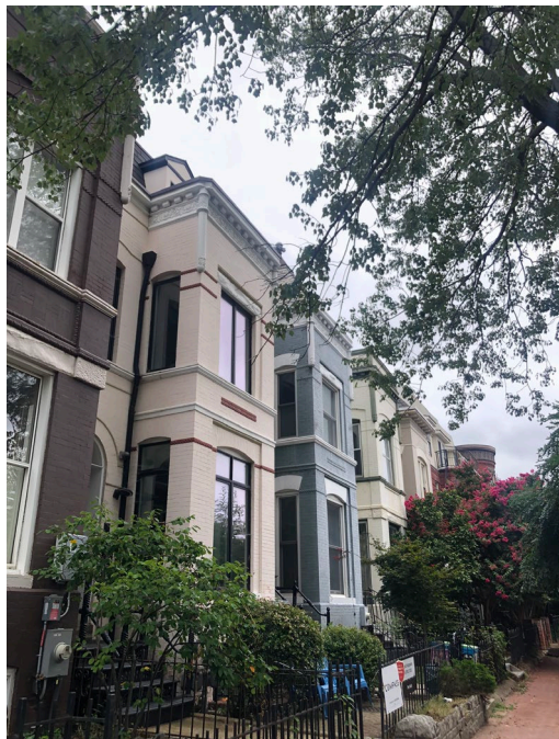
SIDEWALK VIEW, LOOKING EAST