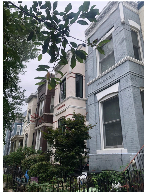
SIDEWALK VIEW, LOOKING WEST