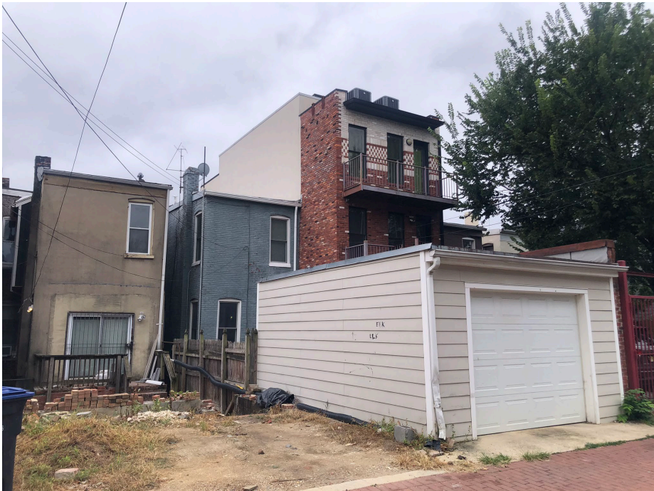
VIEW FROM ALLEY, LOOKING WEST