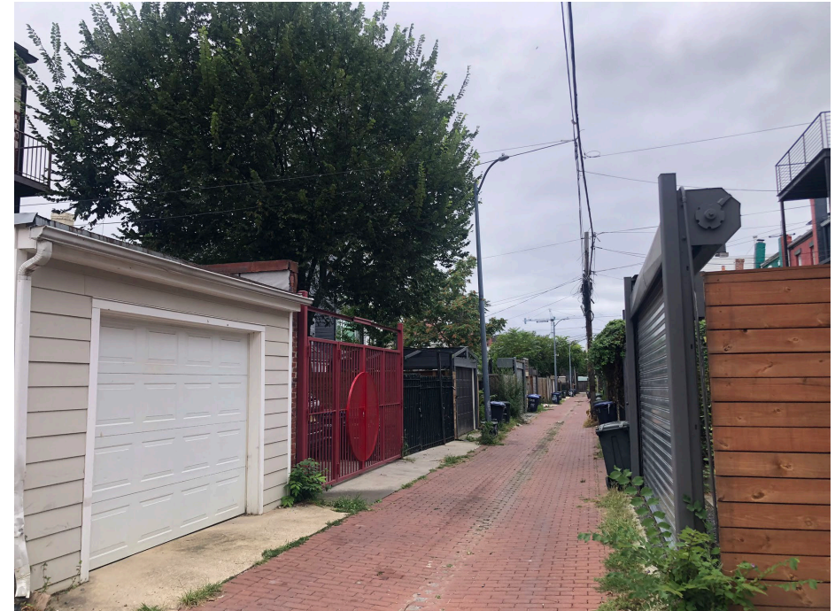
VIEW FROM ALLEY, LOOKING WEST