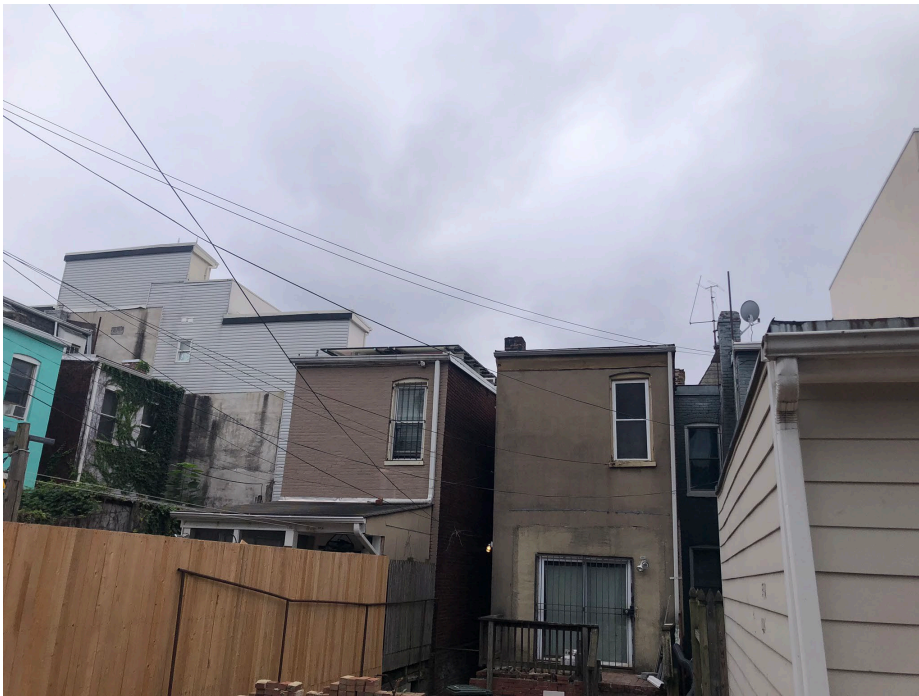
VIEW FROM ALLEY, LOOKING EAST