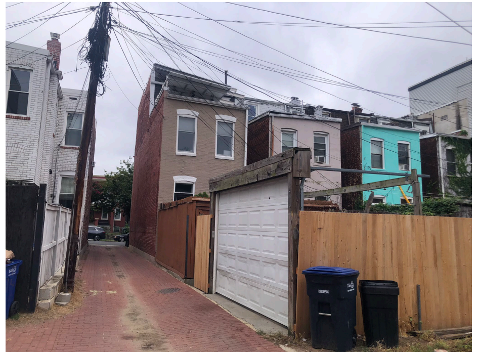
VIEW FROM ALLEY, LOOKING EAST