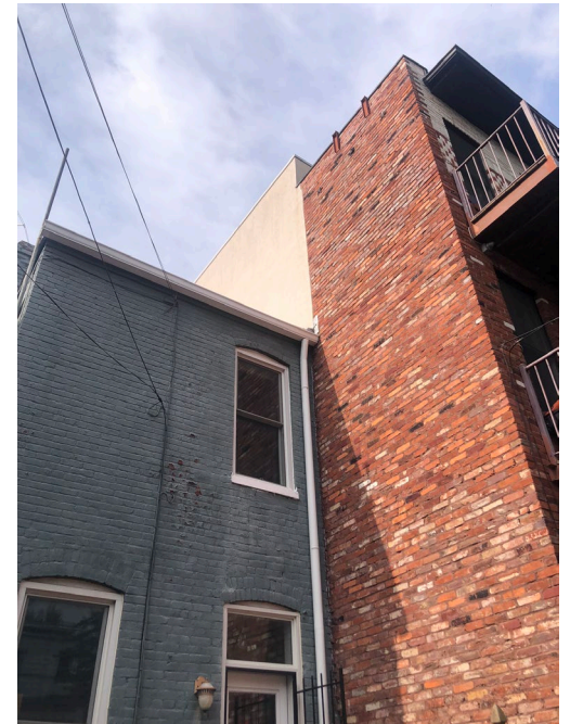
EXISTING REAR FAÇADE, FACING WEST