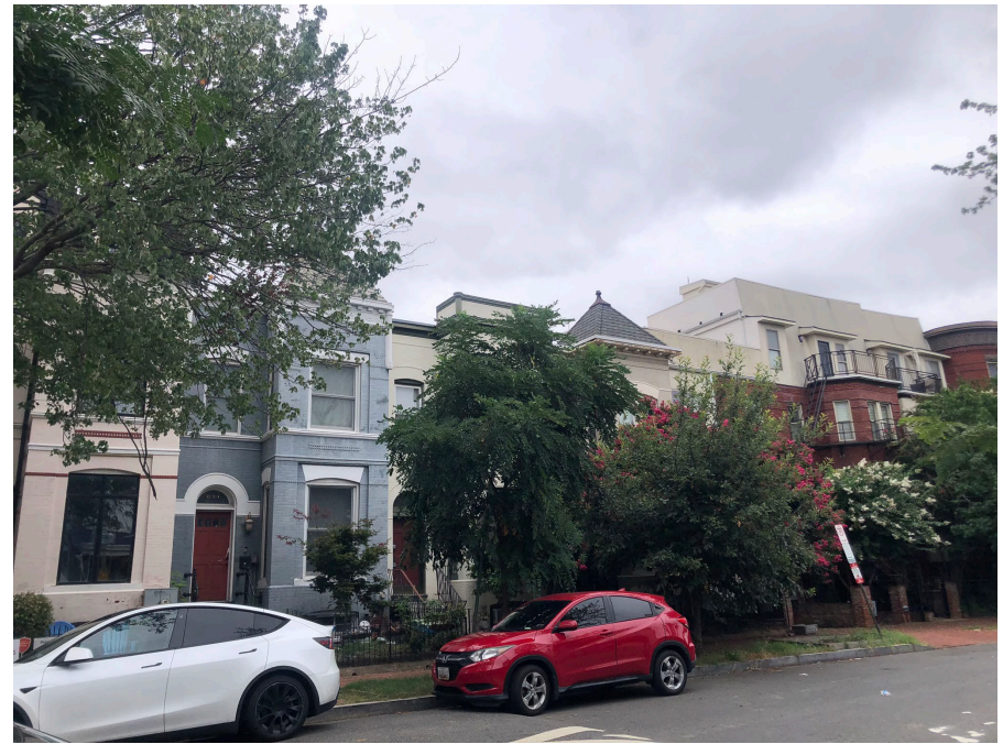
STREET VIEW, LOOKING EAST