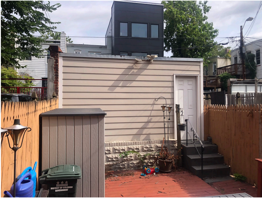
EXISTING ONE-STORY GARAGE(VIEW FROM REAR YARD)