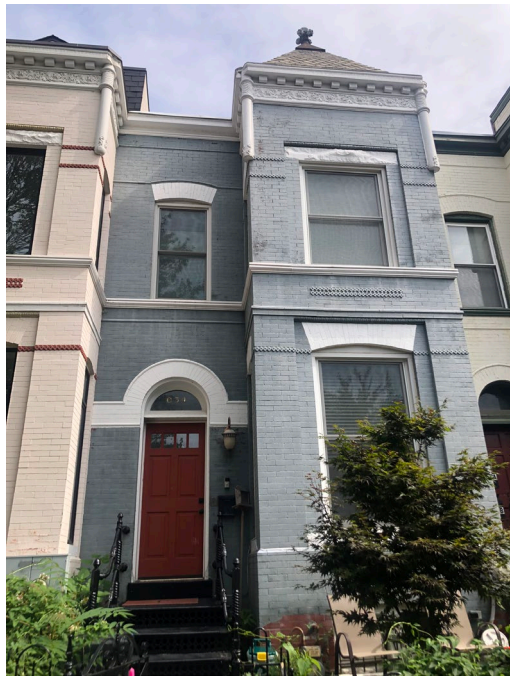
EXISTING FRONT FACADE