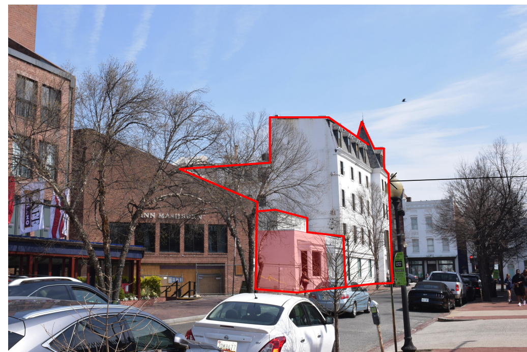
3. View from West, Prospect Street