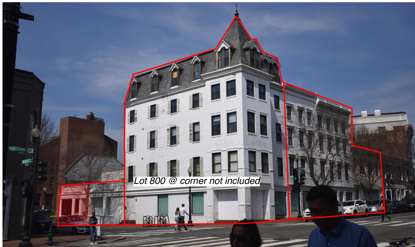
1. View from corner, south east along Wisconsin Ave, Prospect Intersection