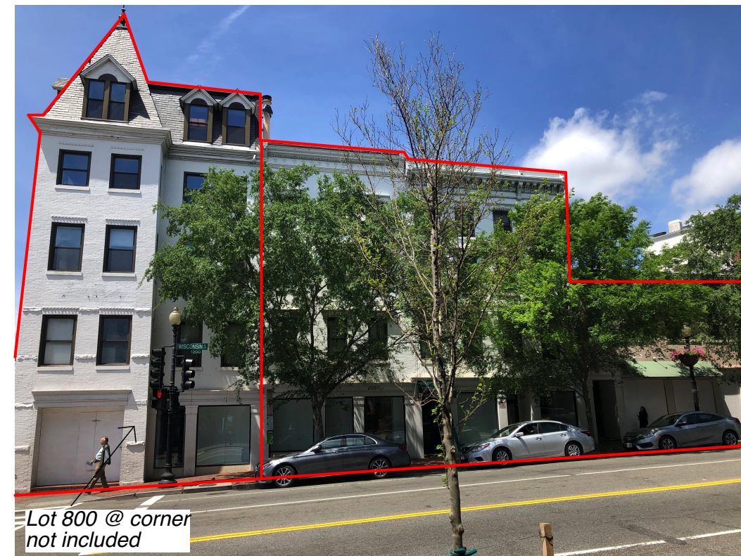
2. View from Wisconsin Ave