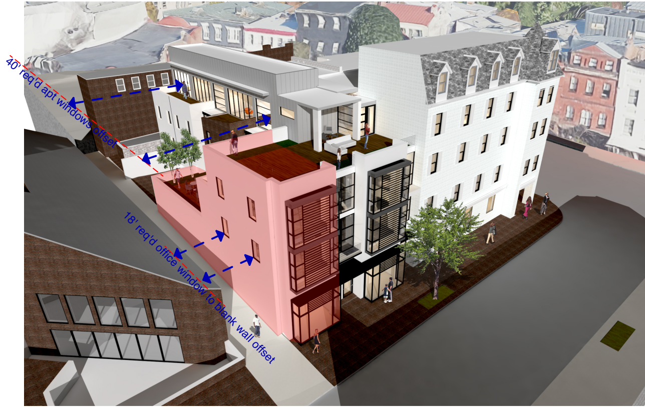
3. View along Prospect Street Elevation