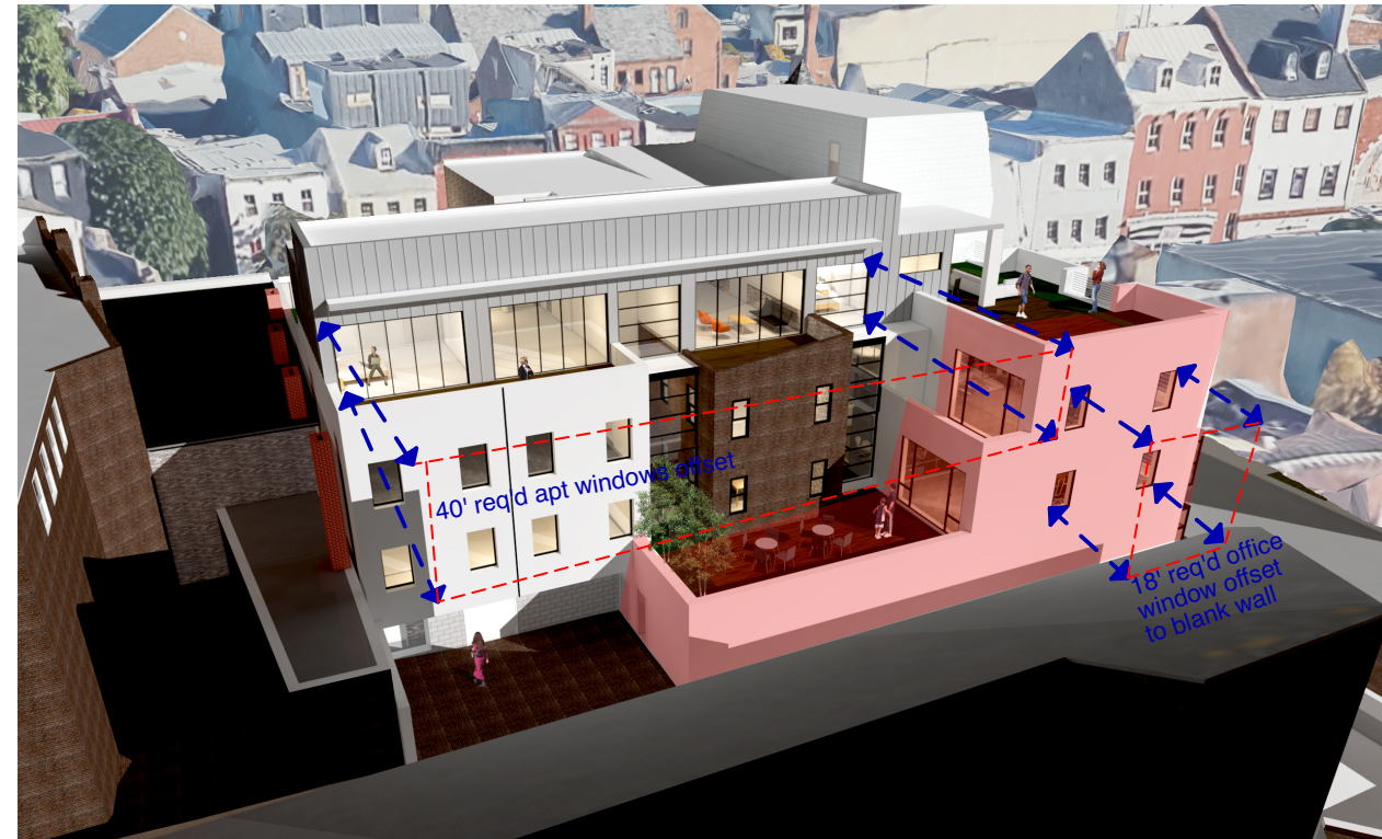
4. View from West towards side Alley