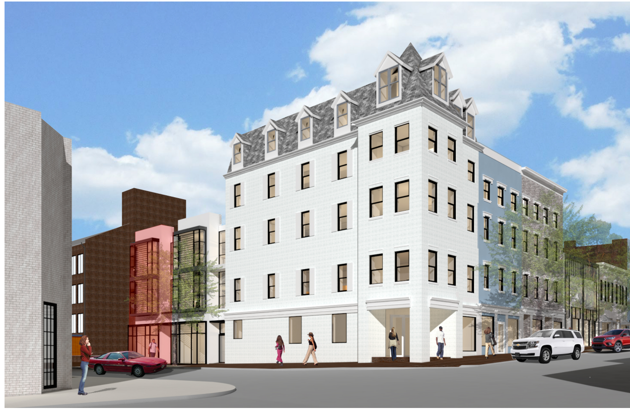
1. View from Wisconsin Ave & Prospect Street