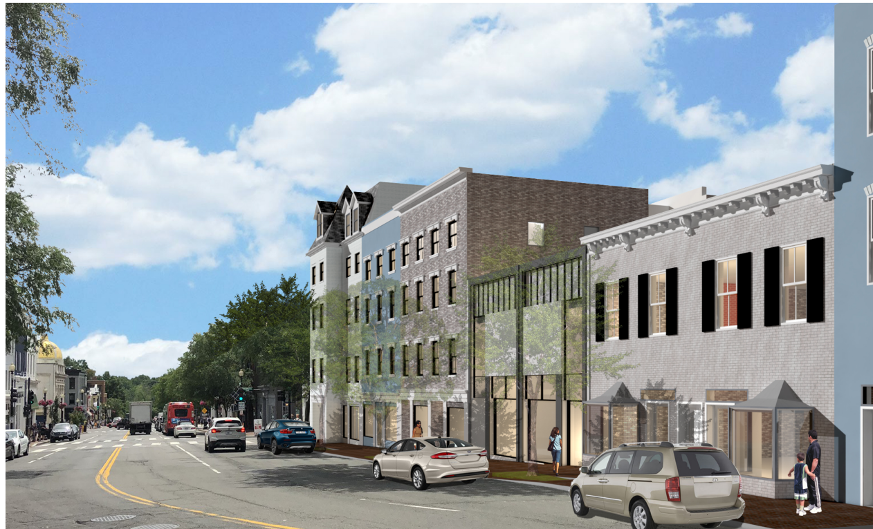
2. View along Wisconsin Ave towards South