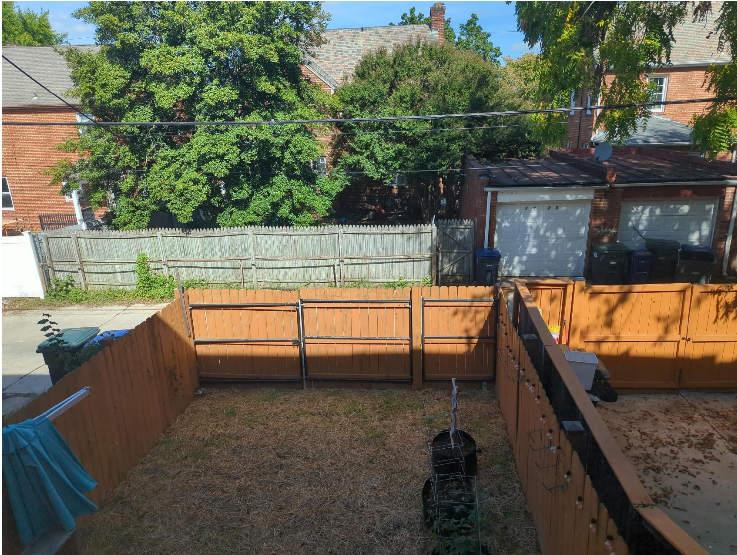
View from House Facing North Showing Extent of Shadow from Buildings at Noon

Picture Taken Facing North on 10/03/2025 at ~12:45 PM