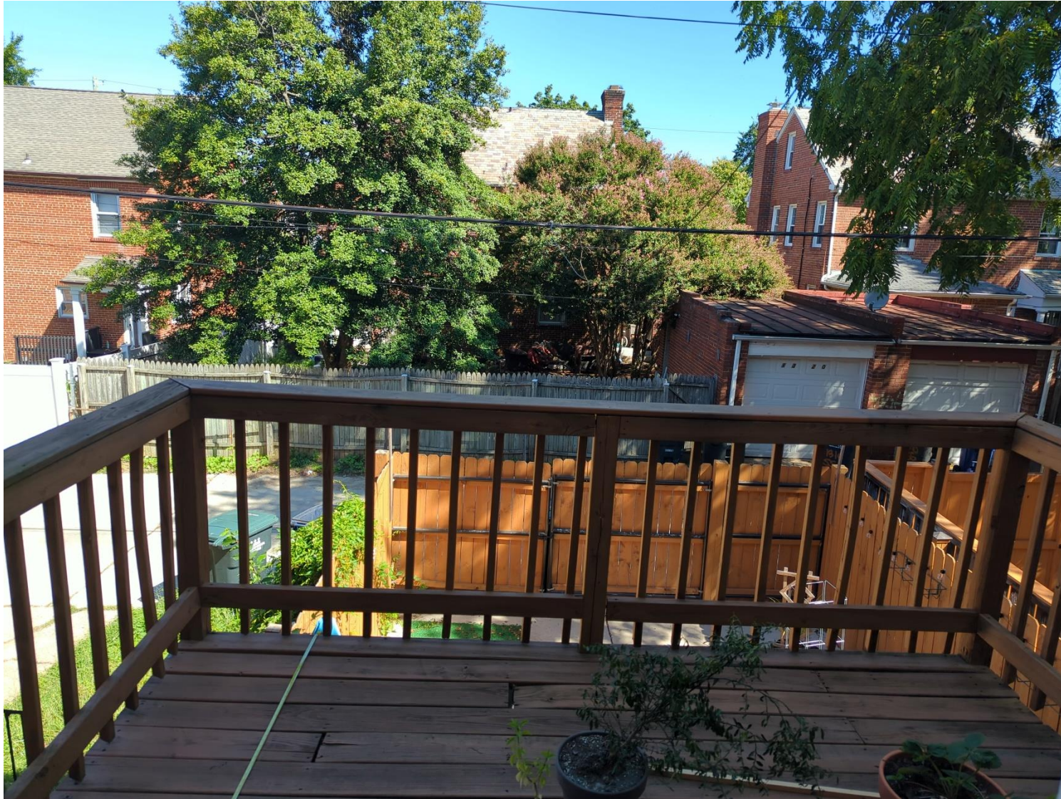
View from Original Deck

Picture Taken Facing North on 08/27/2025