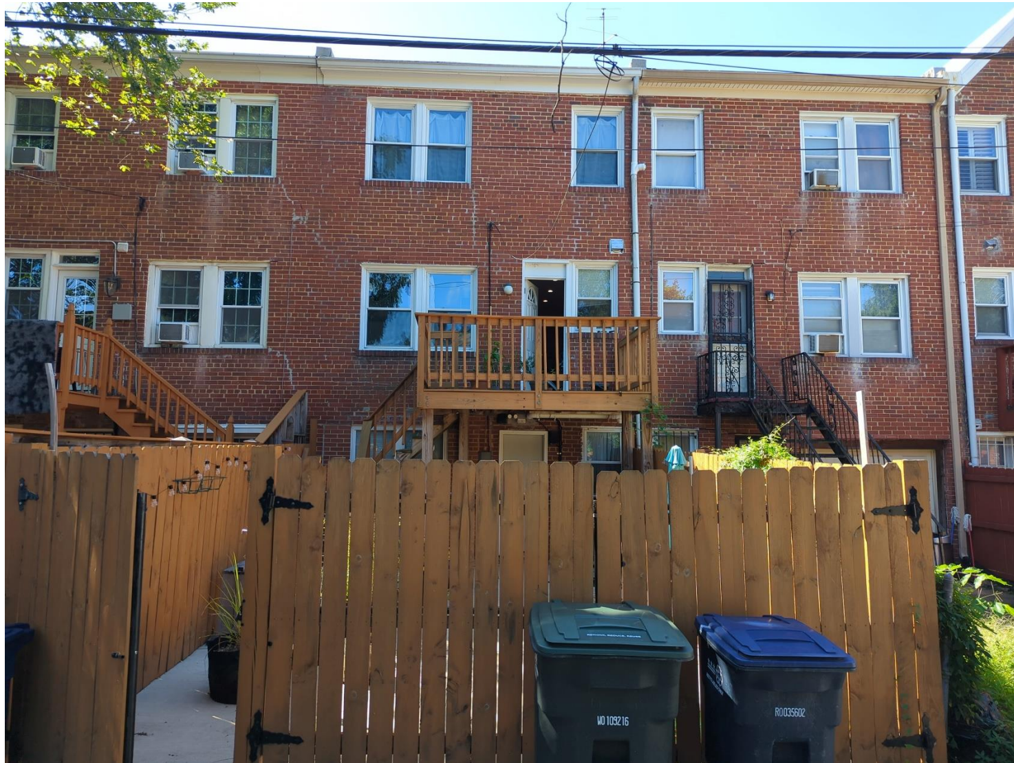
Property Rear with Original Deck and Stairs