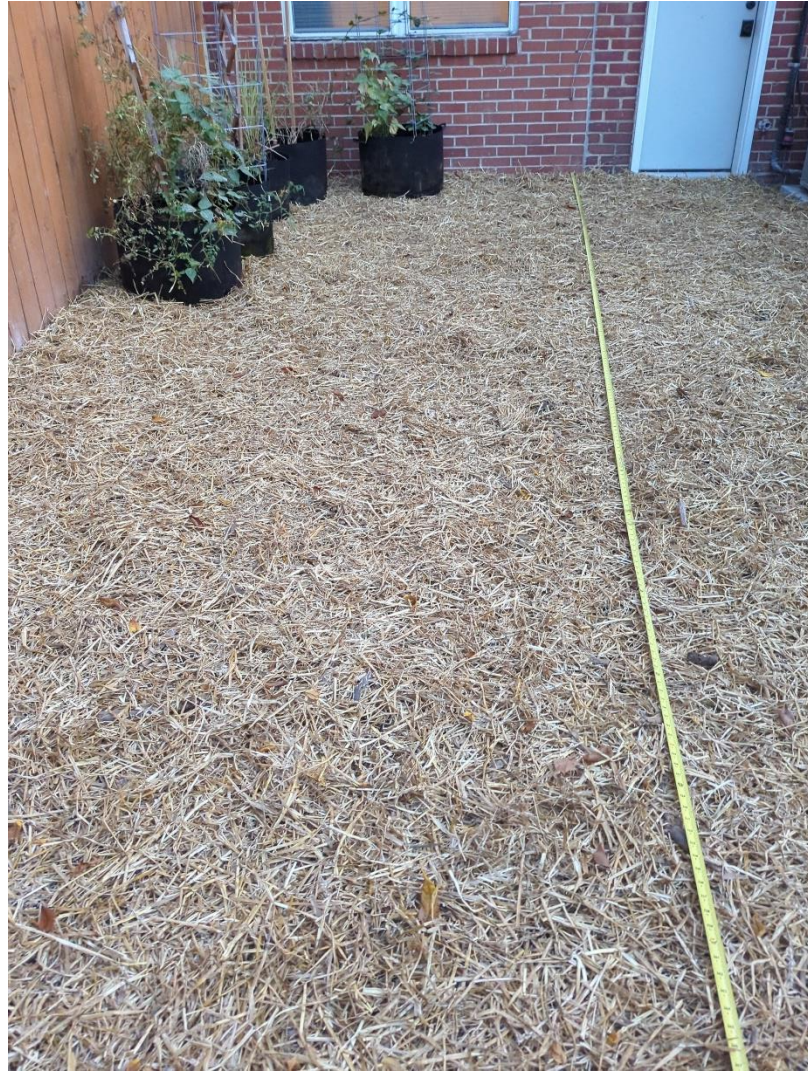
View from Gate in Rear Yard Facing South Towards House

Picture Taken Facing South on 09/15/2025