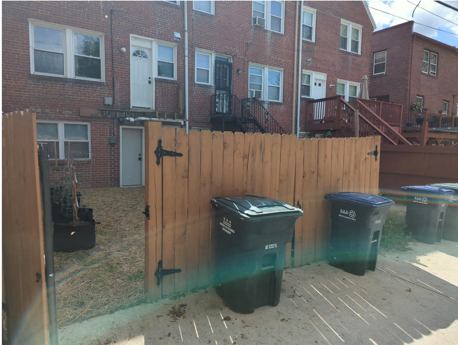
View from Alley into Rear Yard Picture Taken Facing Southwest on 10/02/2025