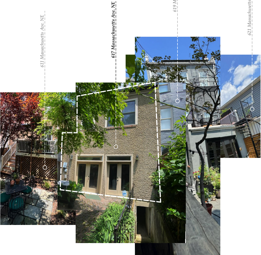
Alley Streetscape N.T.S.

MICHAEL PATRICK ROUSE a r c h i t e c t u r e