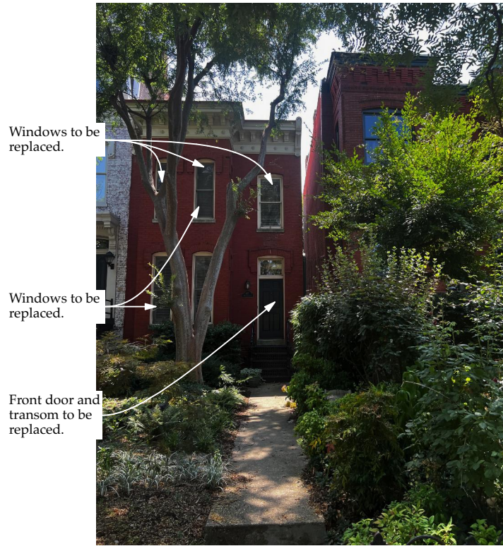
EX. North (Massachusetts Ave. NE) Elevation N.T.S.