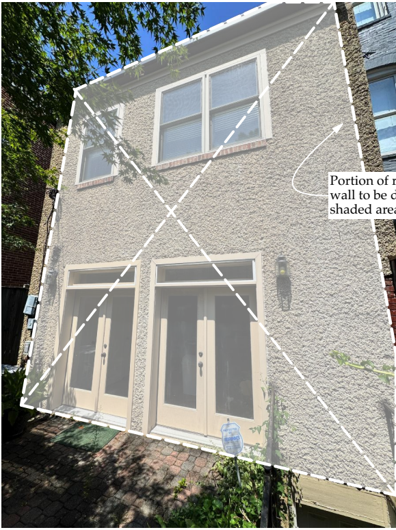
EX. South (Rear) Elevation N.T.S.