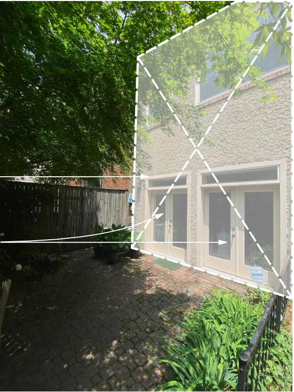
EX. Northeast (Rear) Elevation N.T.S.