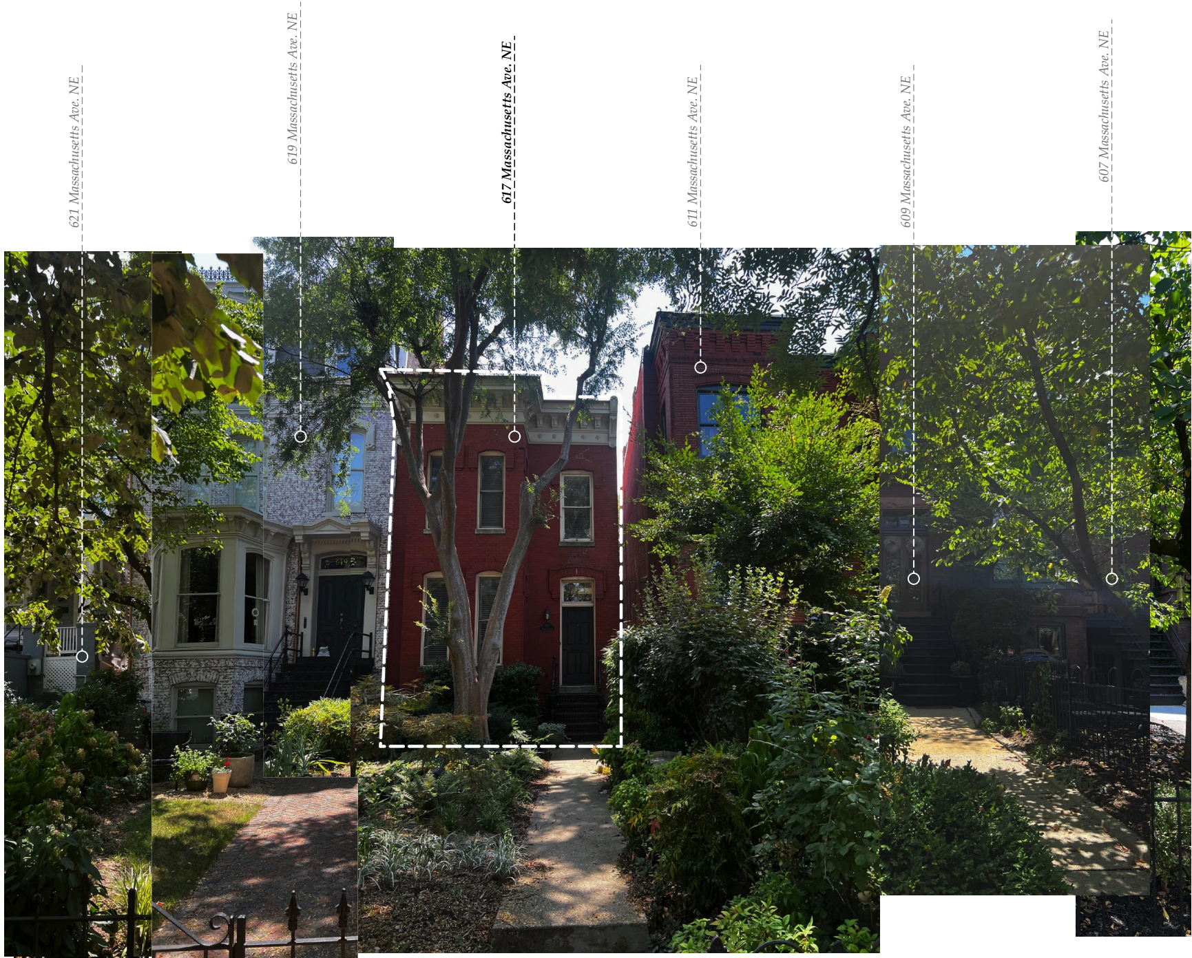
Massachusetts Ave. NE Streetscape N.T.S.