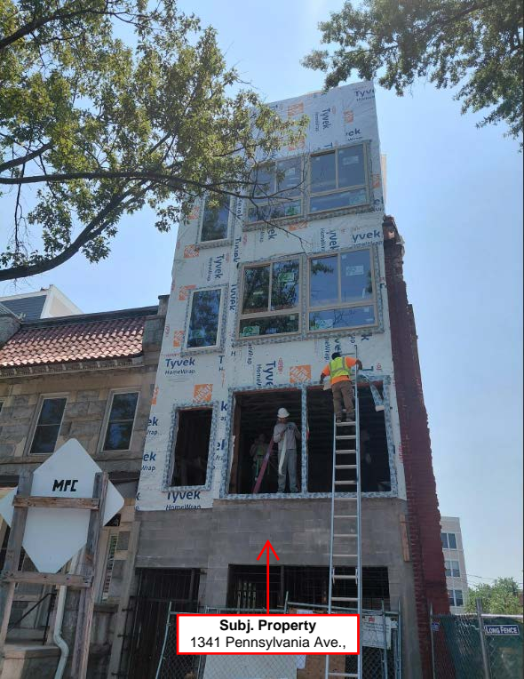
Subj. Property 1341 Pennsylvania Ave.,