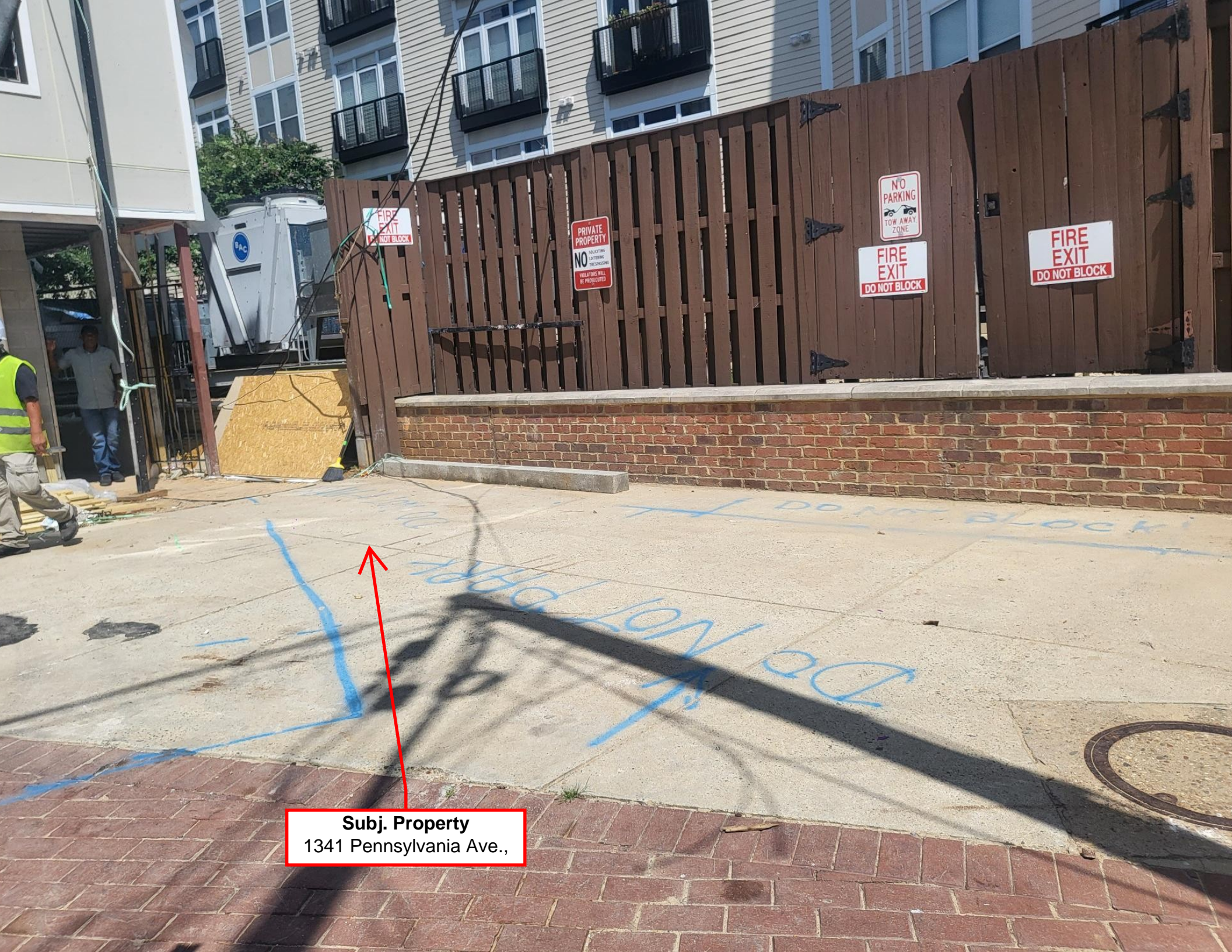
Subj. Property 1341 Pennsylvania Ave.,