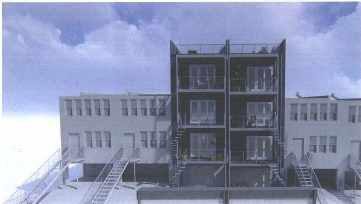
June 21 st , 10 AM