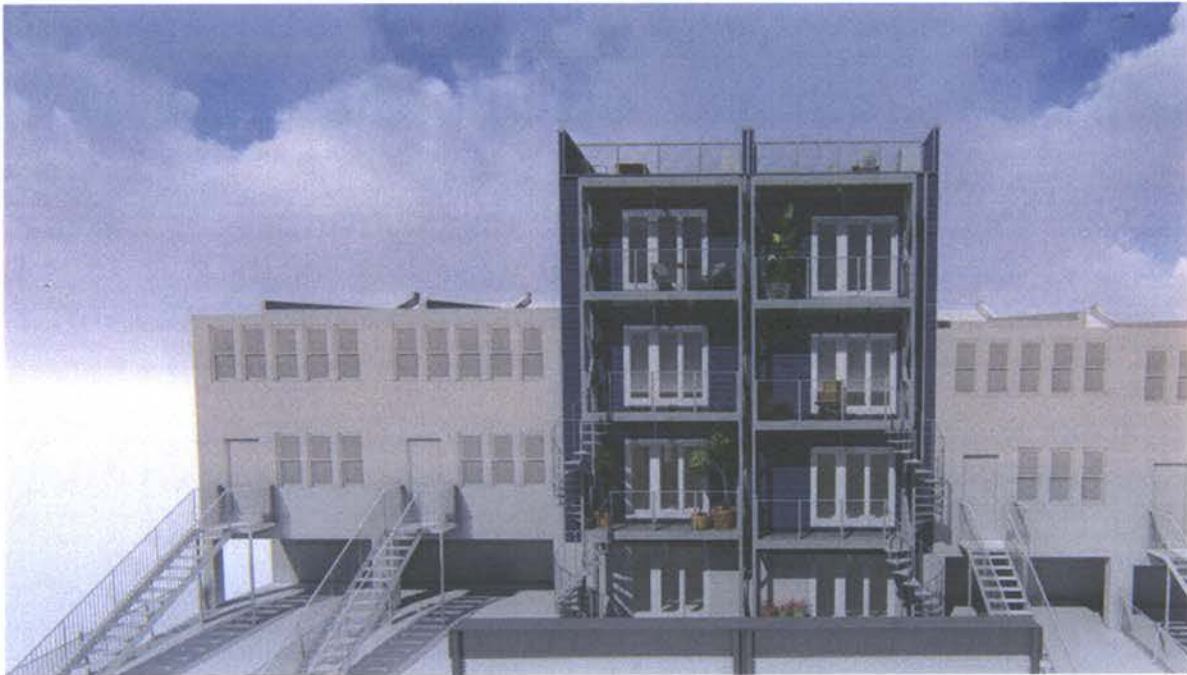
June 21 st , 3 PM