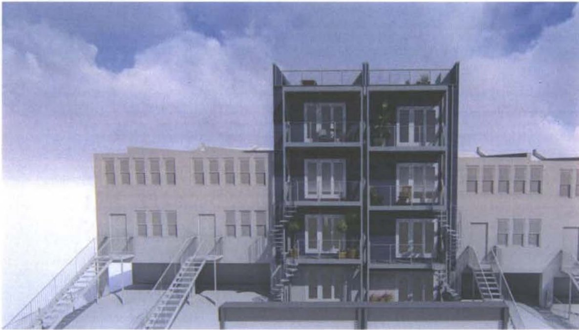
June 21 st , 11 AM