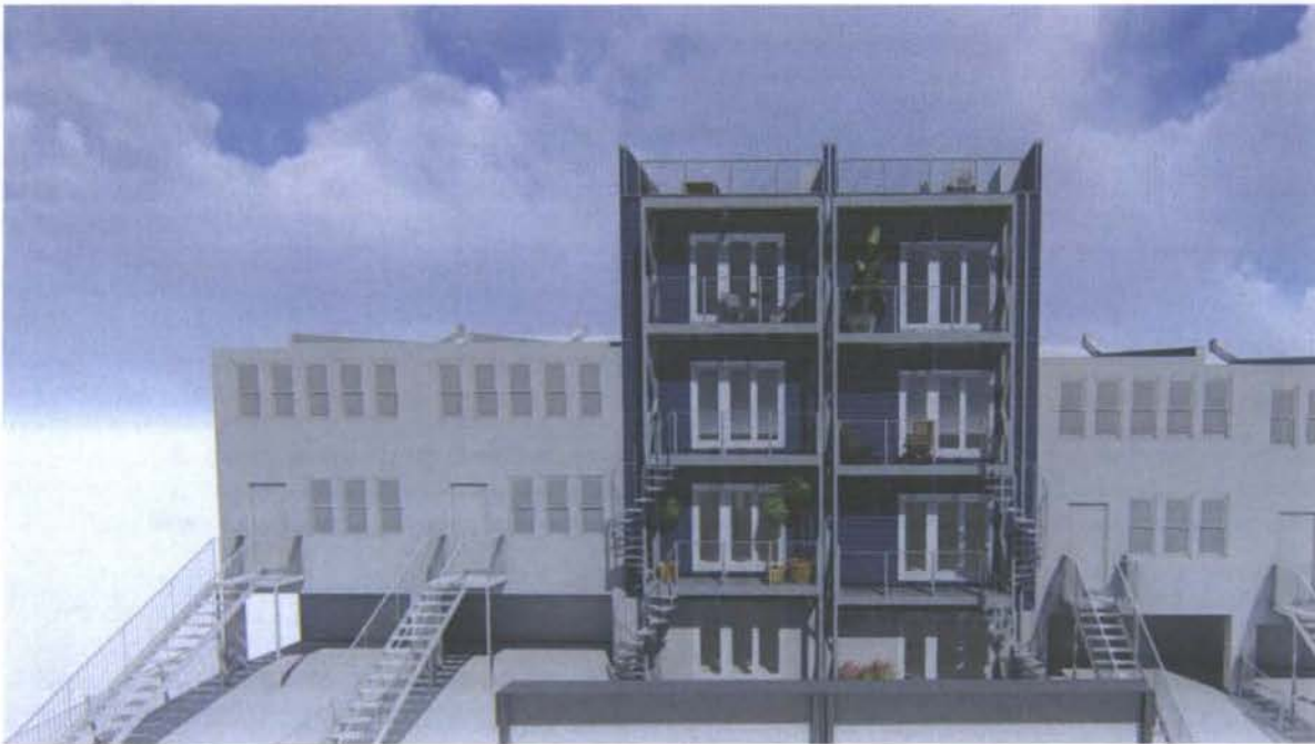
June 21 st , 12 PM