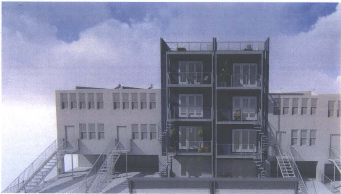
June 21 st , 5 PM