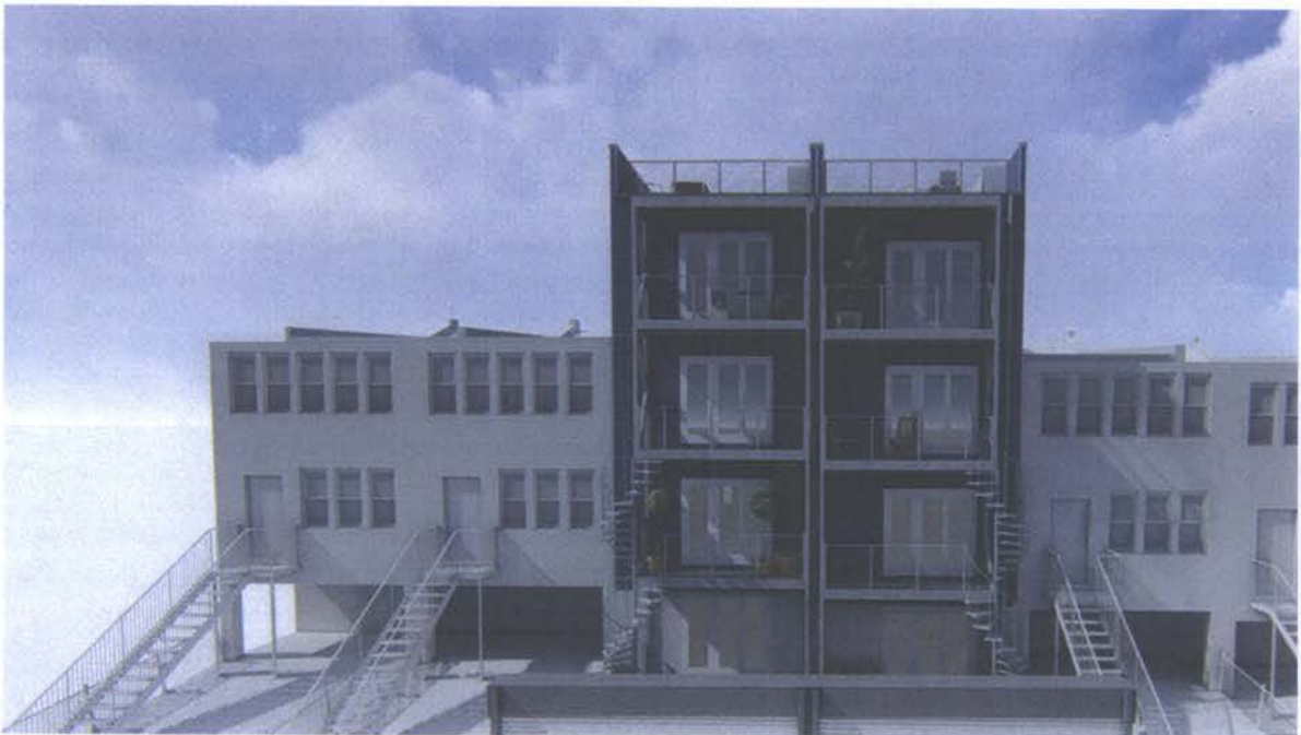
June 21 st , 6 PM