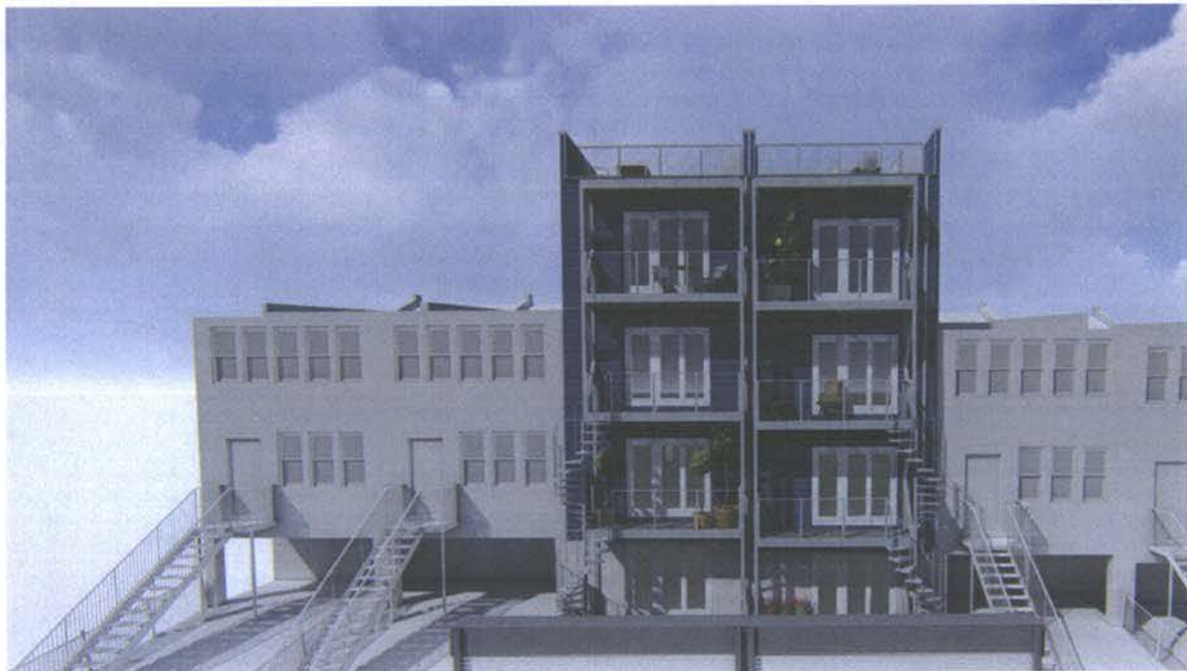
June 21 st , 4 PM