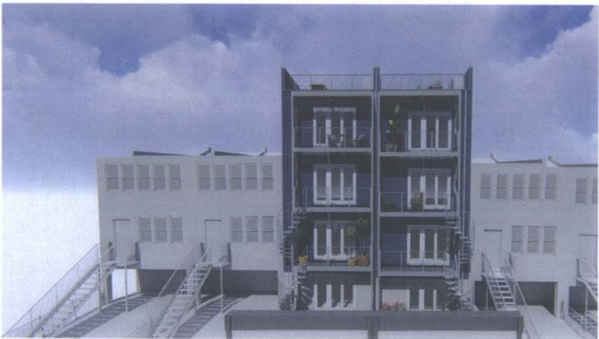
June 21 st , 2 PM