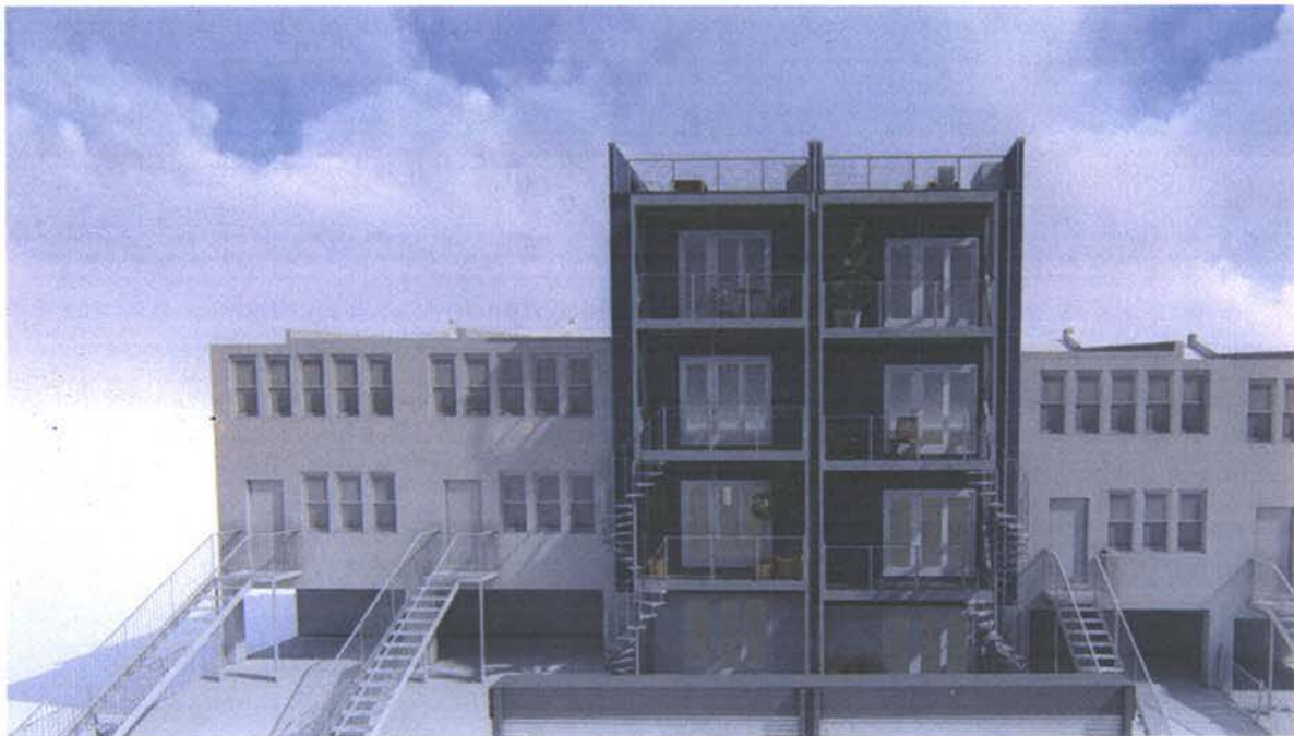
June 21 st , 9 AM