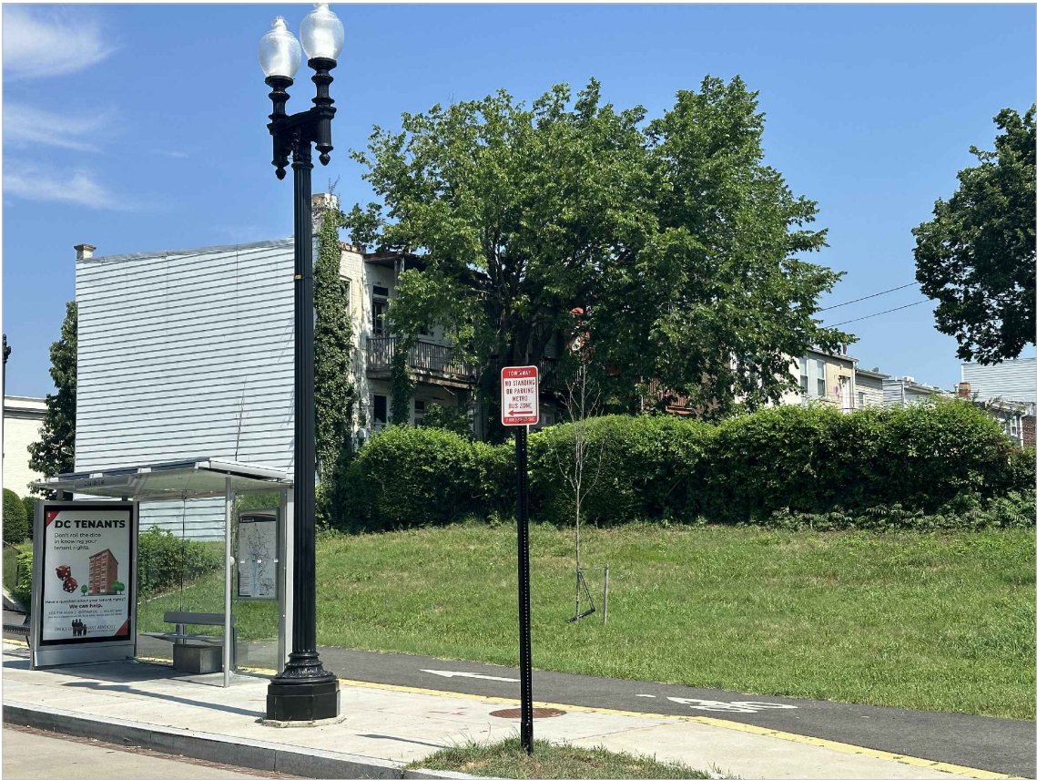
view of rear facade from C Street NE

OLD CITY DESIGN STUDIO® 1317 D ST, NE WASHINGTON, DC 20002 202. 455. 6237 OldCityDesign.us