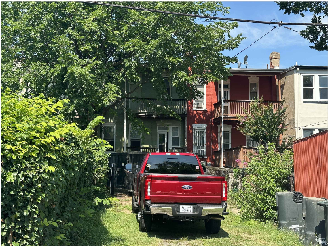
view of rear facade from alley