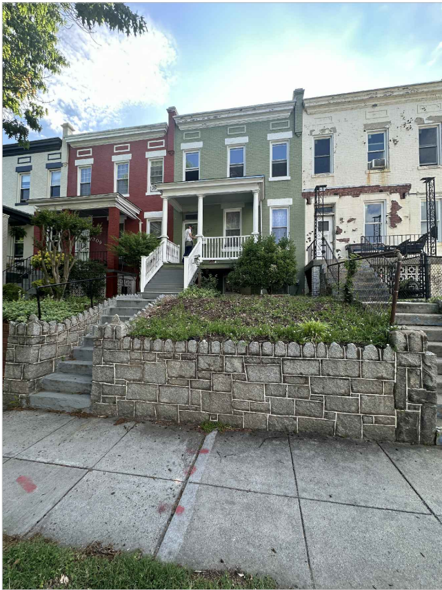
view from 15th Street NE