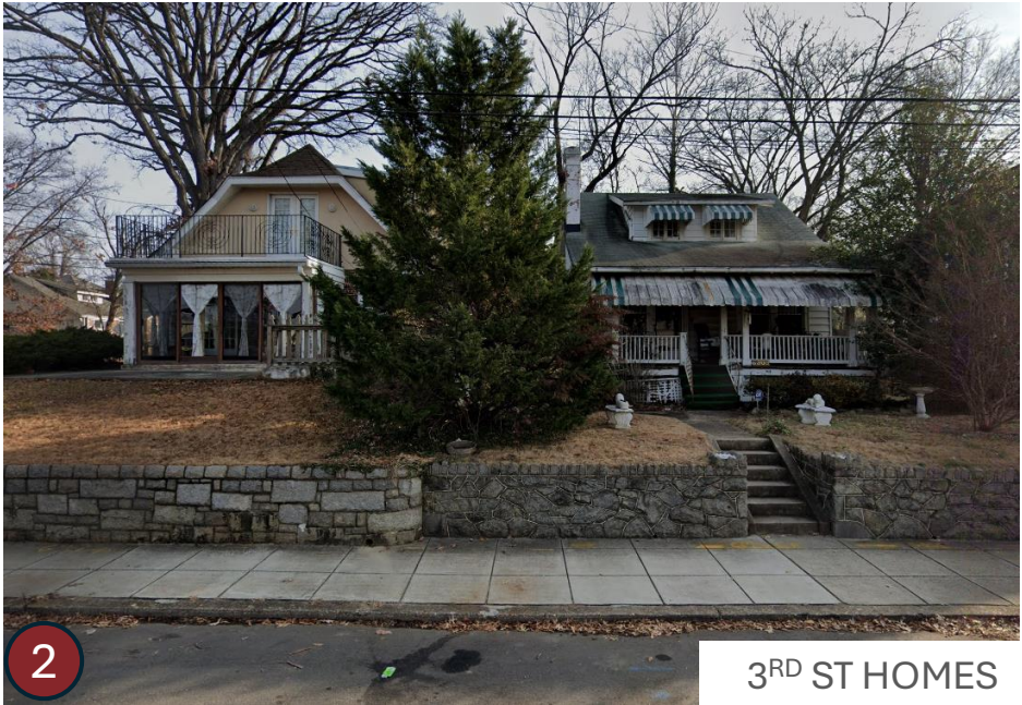
3 RD ST HOMES