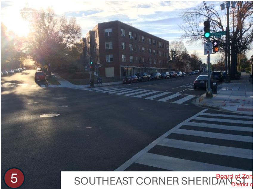
SOUTHEAST CORNER SHERIDAN ST

Board of Zoning Adjustment District of Columbia CASE NO.21345 EXHIBIT NO.4