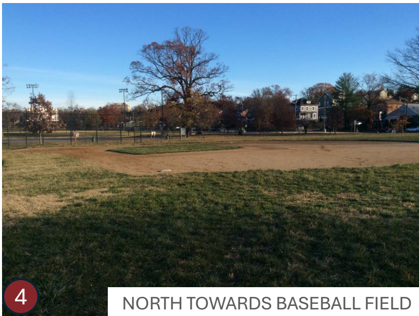
NORTH TOWARDS BASEBALL FIELD