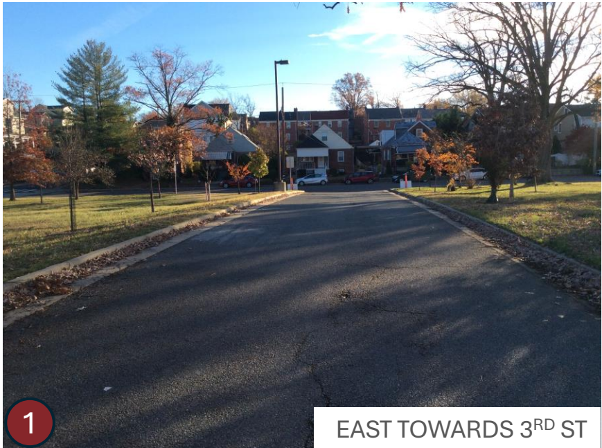
EAST TOWARDS 3 RD ST

THE SITE IS SITUATED IN A MOSTLY RESIDENTIAL AREA. IT ALSO HAS SOME BUSINESSES INCLUDING A DAY CARE ADJACENT TO THE SITE. COOLIDGE HIGH SCHOOL AND IDA B WELLS ARE SITUATED TO THE WEST AND WHITTIER ELEMENTARY IS SITUATED TO THE SOUTHWEST, SOUTH OF COOLIDGE AND IDA B. WELLS.