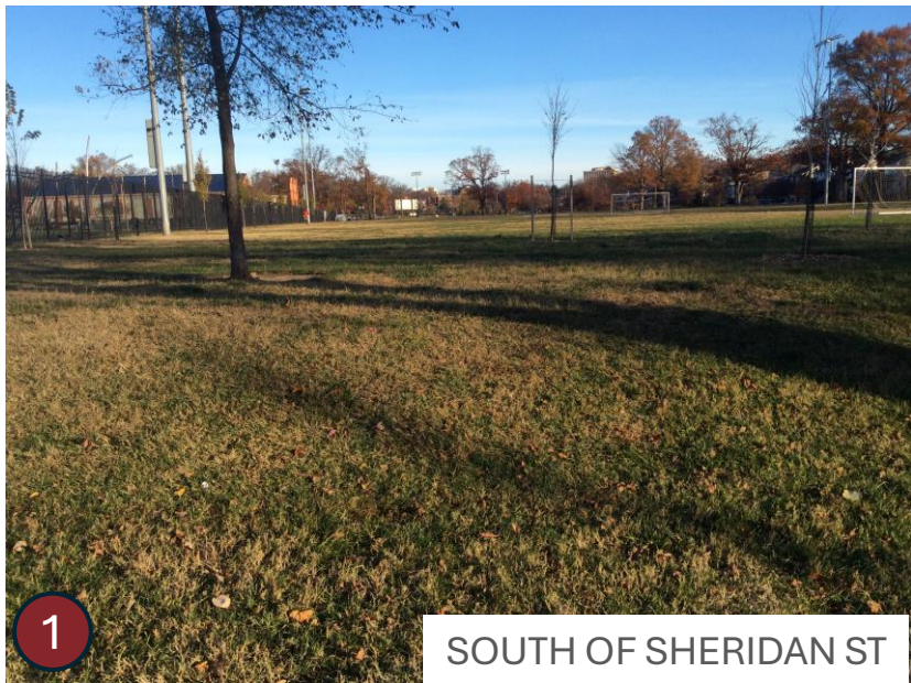
SOUTH OF SHERIDAN ST

IMMEDIATELY TO THE NORTH THE SITE HAS A BASEBALL FIELD AND THE TAKOMA PARK AQUATIC CENTER. TO THE SOUTH IS A SOCCER FIELD. TO THE WEST IS THE TRACK AND FIELD BELIEVED TO BE USED BY COOLIDGE HIGH SCHOOL AND IDA B. WELLS, BUT IS ALSO ACCESSIBLE TO THE PUBLIC. TO THE EAST IS 3 RD STREET, THAT IS LINED WITH SEVERAL HERITAGE TREES.