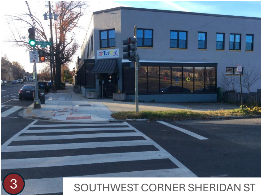
SOUTHWEST CORNER SHERIDAN ST