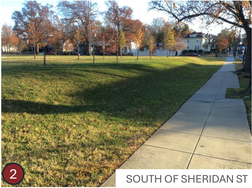
SOUTH OF SHERIDAN ST