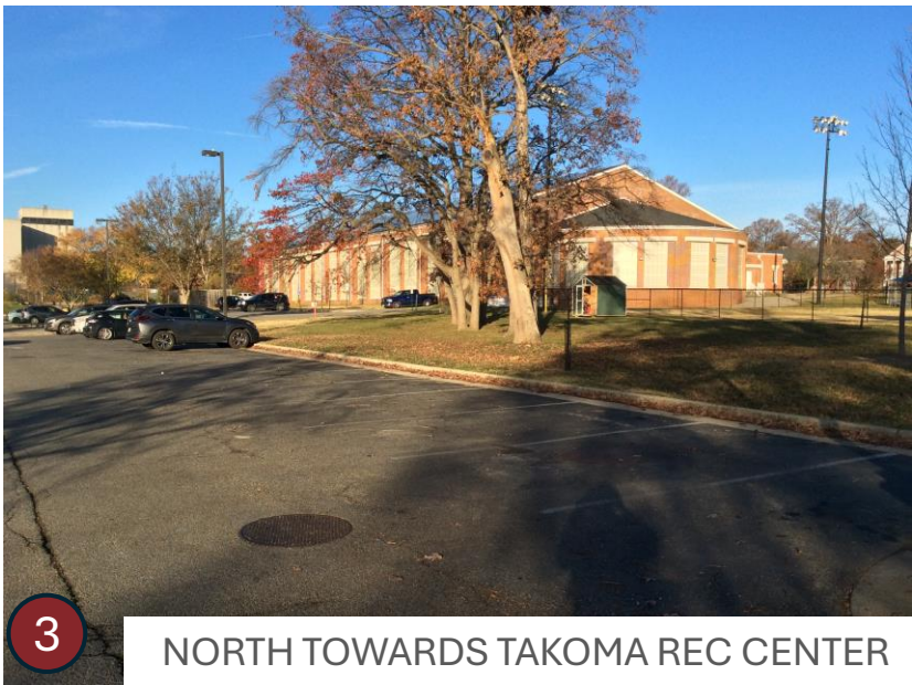
NORTH TOWARDS TAKOMA REC CENTER