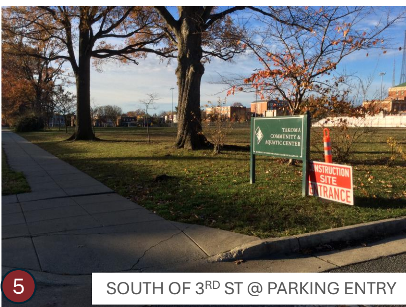
SOUTH OF 3 RD ST @ PARKING ENTRY