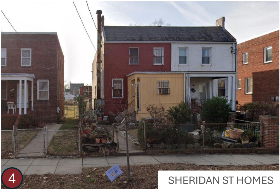
SHERIDAN ST HOMES