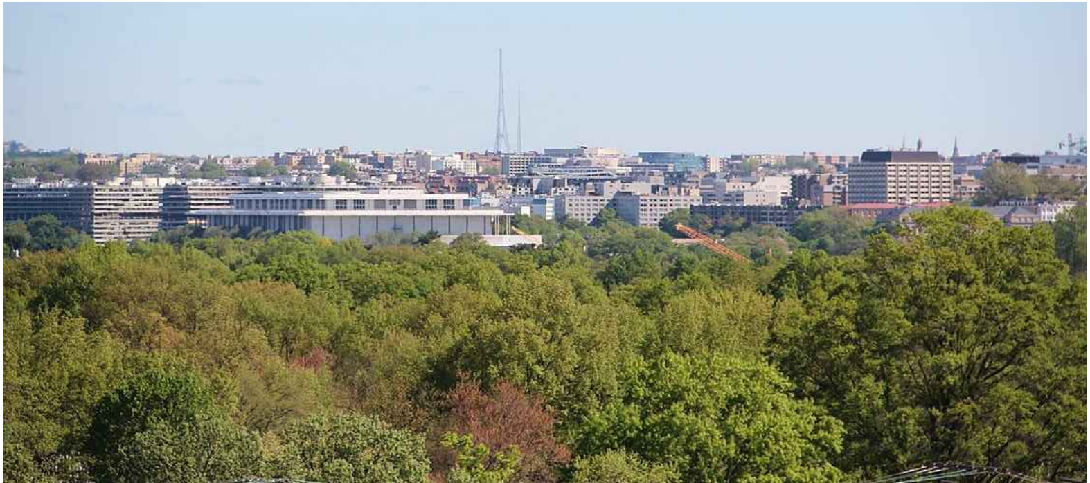
ARIEL VIEW FROM THE U.S AIR FORCE MEMORIAL IN ARLINGTON