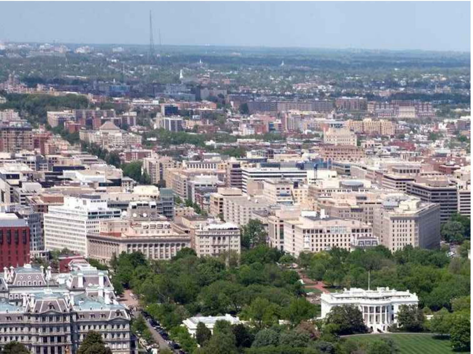
ARIEL VIEW OF EXISTING TOWERS IN RELATION TO THE WHITE HOUSE