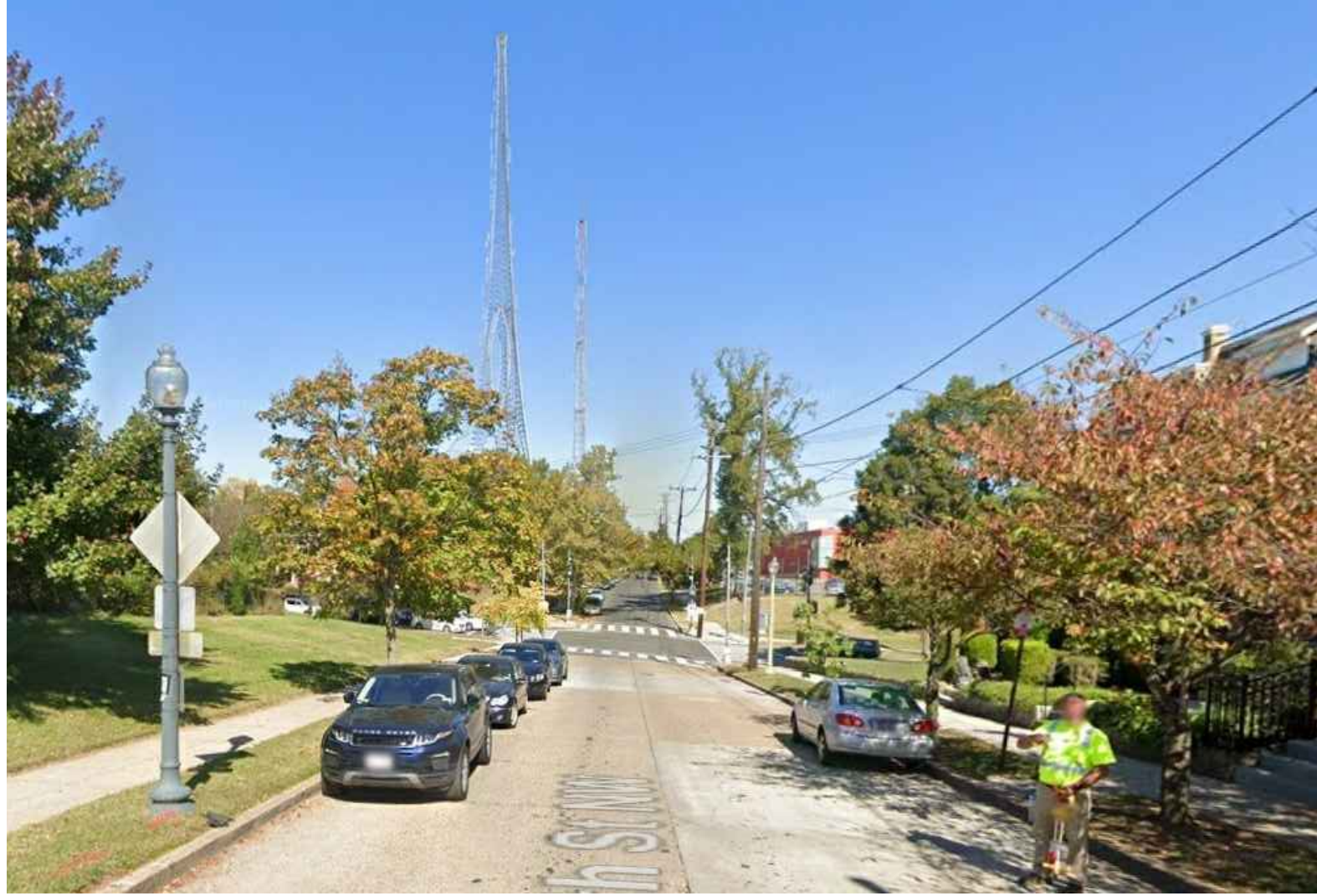
EYE LEVEL VIEW OF THE TOWERS FROM 9TH ST NW