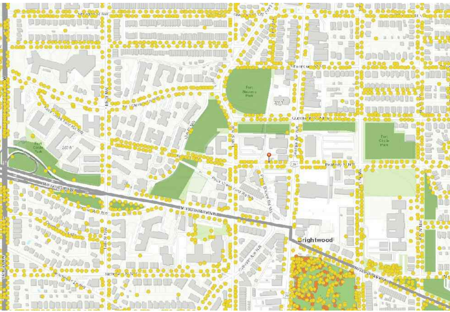
DC TREE MAP WITHIN APPROX. 0.25 MILE FROM THE EXISTING TOWER