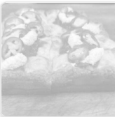
detroit - popper