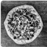
ny thin - veggie supremo