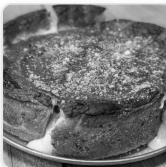
chicago - craft it