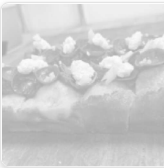
detroit - chevelle