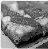
detroit - "plain cheese" or craft it