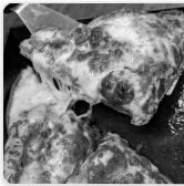
nonna "grandma" - double mozzarella "plain cheese" or craft it