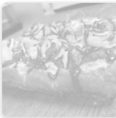
detroit - road runner