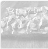
detroit - firebird