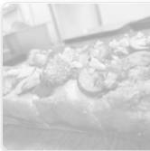
detroit - shelby