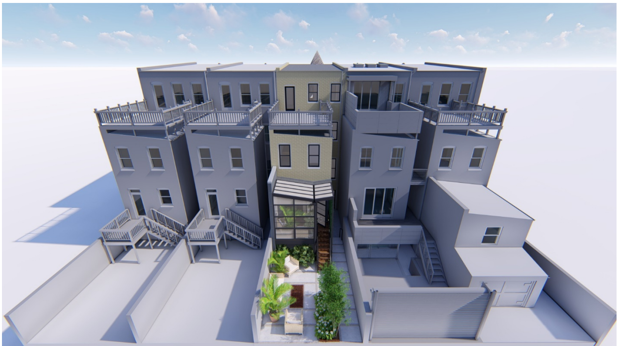
June 21 st , 10 AM