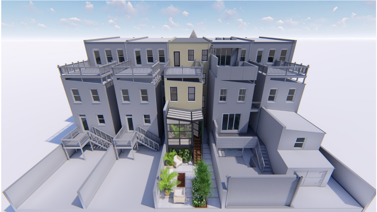
June 21 st , 11 AM