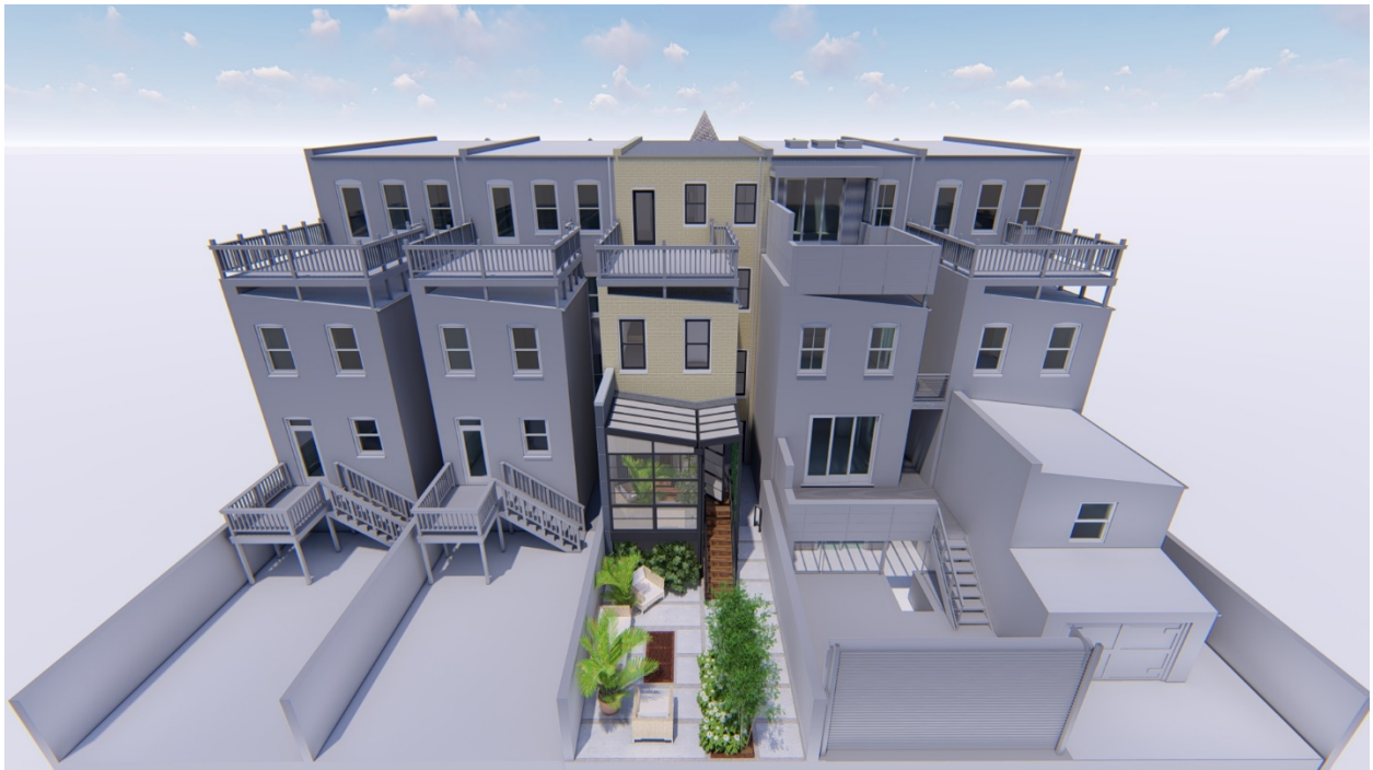
June 21 st , 2 PM