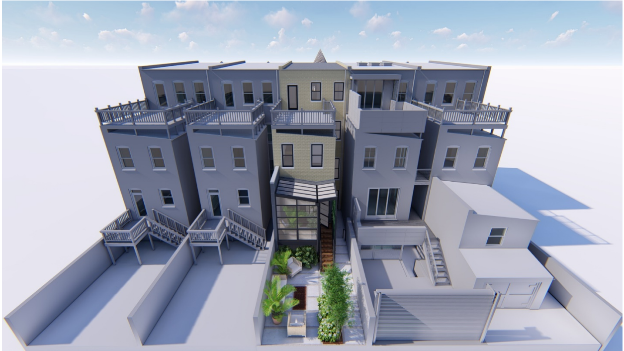
June 21 st , 5 PM