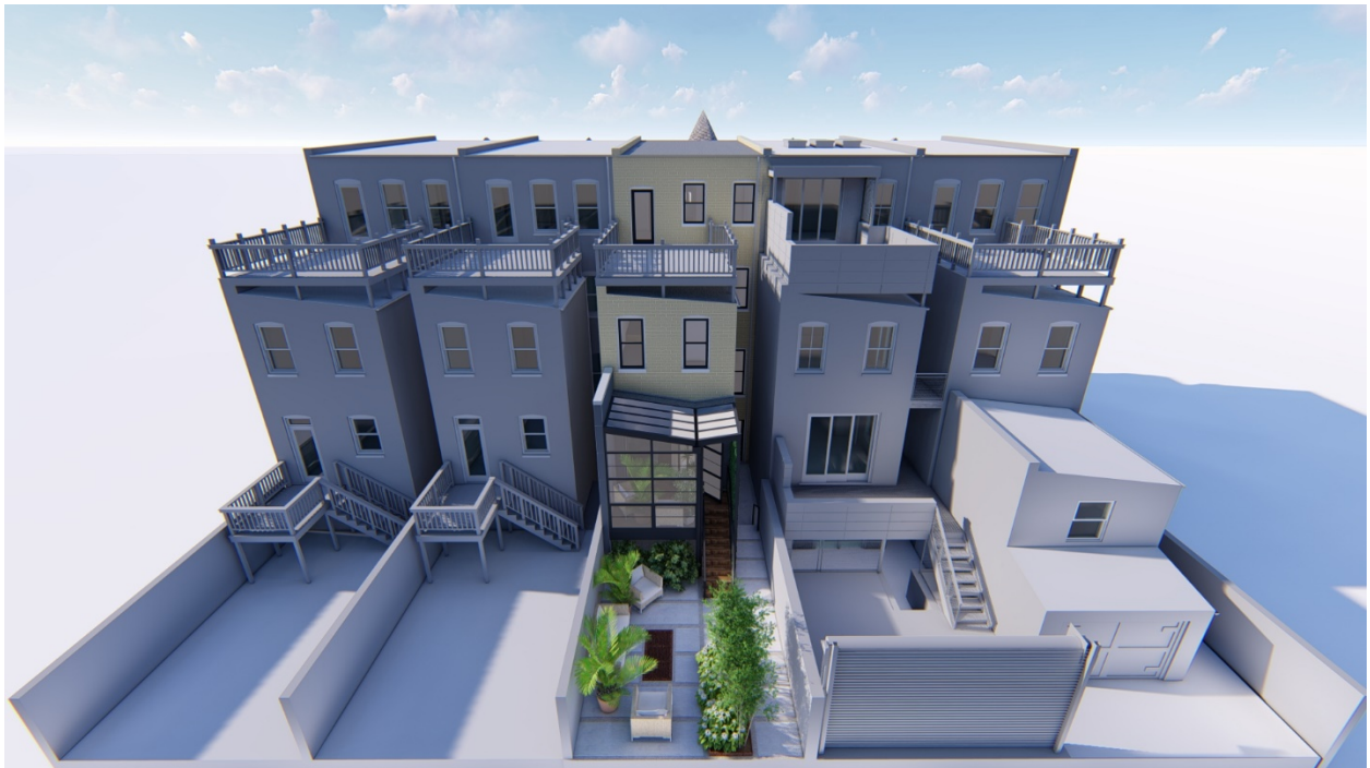
June 21 st , 6 PM