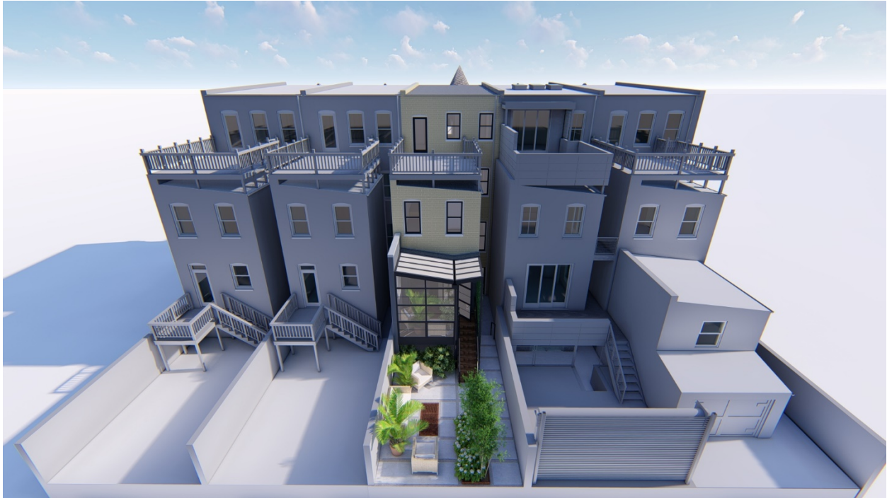
June 21 st , 9 AM