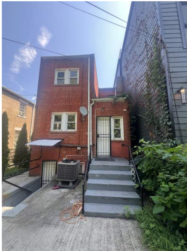
1. WEST(REAR) FAÇADE OF SUBJECT PROPERTY FROM THE REAR YARD.