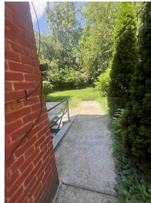
4. VIEW OF REAR YARD FROM DETACHED SIDE OF SUBJECT PROPERTY.