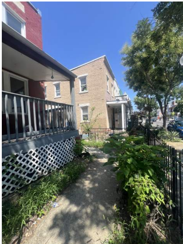
3. VIEW OF 2712 SHERMAN AVE NW FROM FRONT OF SUBJECT PROPERTY.