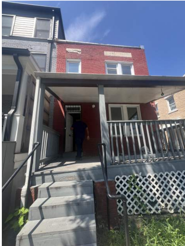
1. EAST(FRONT) FAÇADE OF SUBJECT PROPERTY FROM SHERMAN AVE NW.