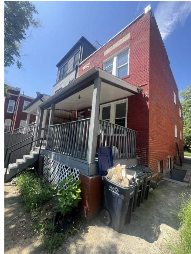
2. VIEW TOWARDS 2708 SHERMAN AVE NW FROM FRONT YARD OF PROPERTY.