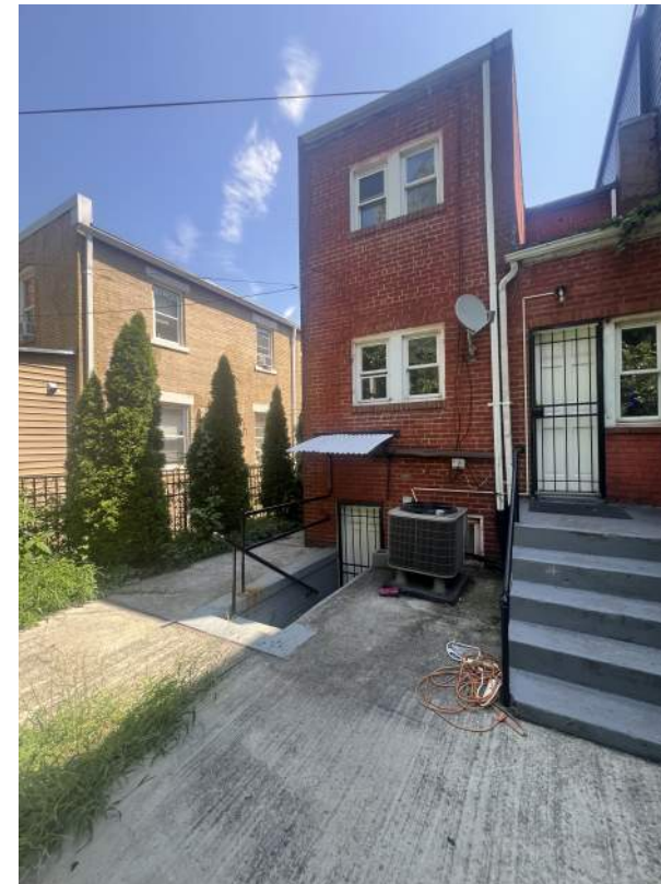
2. VIEW TOWARDS 2712 SHERMAN AVE NW FROM REAR YARD OF PROPERTY.