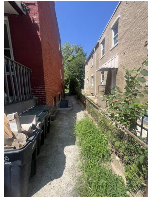
4. VIEW OF WALKWAY ALONG DETACHED SIDE OF SUBJECT PROPERTY.