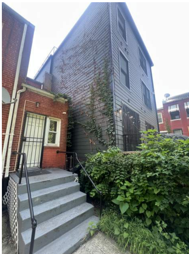
3. VIEW OF 2708 SHERMAN AVE NW FROM REAR OF SUBJECT PROPERTY.