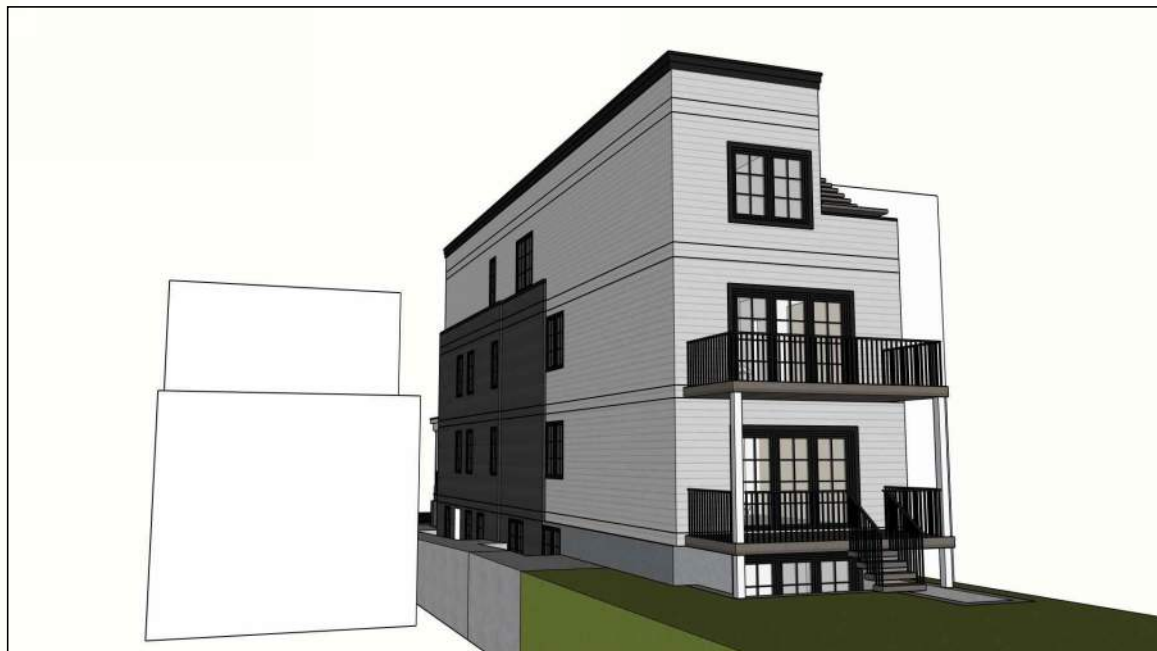
3. WEST (REAR) FACADE OF SUBJECT PROPERTY FROM THE REAR YARD.