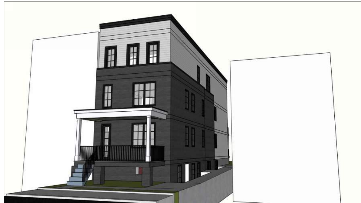
2. EAST (FRONT) FACADE OF SUBJECT PROPERTY FROM SHERMAN AVE NW.