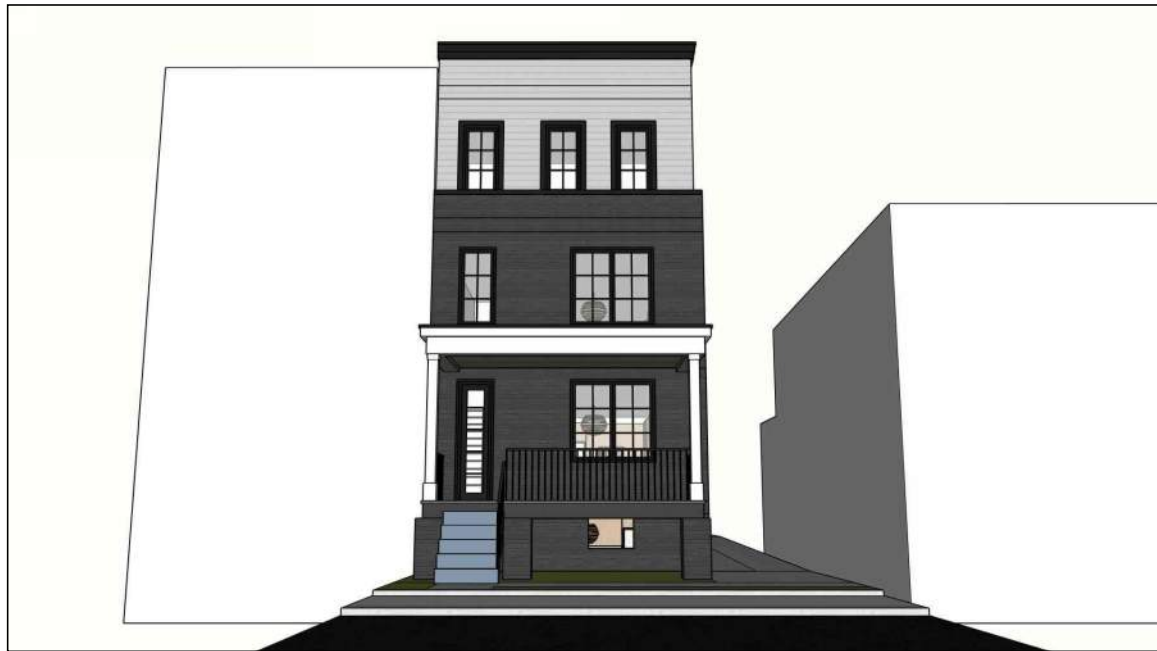
1. EAST (FRONT) FACADE OF SUBJECT PROPERTY FROM SHERMAN AVE NW.