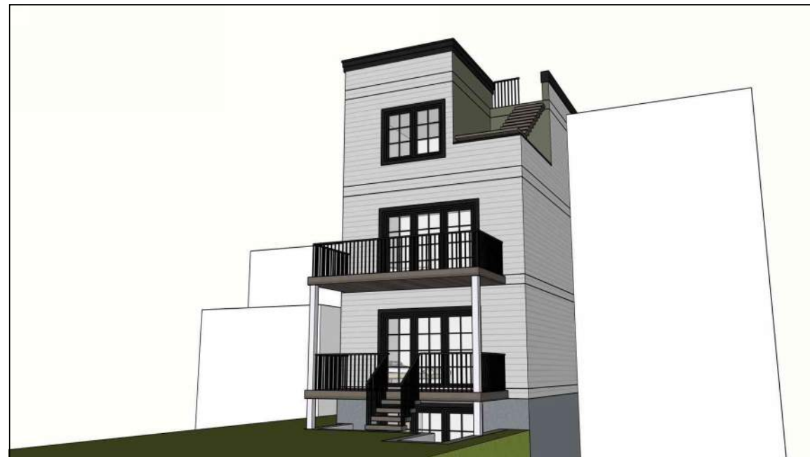
4. WEST (REAR) FACADE OF SUBJECT PROPERTY FROM THE REAR YARD.