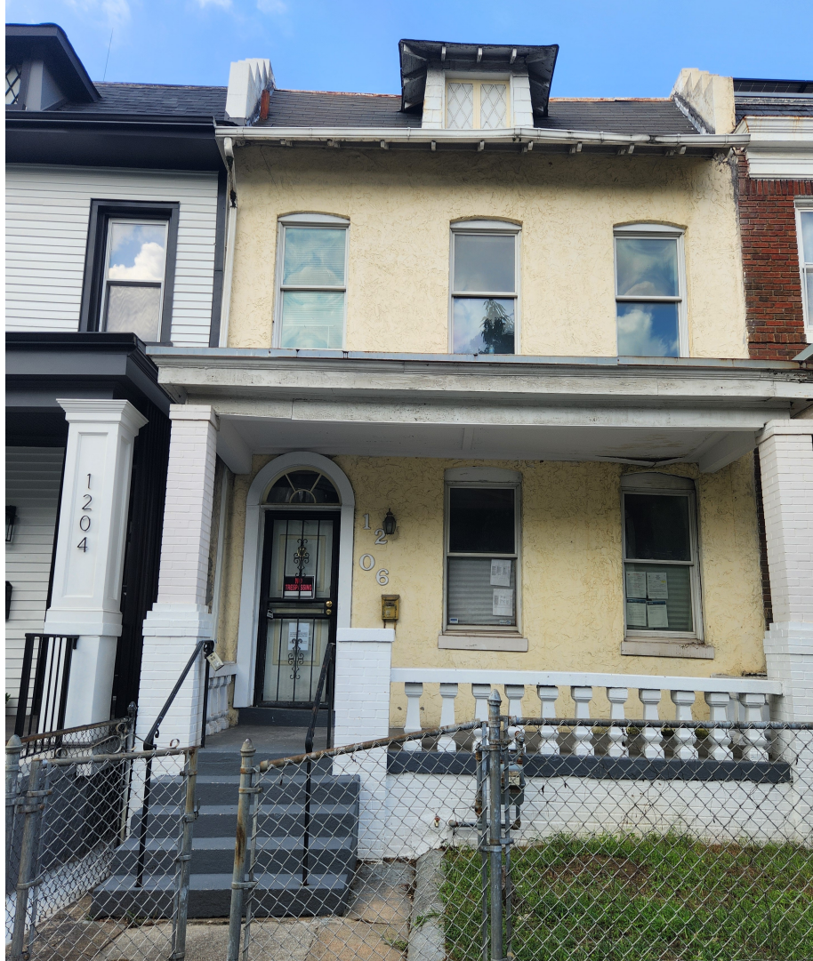
1206 Staples Street NE – Front profile