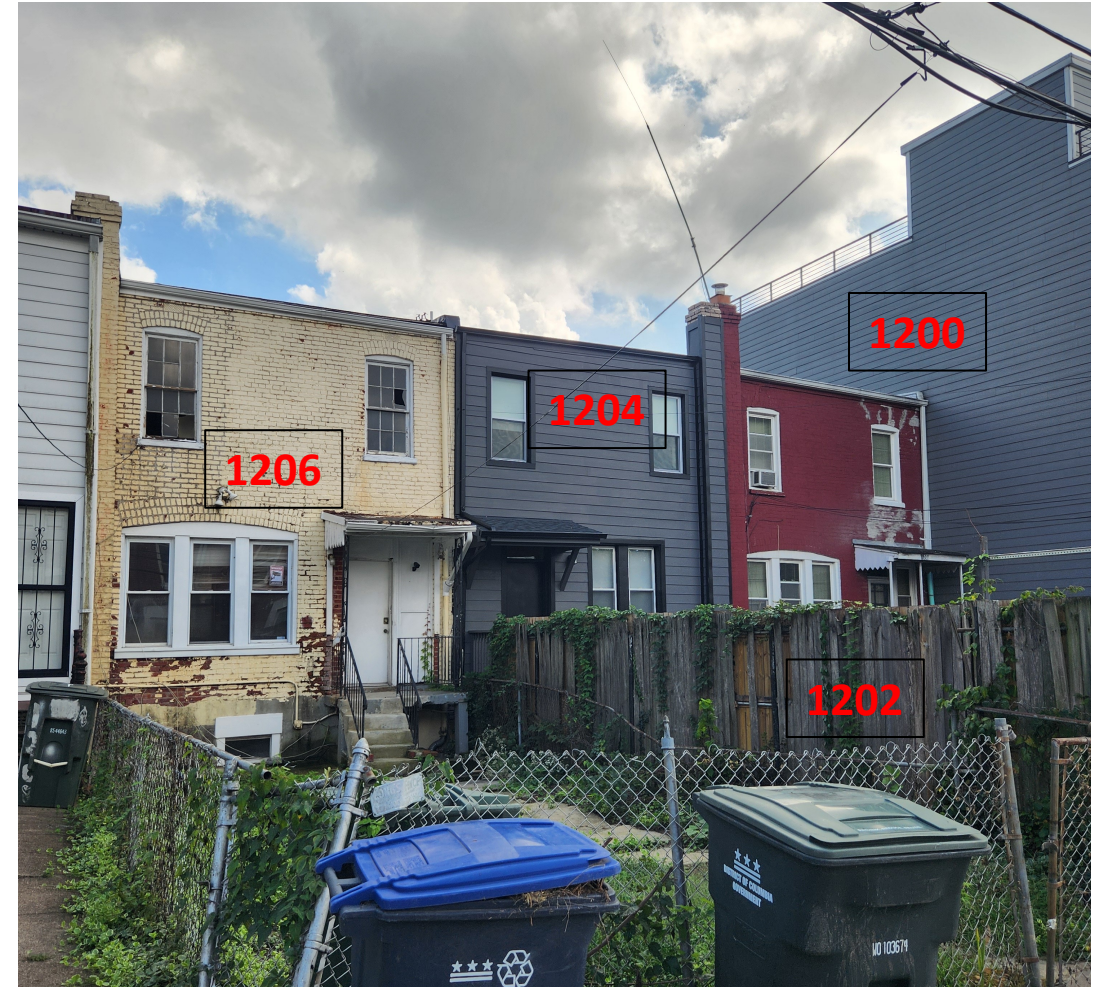
1206 Staples Street NE – Rear profile