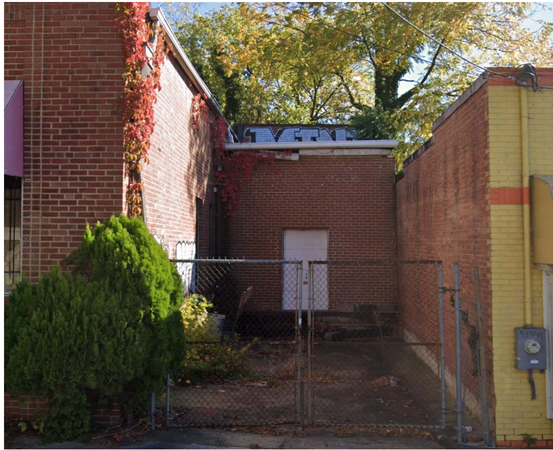
EXISTING PARKING SPACE