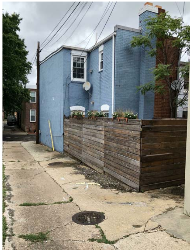
VIEW FROM ALLEY AND REAR YARD SHOWING THE EXISTING DOGLEG