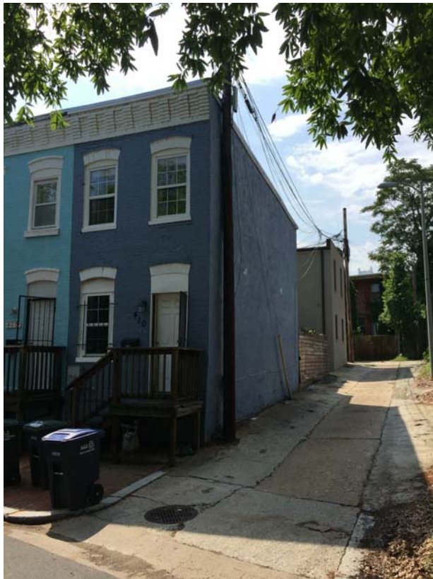
EXISTING ALLEY FACADE