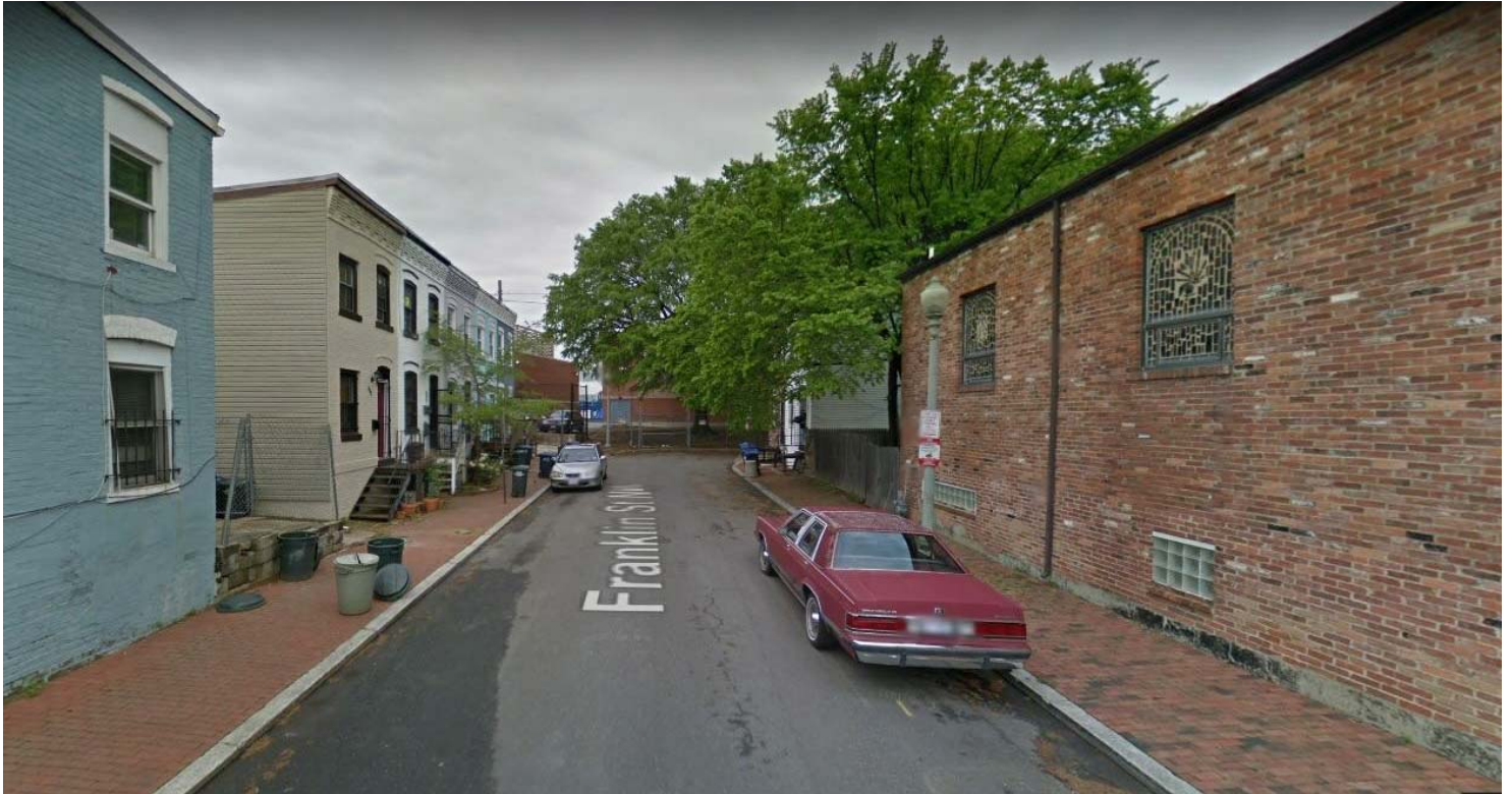
LOOKING SOUTH ON FRANKLIN STREET - FROM NEW JERSEY AVENUE