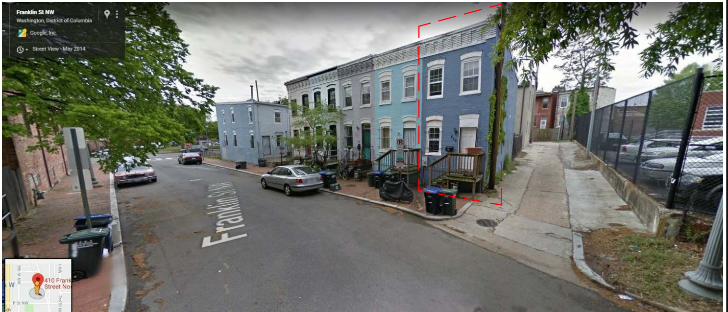
LOOKING NORTH ON FRANKLIN STREET-TOWARDS NEW JERSEY AVE.