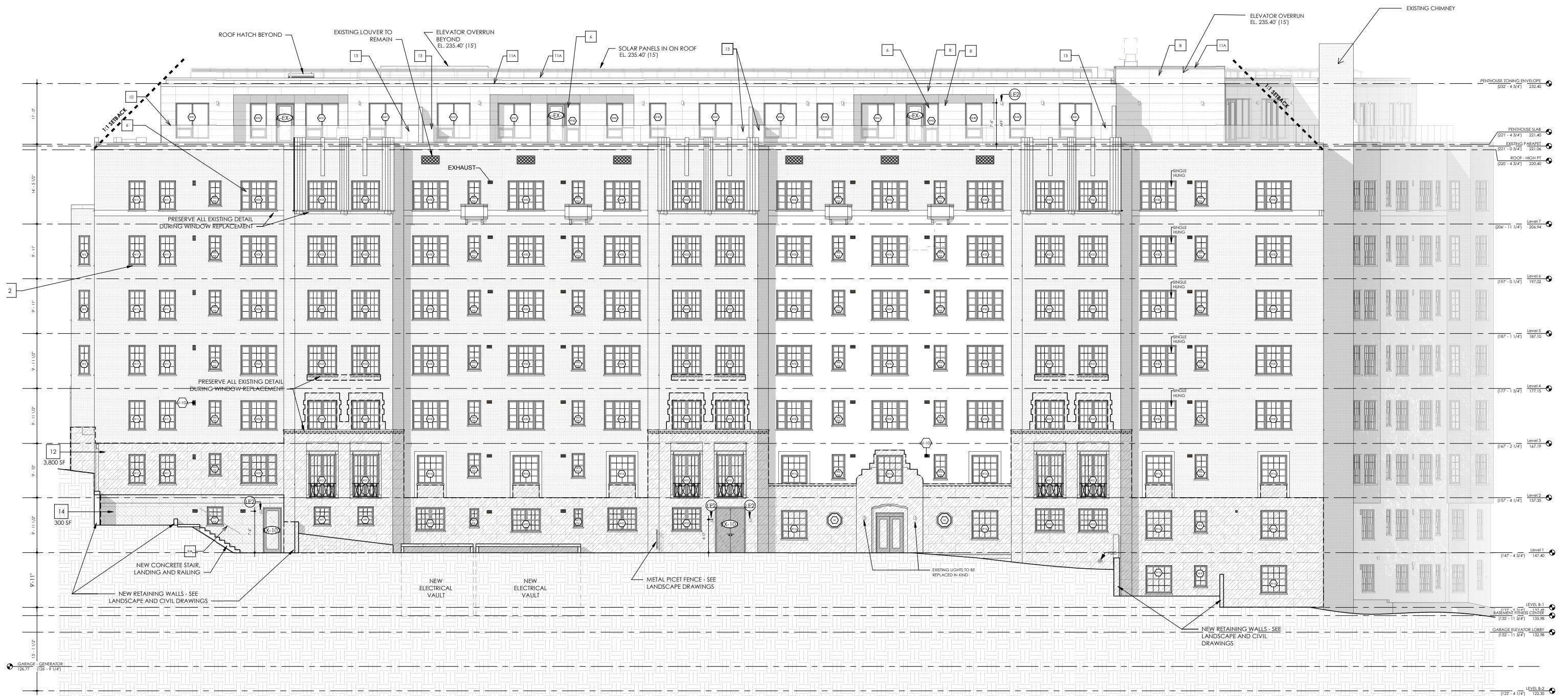
B8 PROPOSED - NORTH ELEVATION - HARVARD STREET 1/8" = 1'-0"