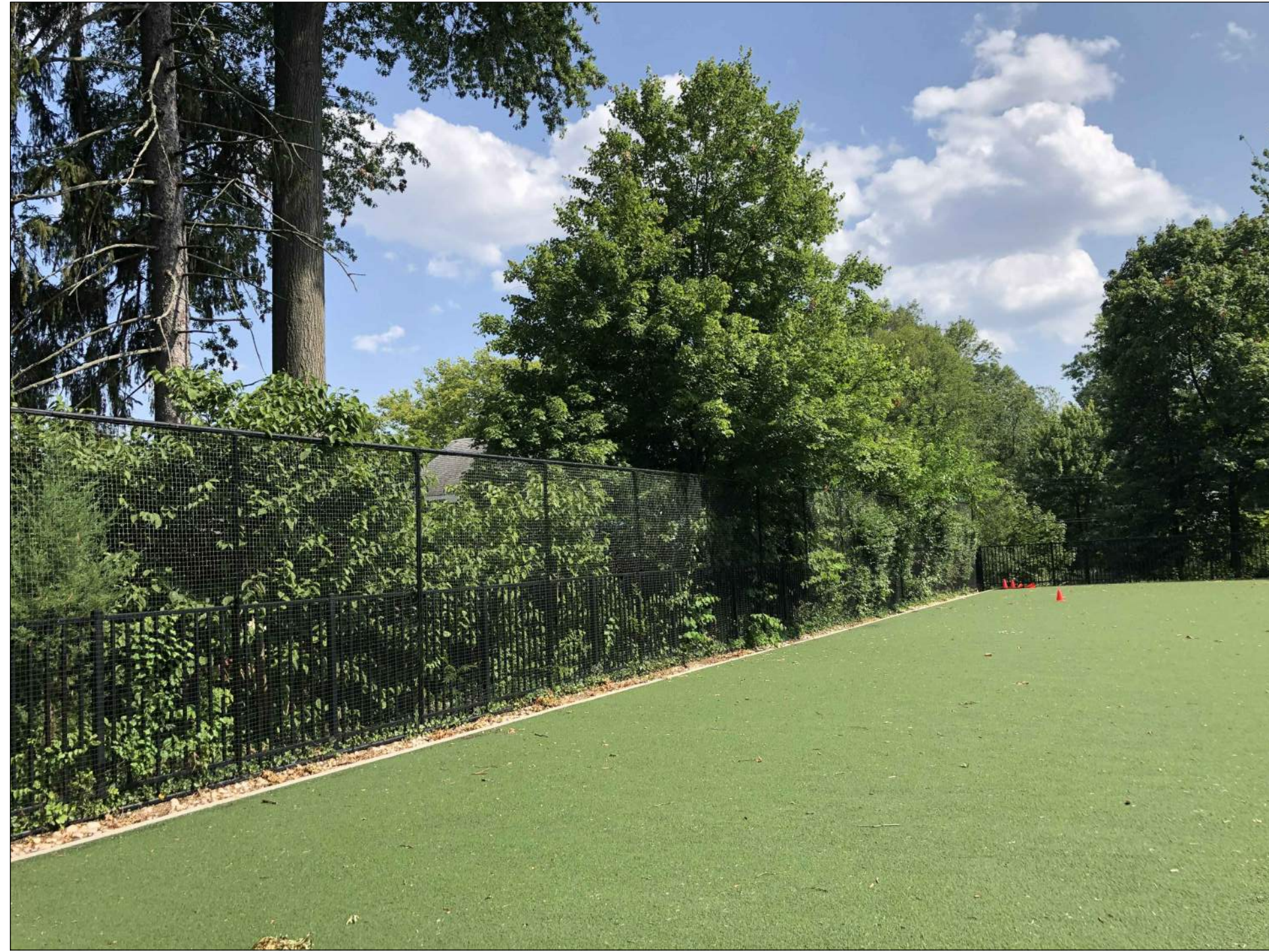
VIEW A-A: EXISTING CONDITION AT EAST SIDE OF FIELD