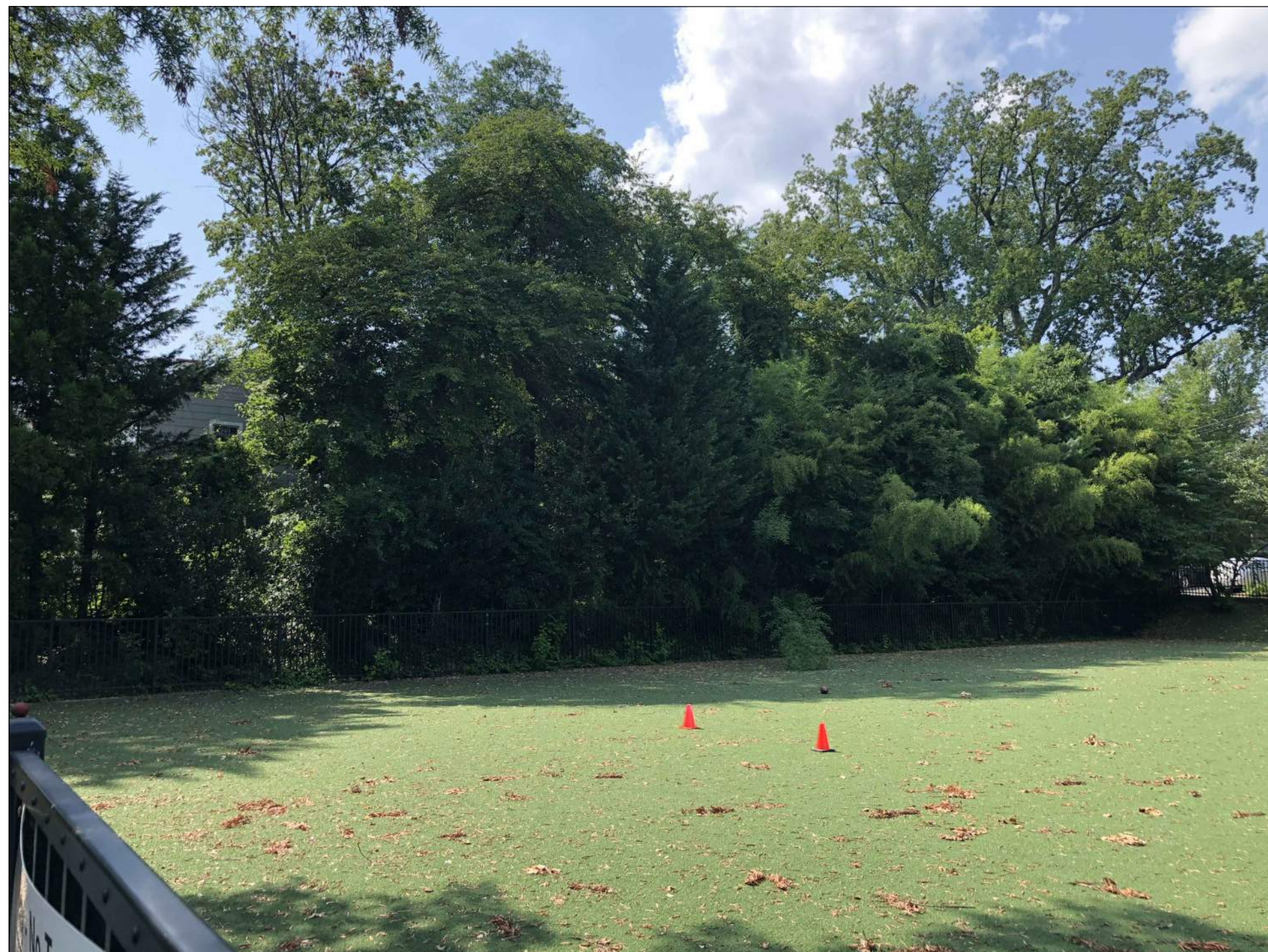
VIEW D-D: EXISTING CONDITION AT WEST SIDE OF FIELD