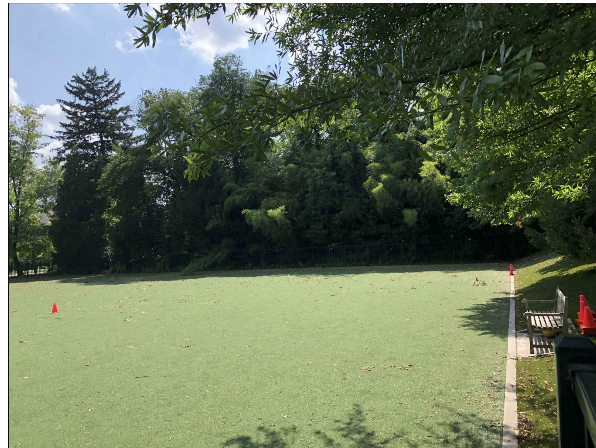
VIEW E-E: EXISTING CONDITION AT WEST SIDE OF FIELD