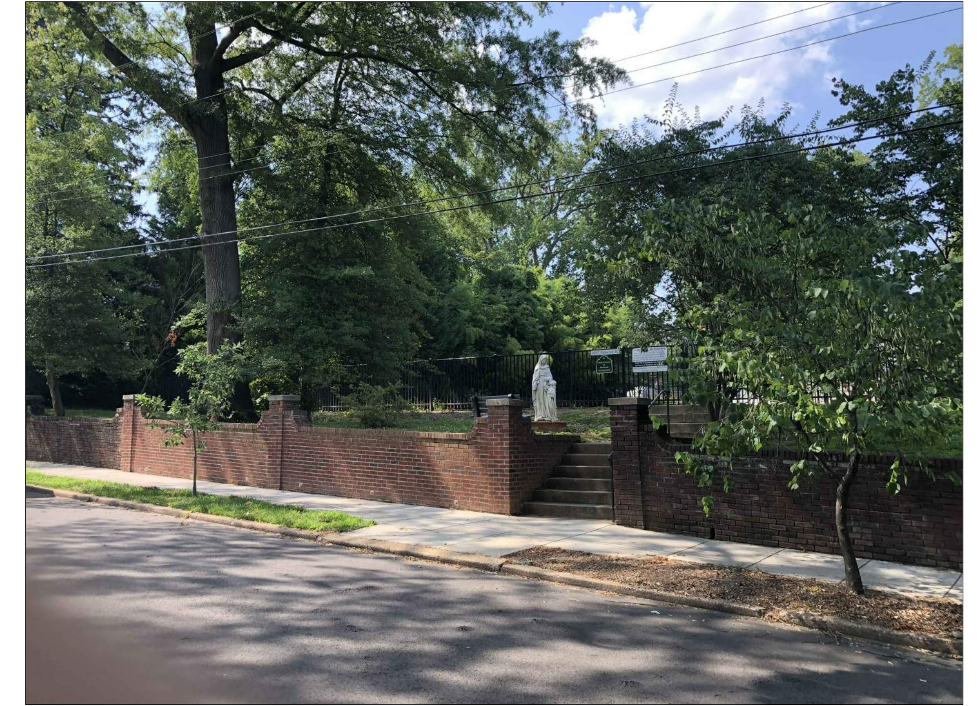
VIEW C-C: EXISTING CONDITION AT CHEVY CHASE PARKWAY