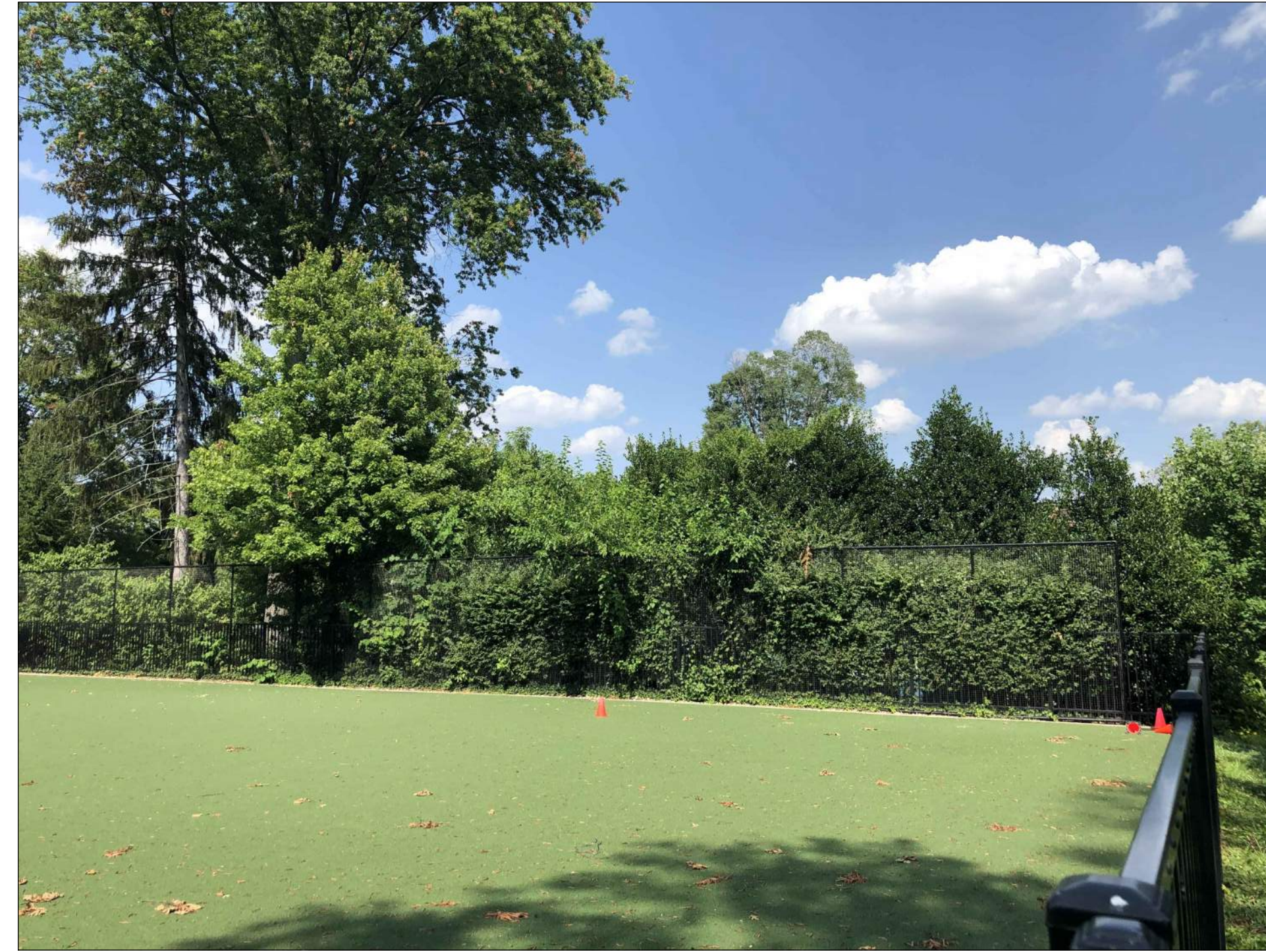
VIEW B-B: EXISTING CONDITION AT EAST SIDE OF FIELD