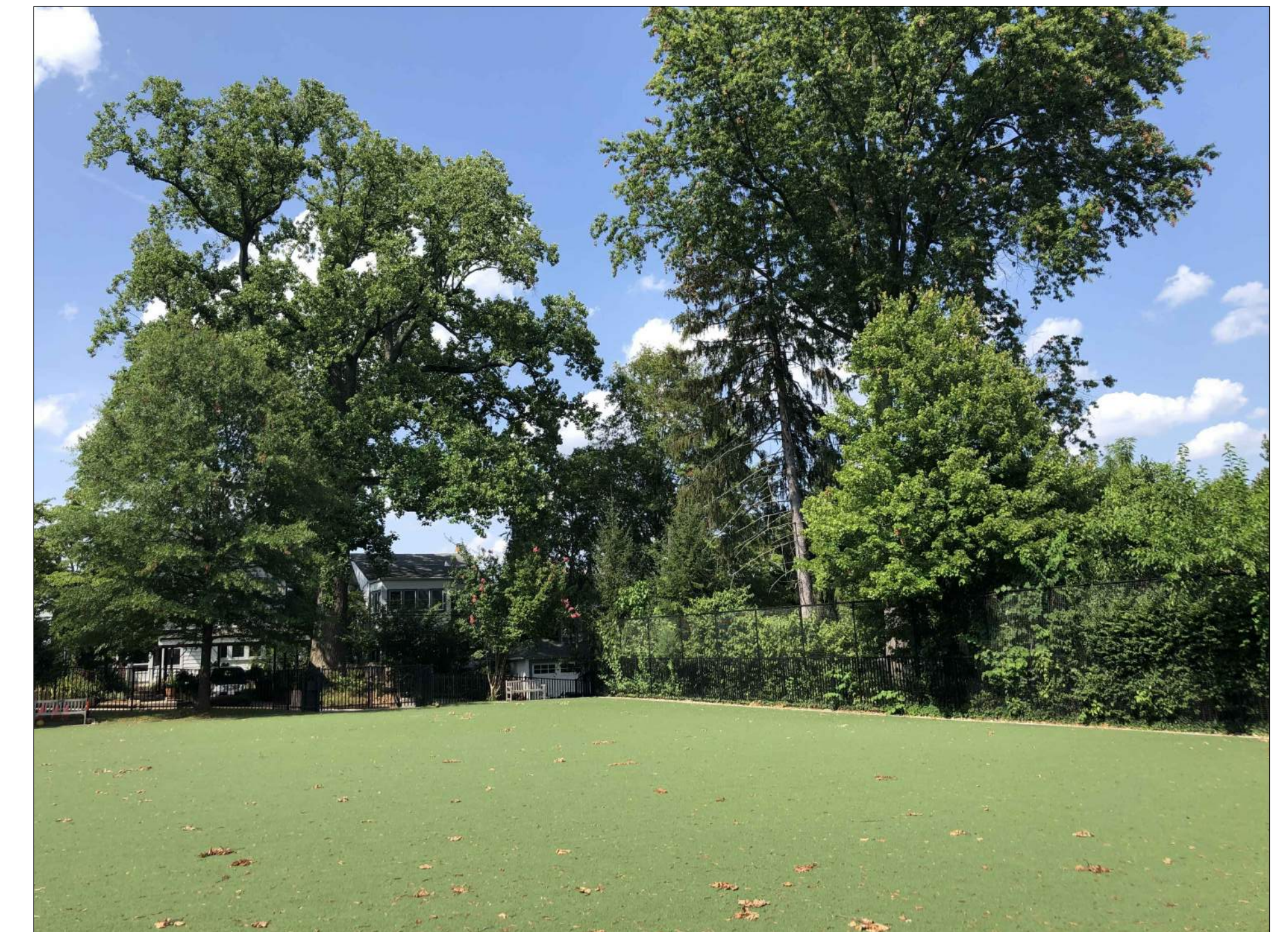
VIEW F-F: EXISTING CONDITION AT NORTH SIDE OF FIELD