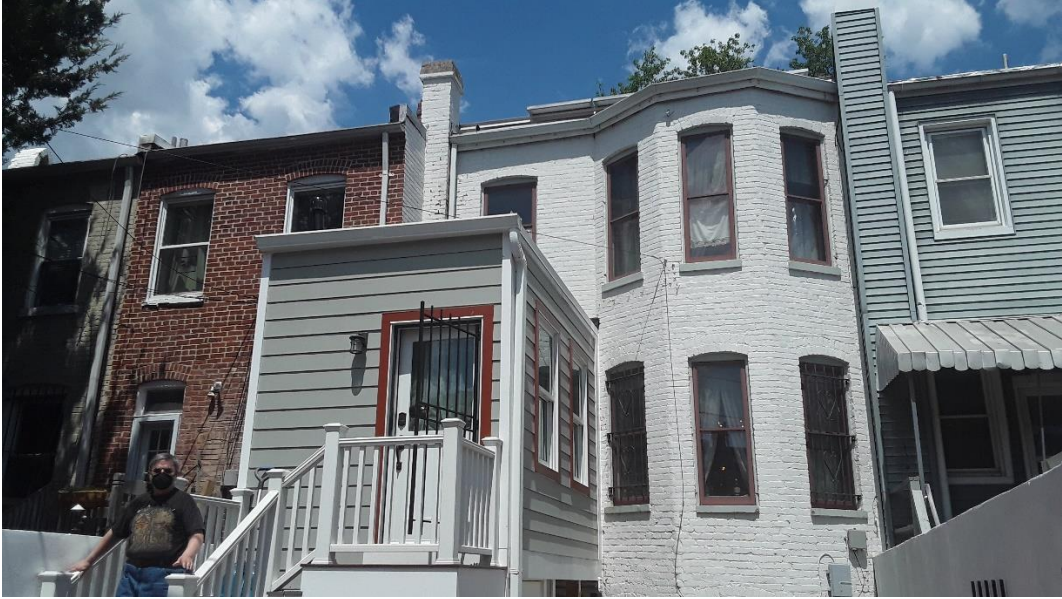
1415 Potomac Avenue SE Rear – Neighbor to the West