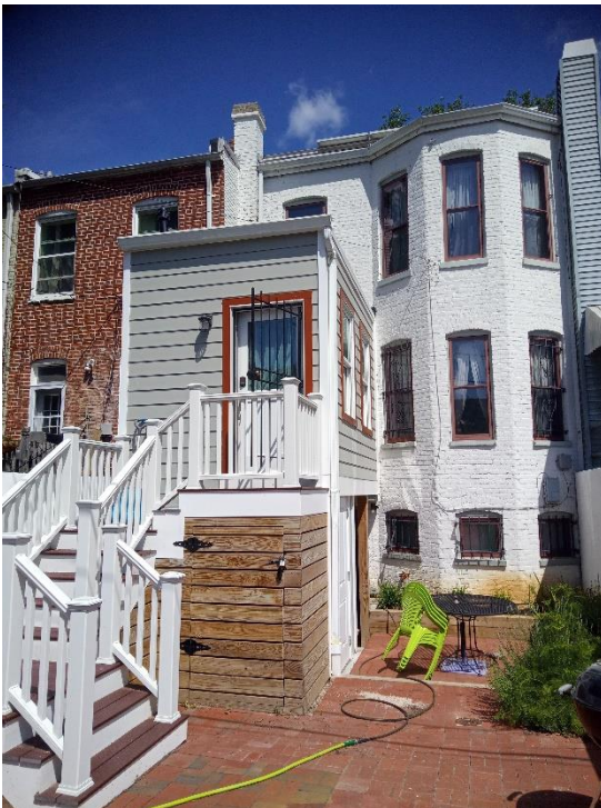
1415 Potomac Avenue SE Rear