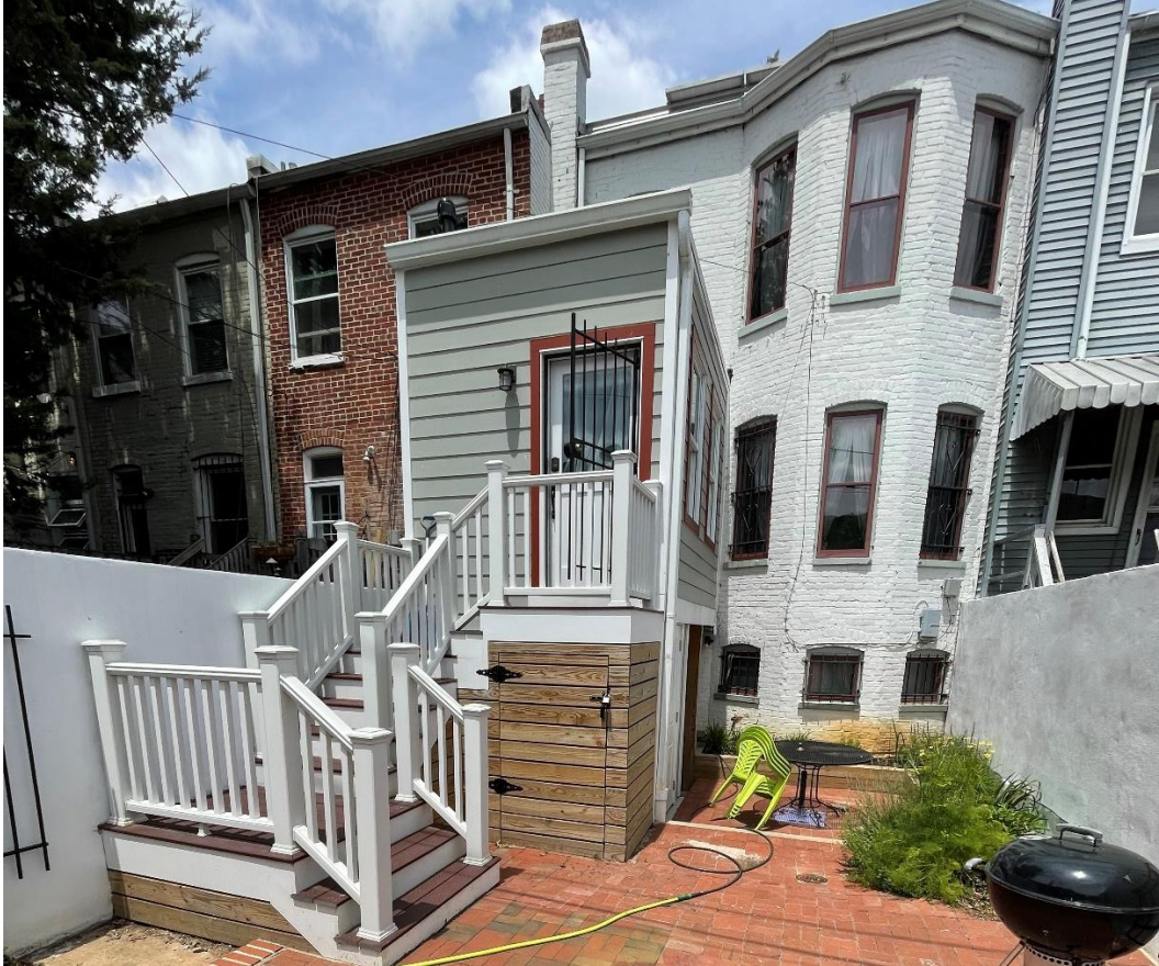
1415 Potomac Avenue SE