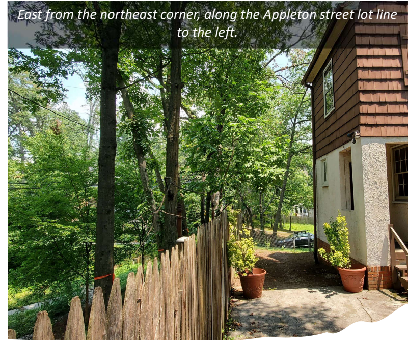
East from the northeast corner, along the Appleton street lot line to the left.