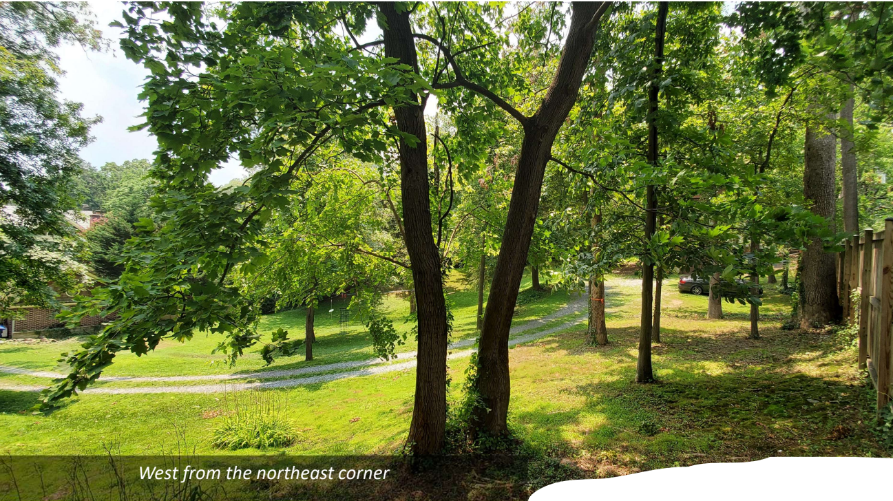
West from the northeast corner