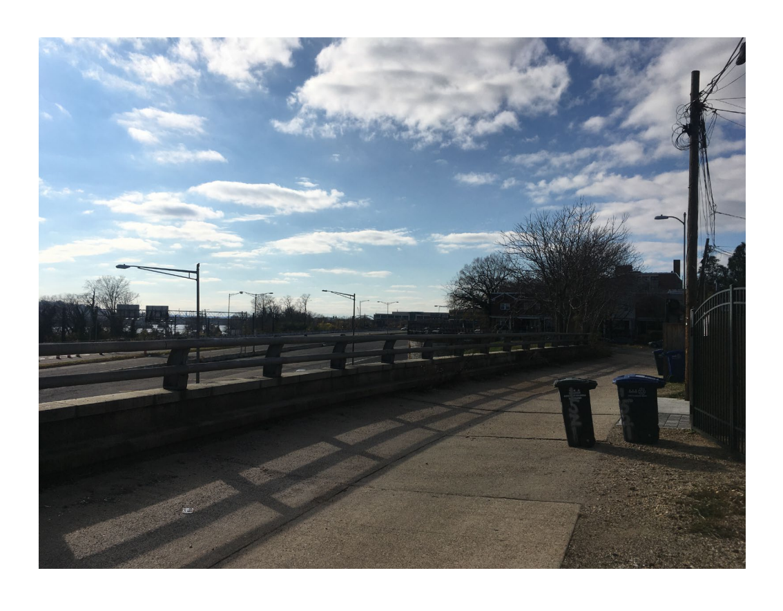
VIEW FROM ALLEY LOOKING SOUTH-EAST