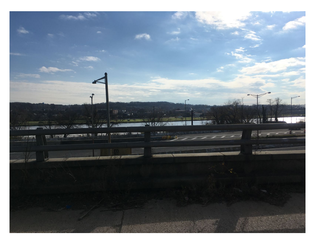
VIEW FROM ALLEY LOOKING SOUTH