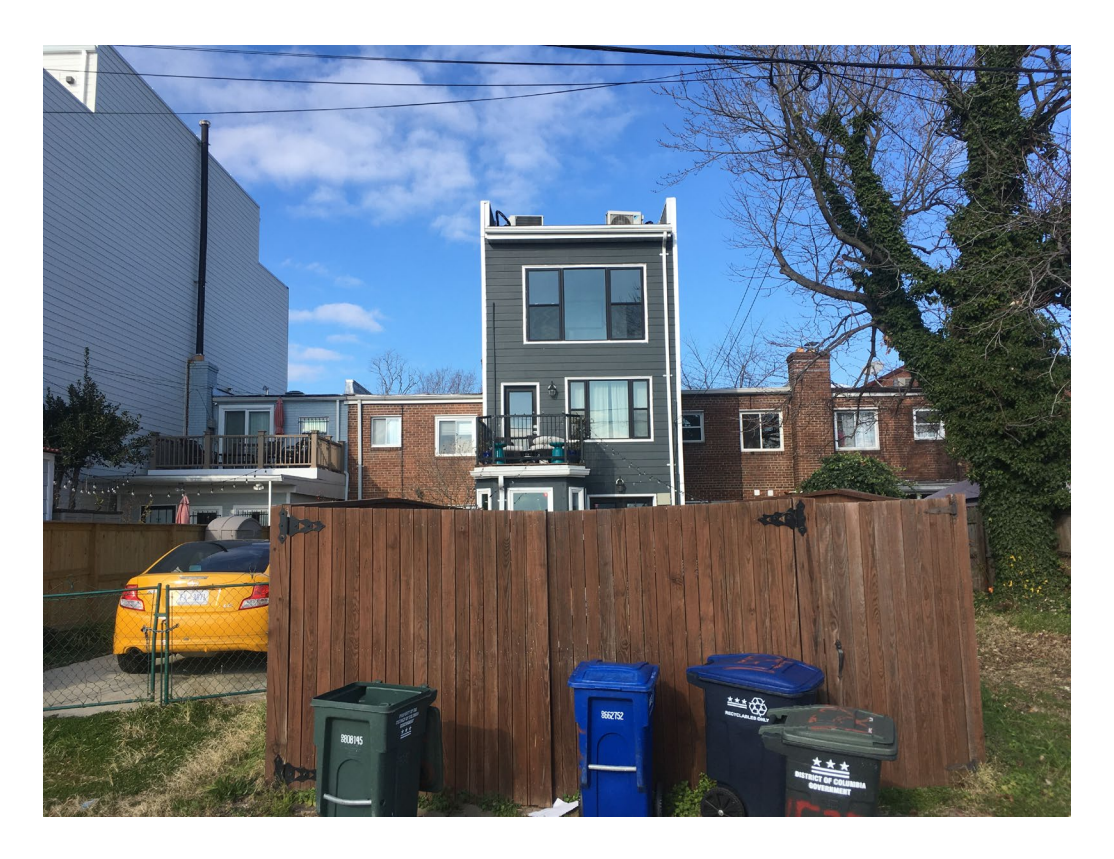
VIEW FROM ALLEY LOOKING NORTH