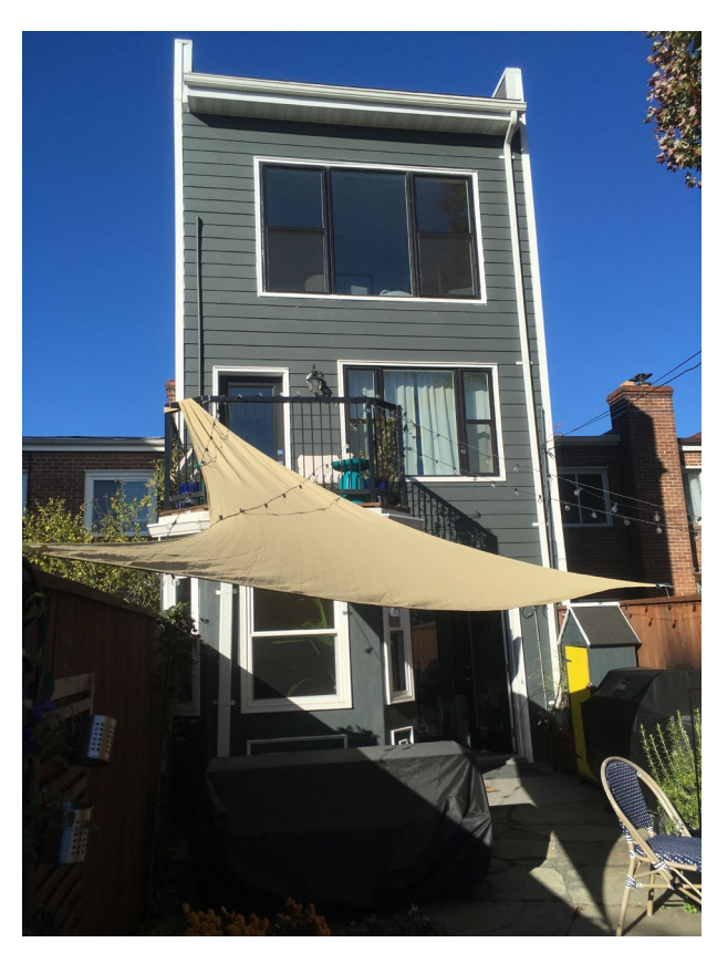
EXISTING REAR FACADE