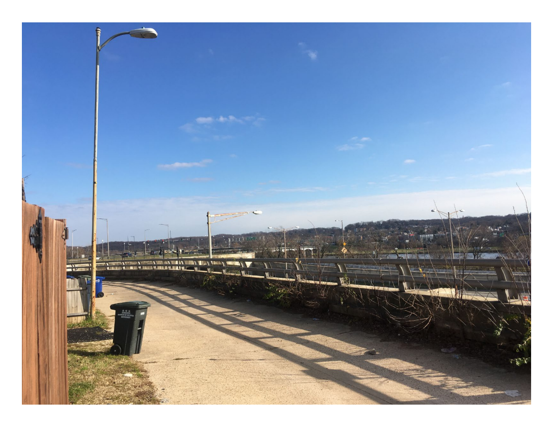
VIEW FROM ALLEY LOOKING SOUTH-WEST