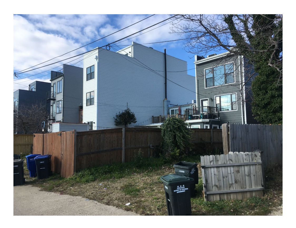
VIEW FROM ALLEY LOOKING NORTH-WEST