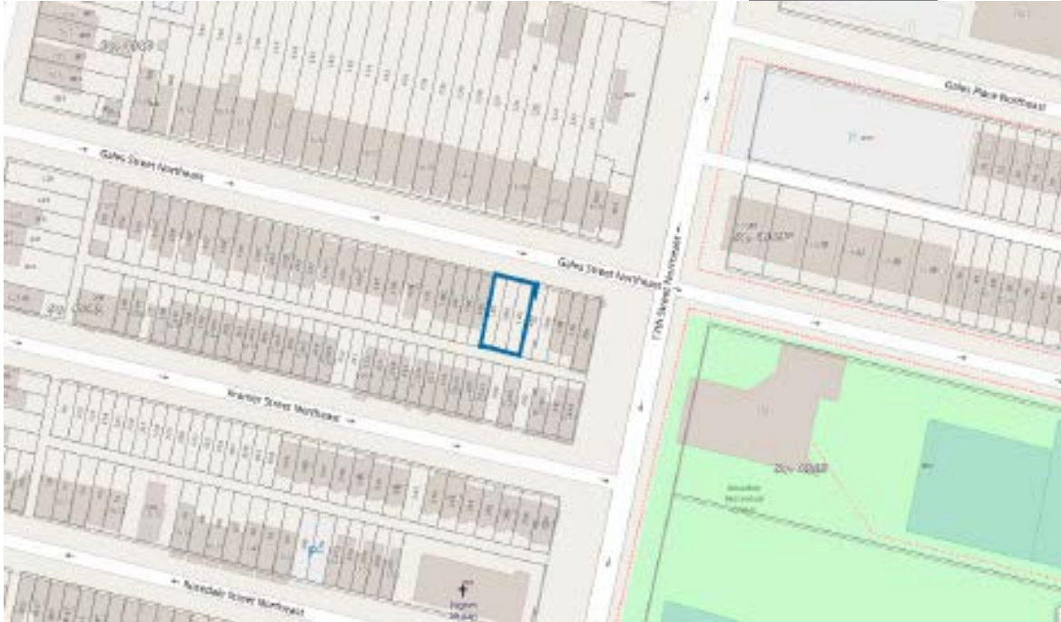
Map of Gales Street (1657-1661 Gales Street NE, Washington, DC)