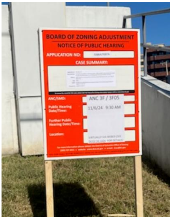
3. 10/21/2024 – Yuma Street NW #1