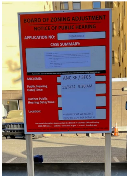
4. 10/21/2024 – Yuma Street NW #2