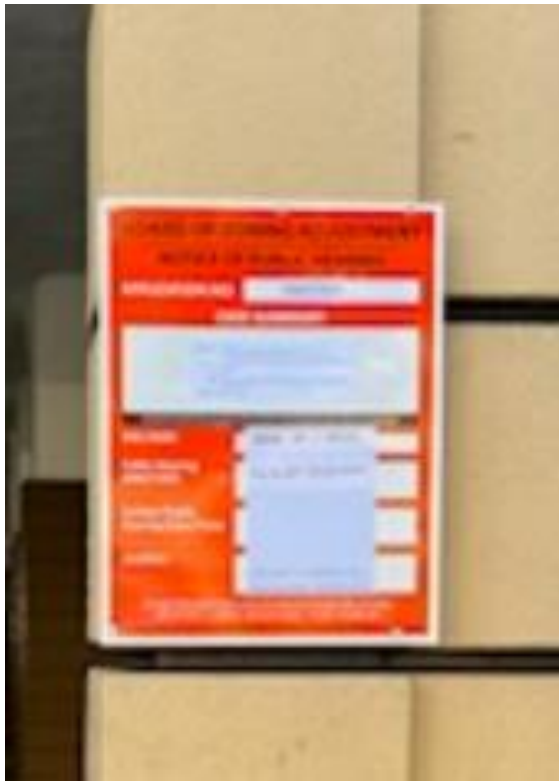
1. 10/21/2024 – Connecticut Avenue NW #1