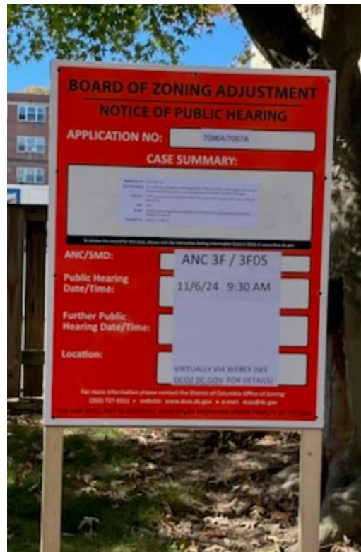
2. 10/21/2024 – Connecticut Avenue NW #2