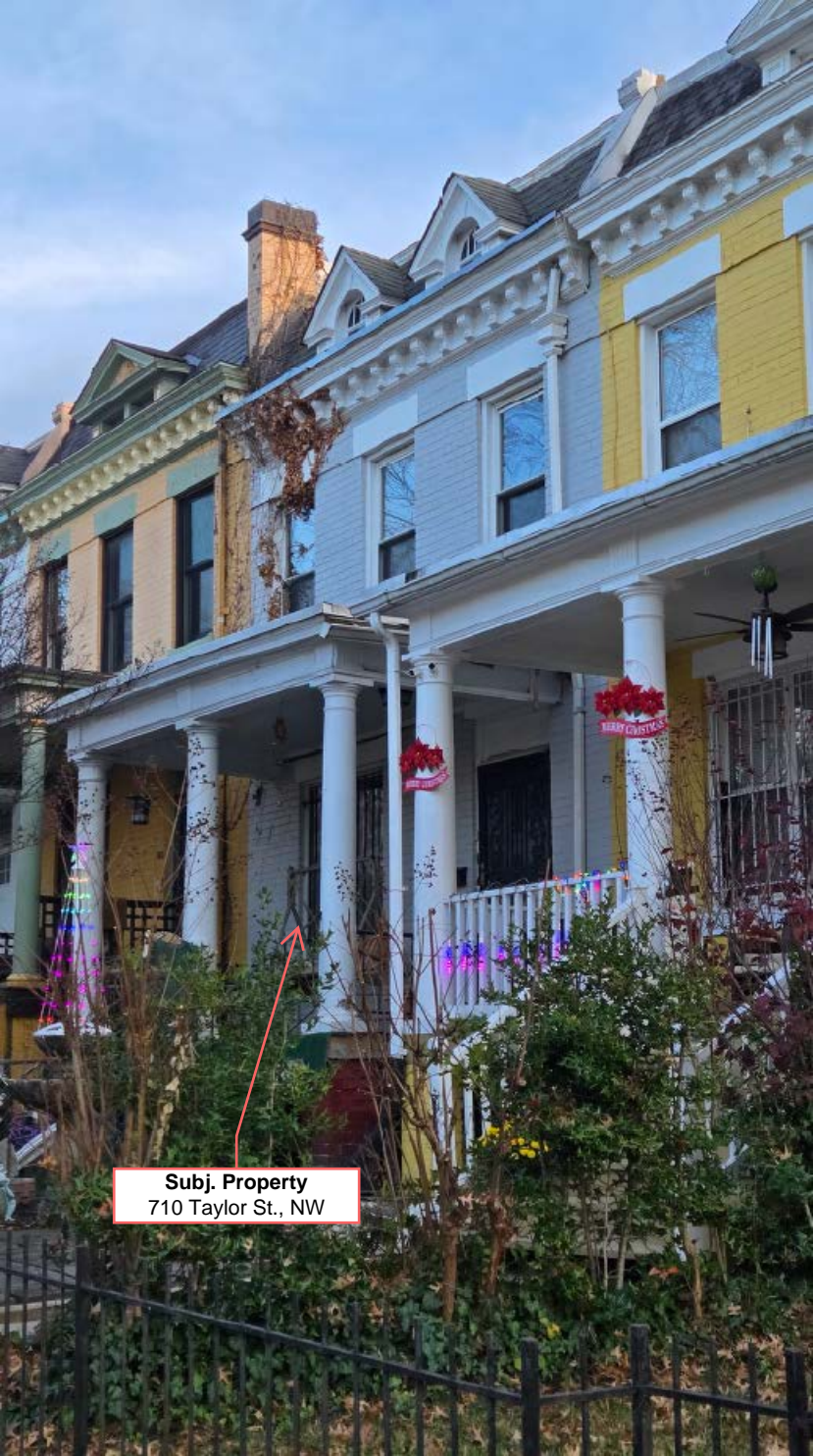
Subj. Property 710 Taylor St., NW