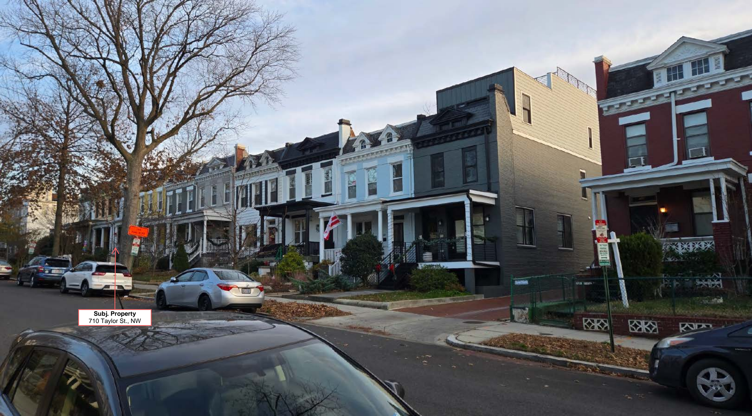
Subj. Property 710 Taylor St., NW