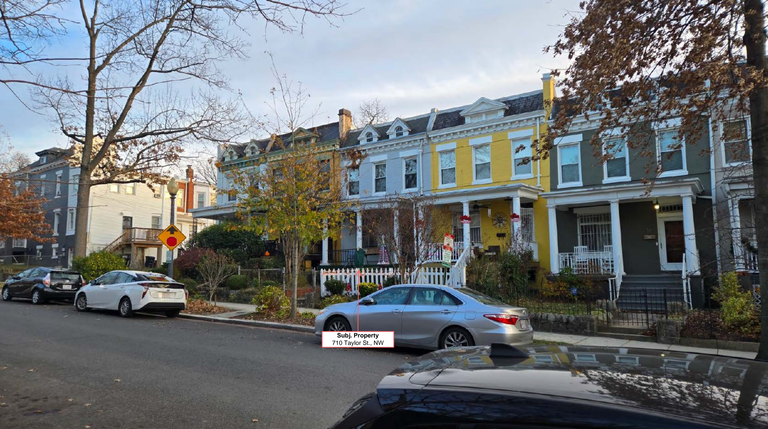
Subj. Property 710 Taylor St., NW