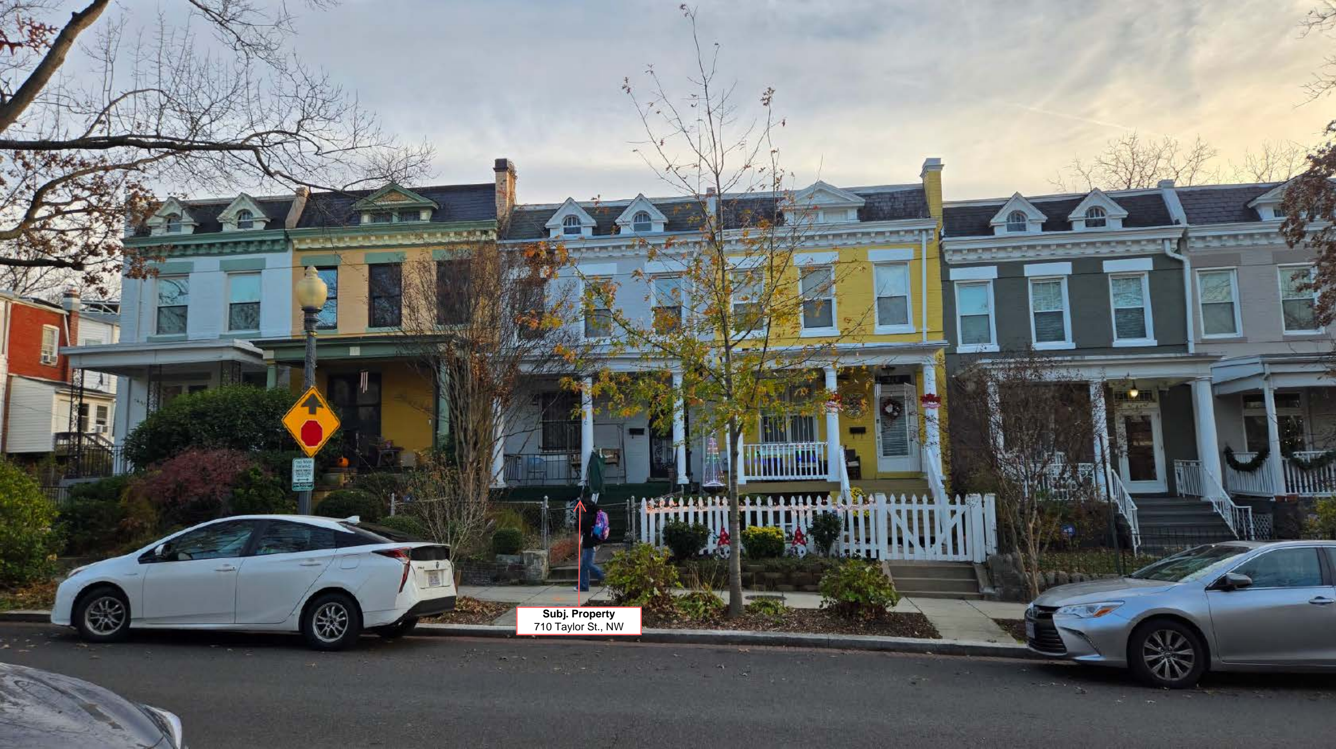
Subj. Property 710 Taylor St., NW