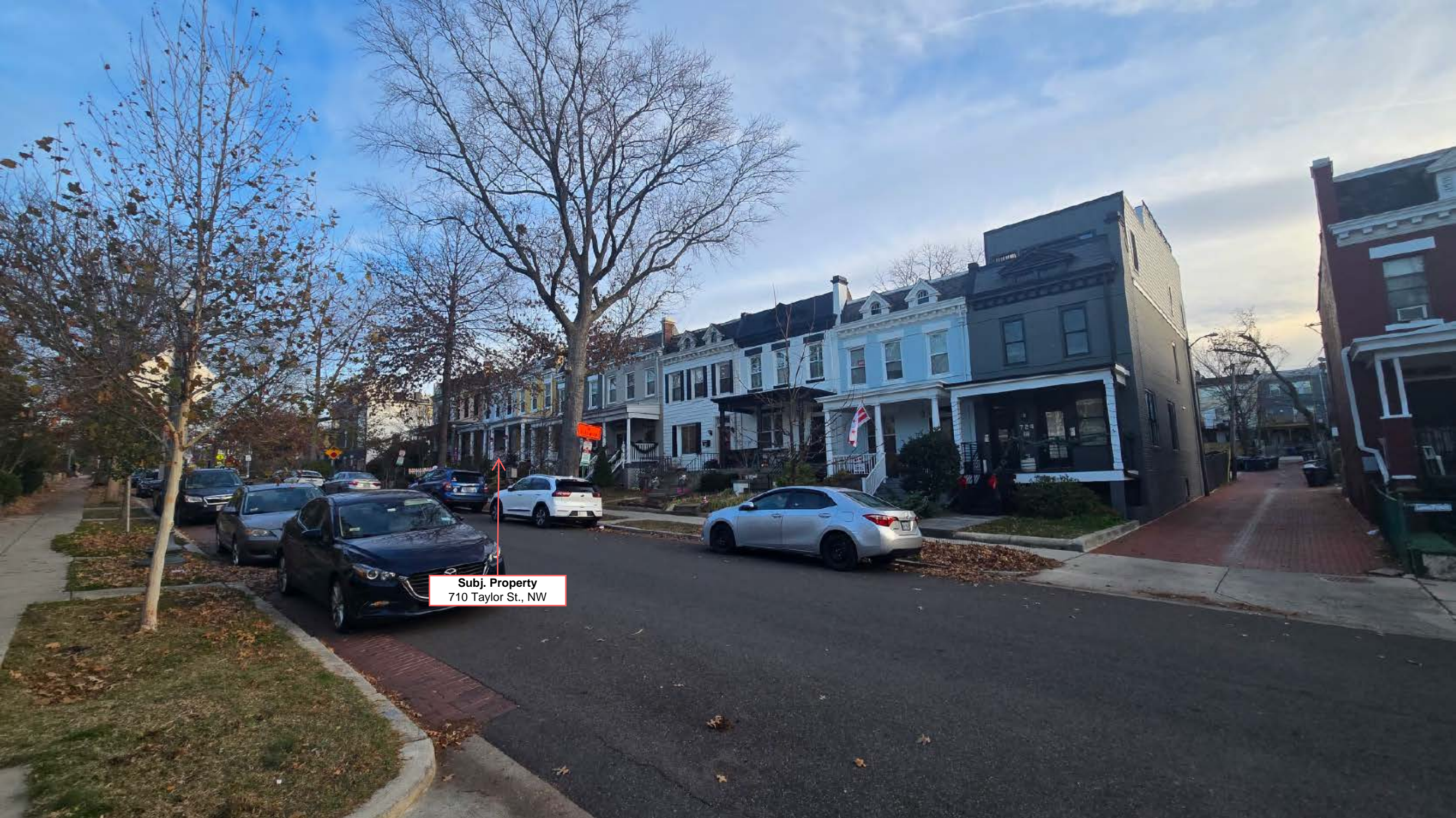
Subj. Property 710 Taylor St., NW