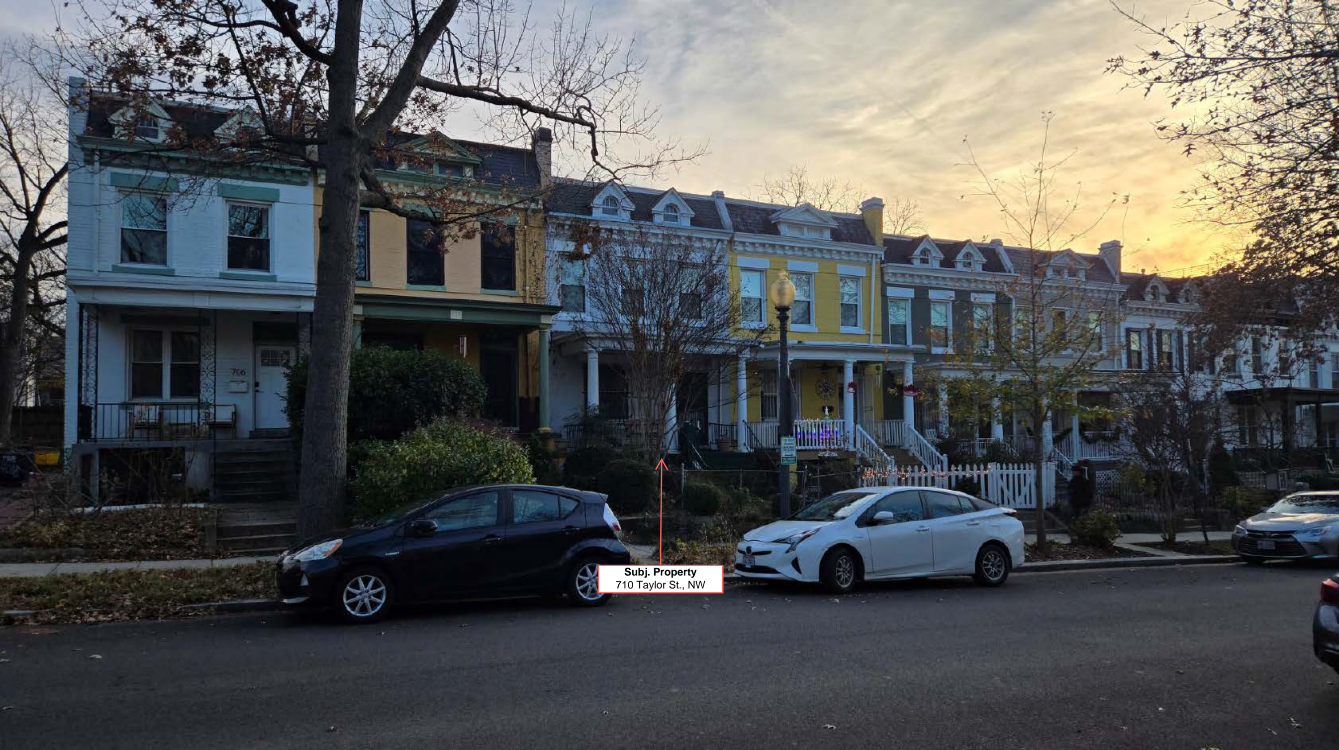
Subj. Property 710 Taylor St., NW