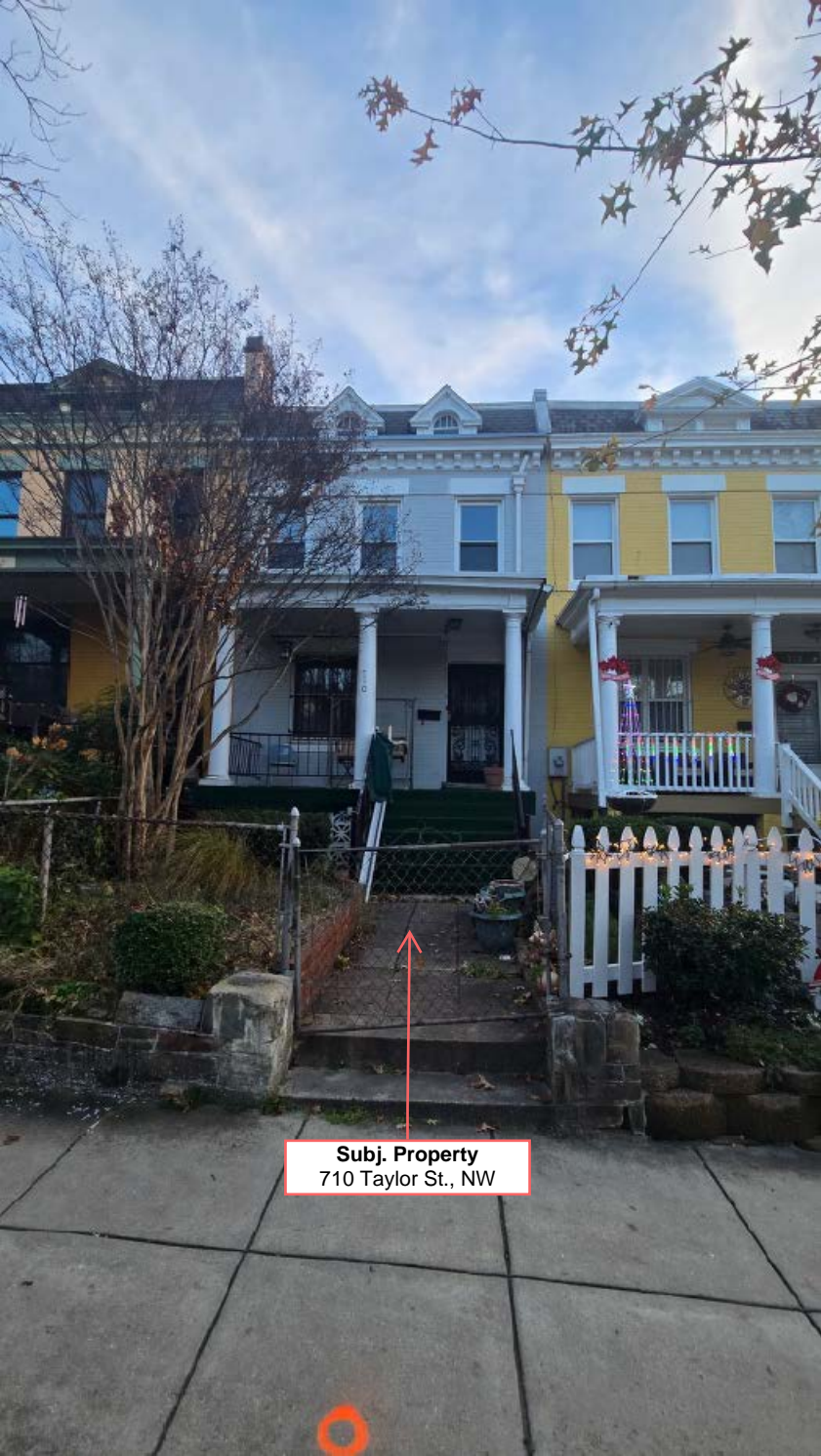
Subj. Property 710 Taylor St., NW