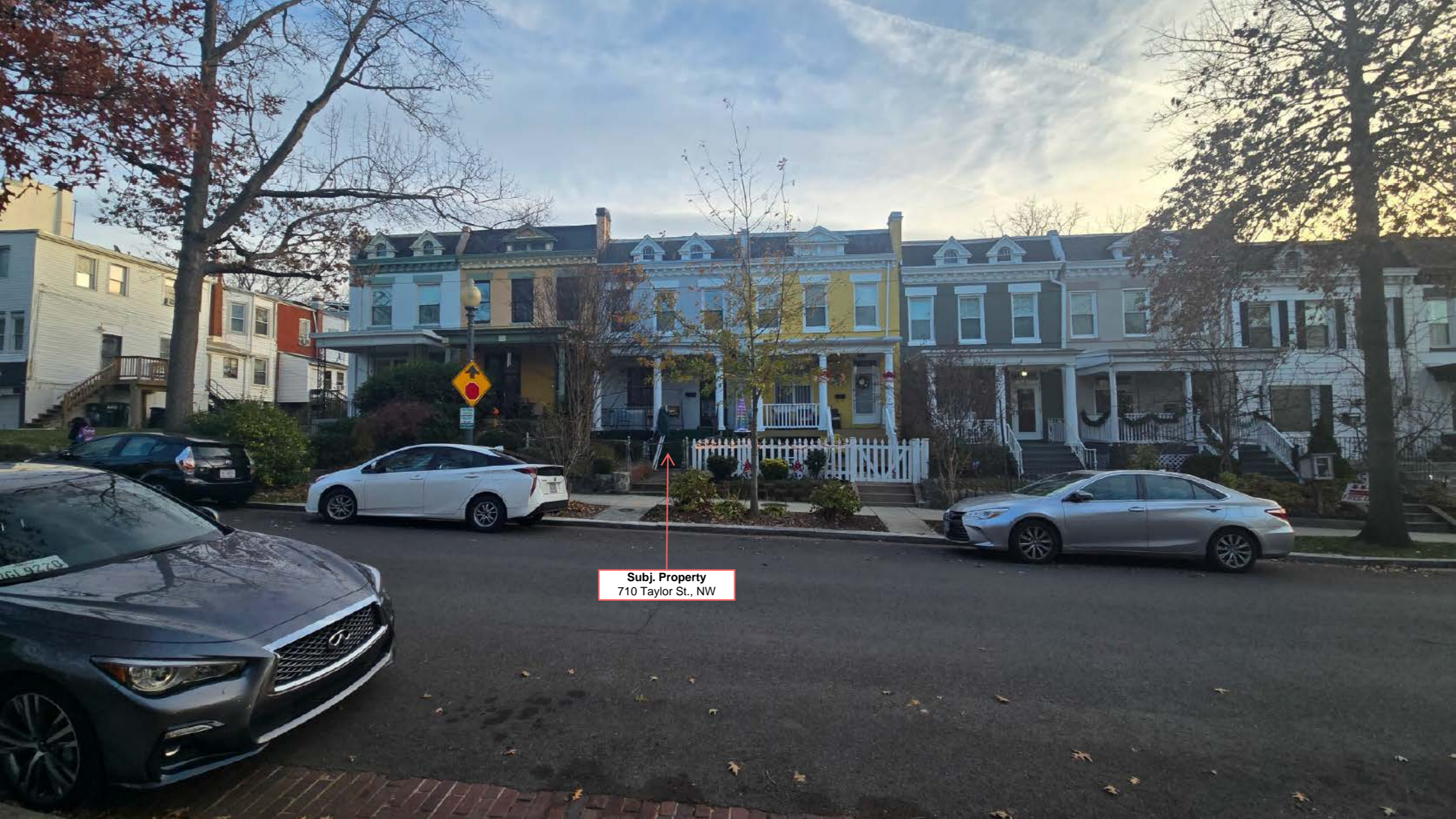
Subj. Property 710 Taylor St., NW