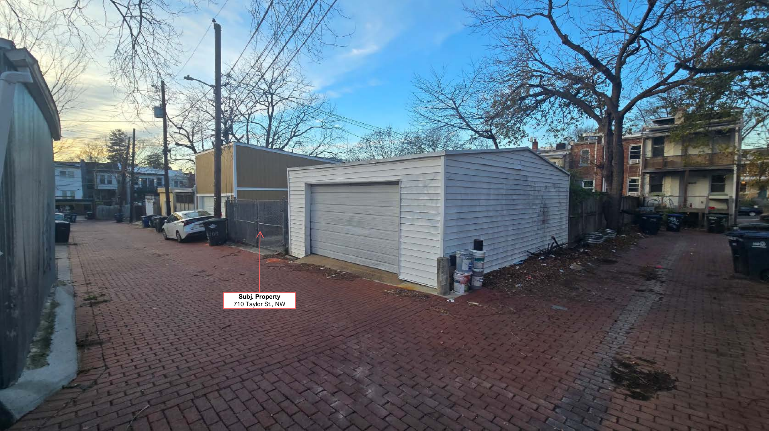
Subj. Property 710 Taylor St., NW