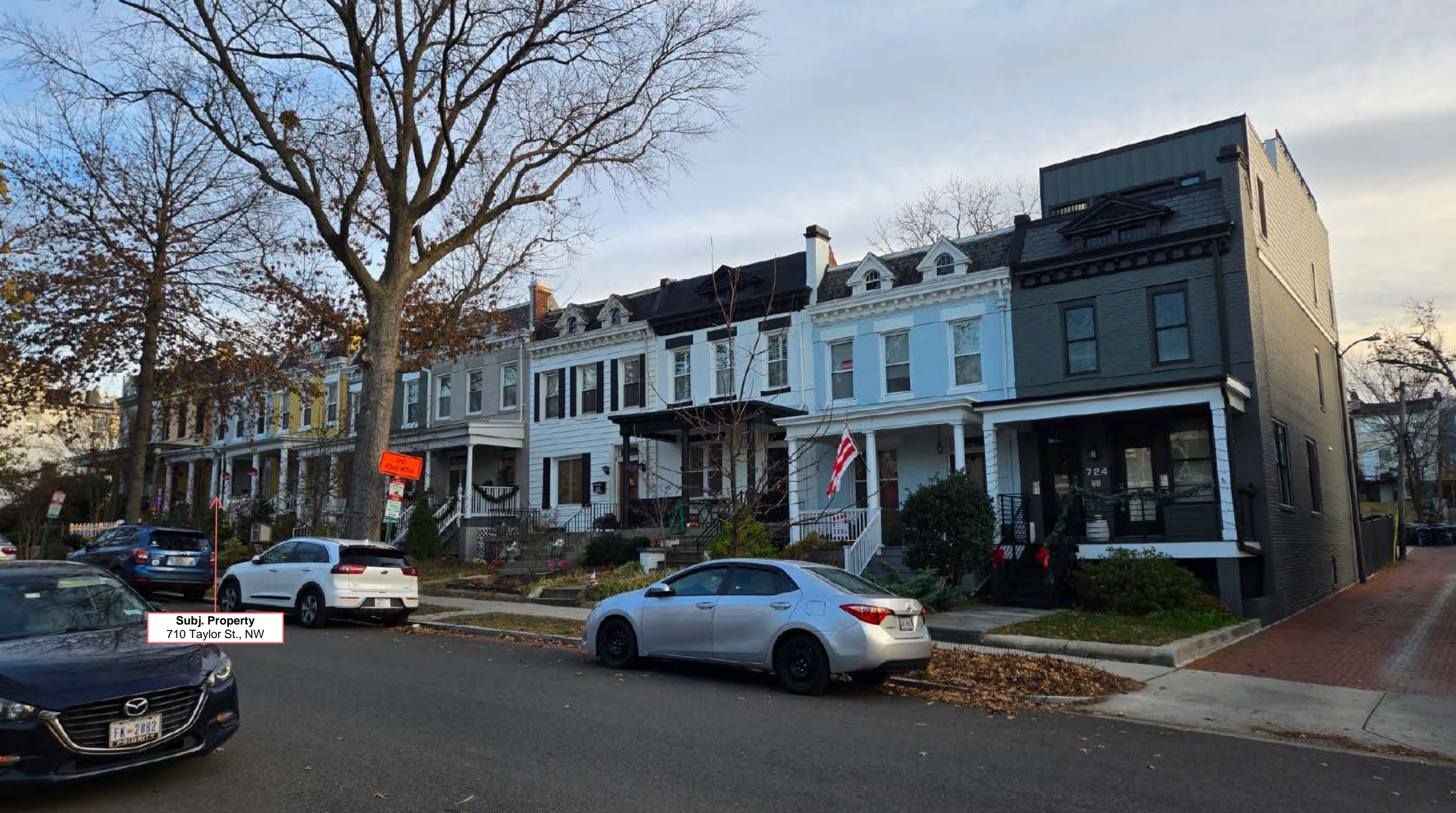
Subj. Property 710 Taylor St., NW