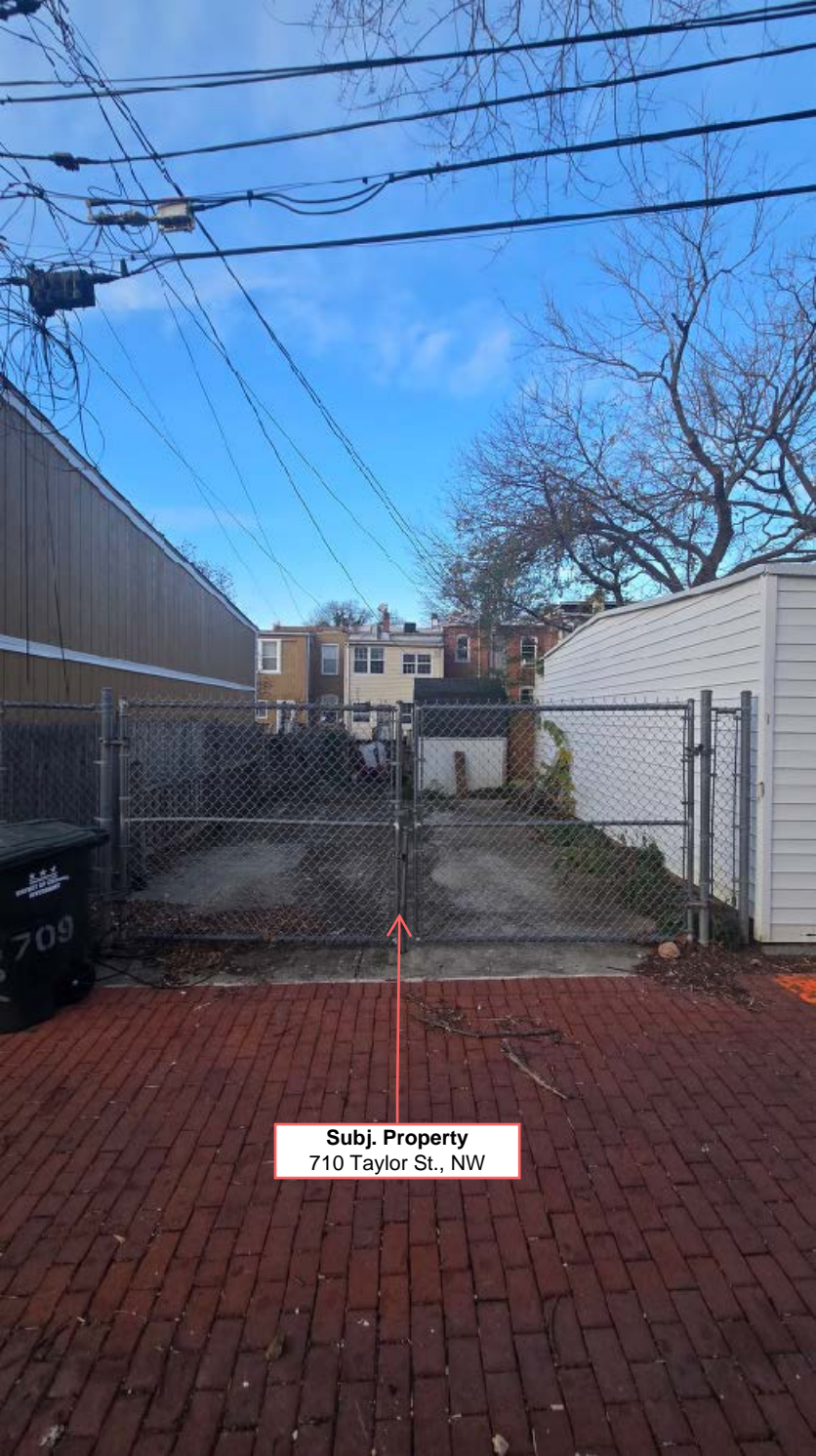
Subj. Property 710 Taylor St., NW