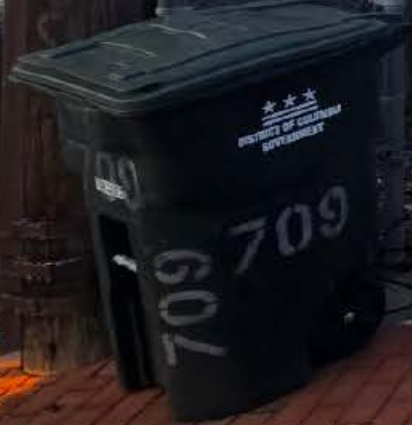
Subj. Property 710 Taylor St., NW