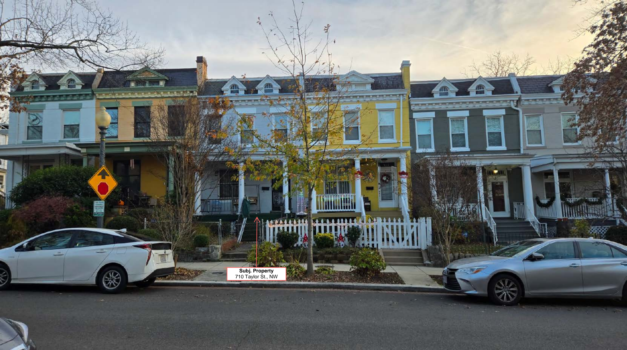
Subj. Property 710 Taylor St., NW