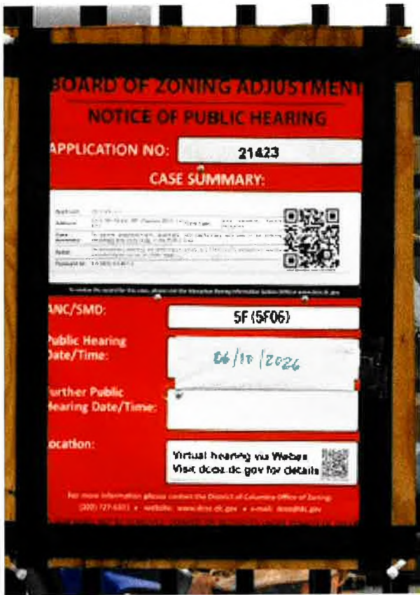
1. 5/22/26 – 5 th St NE