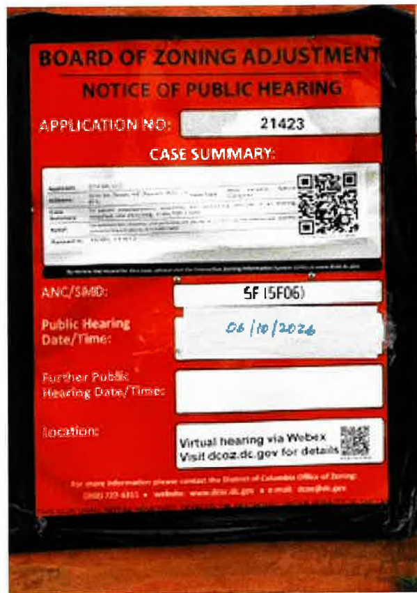
2. 5/22/26 – W St NE #1