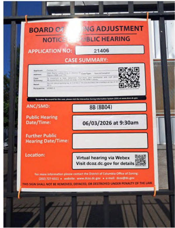
2. 5/18/26 – Sheridan Rd SE