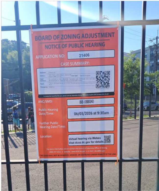
1. 5/18/26 – MLK Jr Ave SE