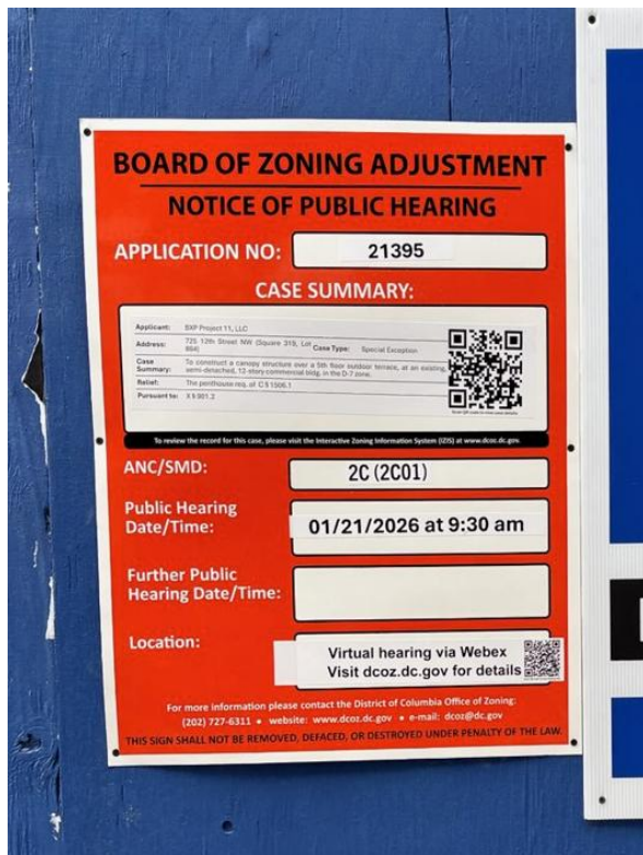
1. 1/5/26 – 12 th Street NW