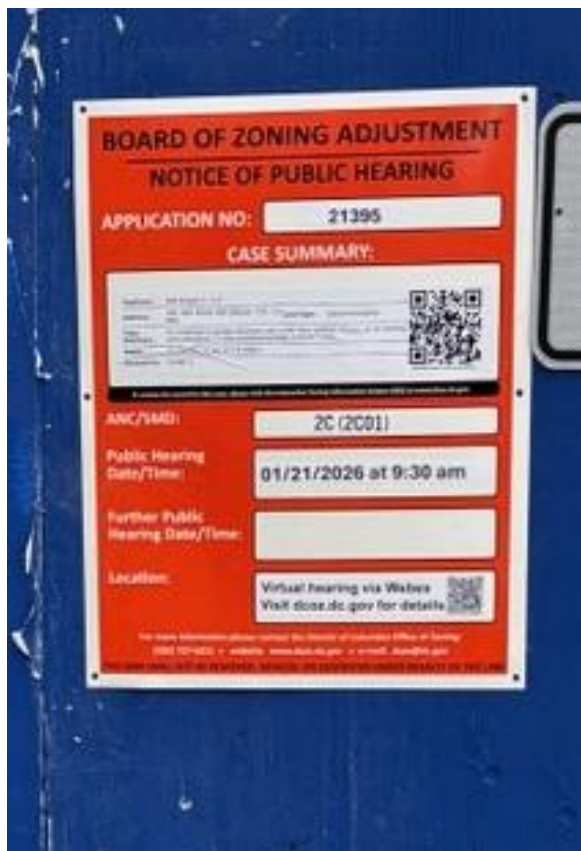
3. 1/5/26 – 11 th Street NW