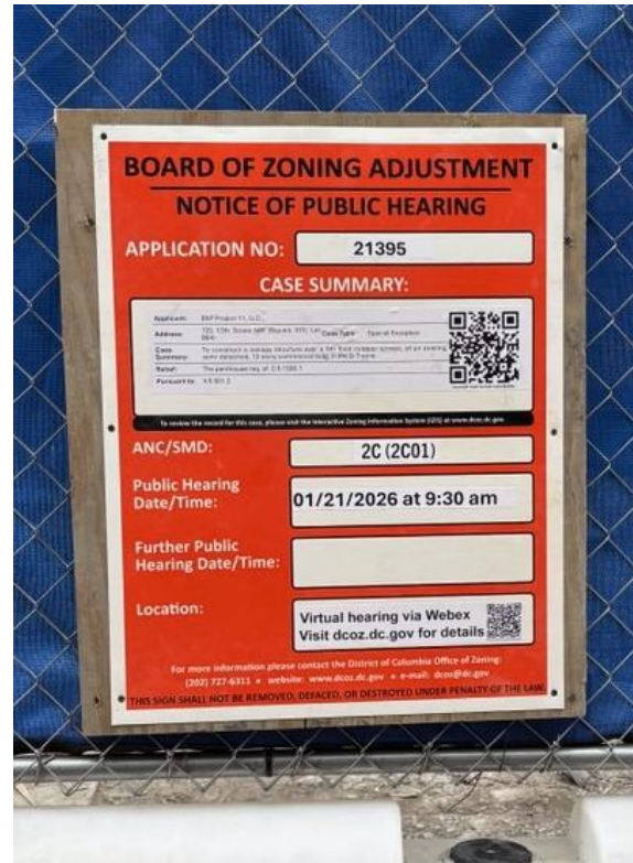
2. 1/5/26 – G Street NW