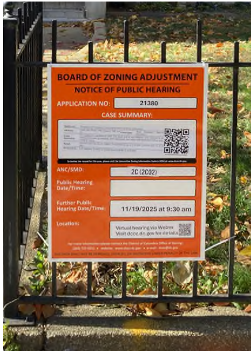
11/10/2025 – 16 th St NW