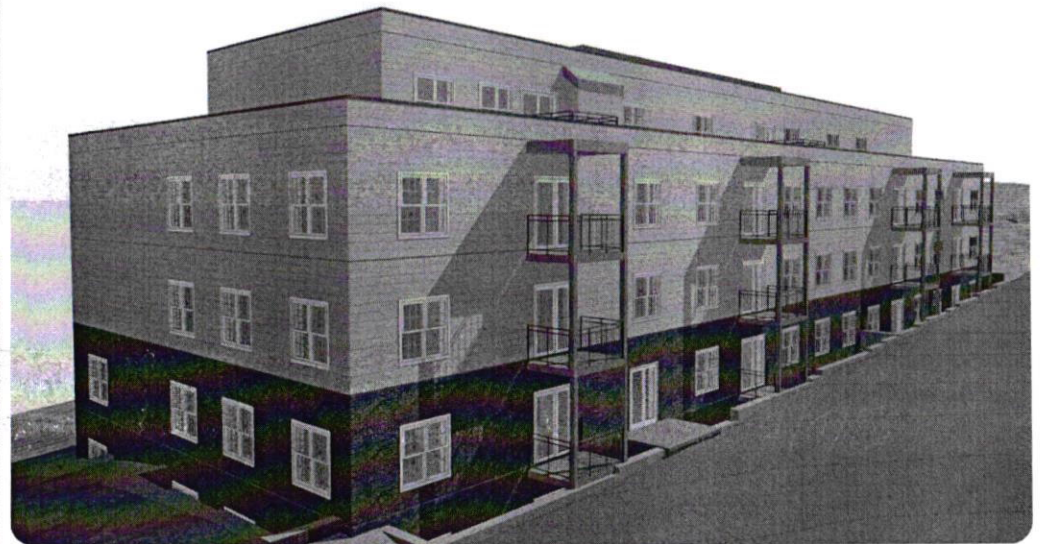
SD13 | HAMPTON EAST 2, WASHINGTON, DC SCHEMATIC PERSPECTIVES