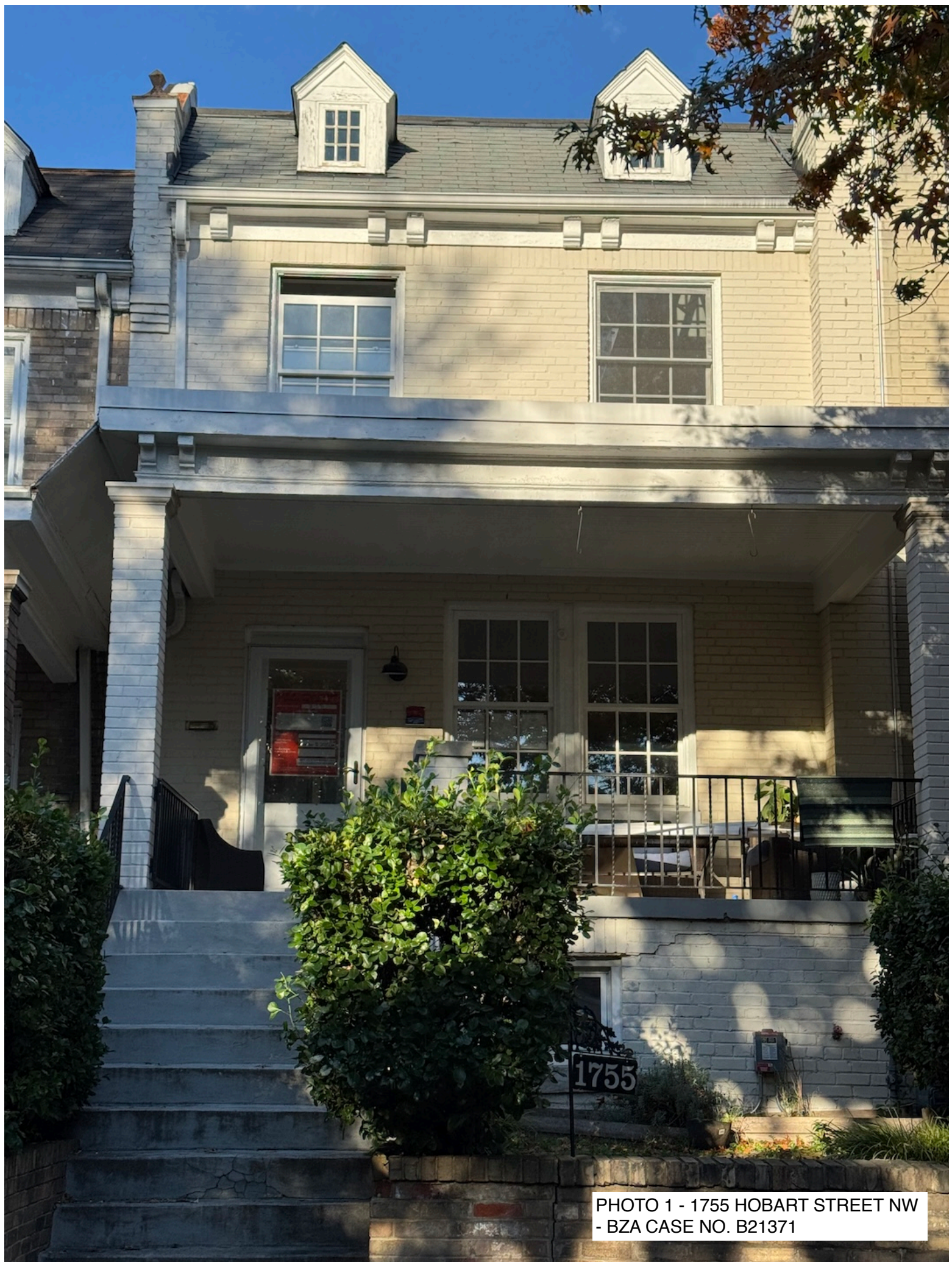
PHOTO 1 - 1755 HOBART STREET NW - BZA CASE NO. B21371