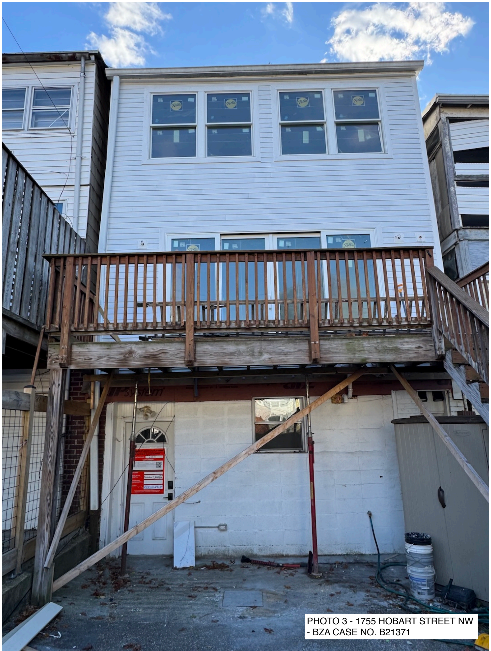
PHOTO 3 - 1755 HOBART STREET NW - BZA CASE NO. B21371