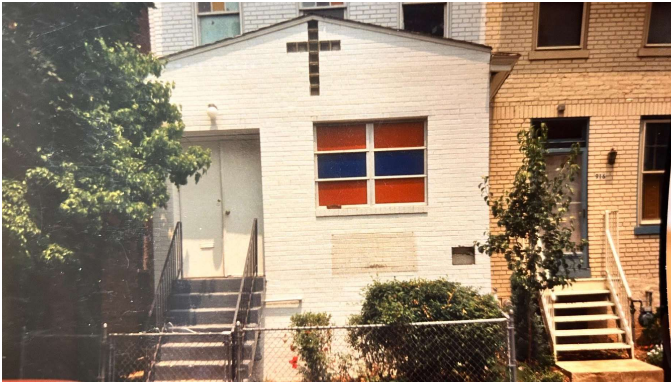
916 D St NE - front porch restoration (CHRS handout)