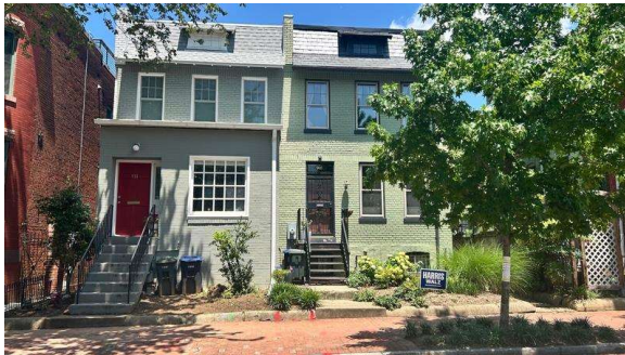
916 D St NE - front porch restoration (CHRS handout)