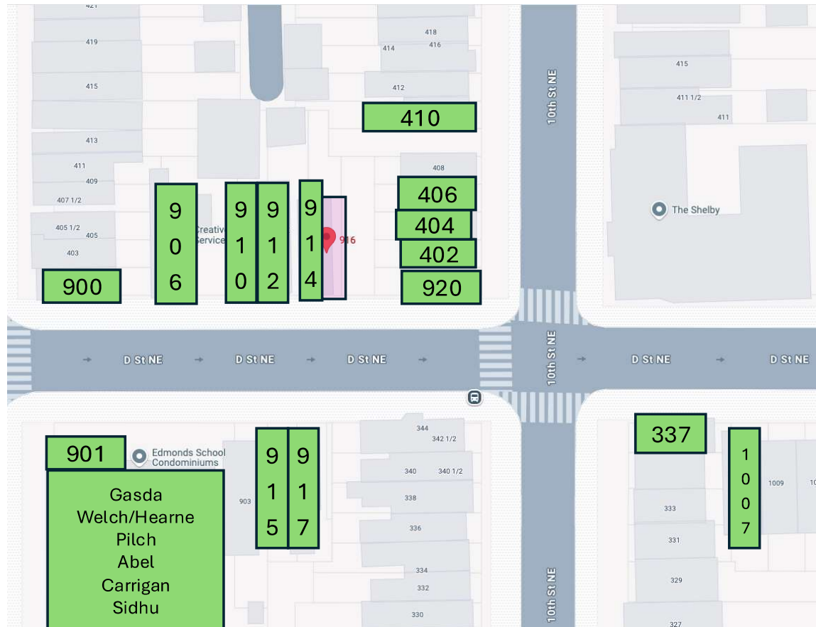
916 D St NE - front porch restoration (CHRS handout)