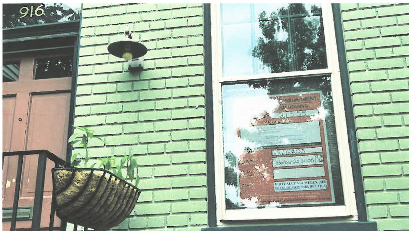
1. 916 D Street NE sign in front window close up