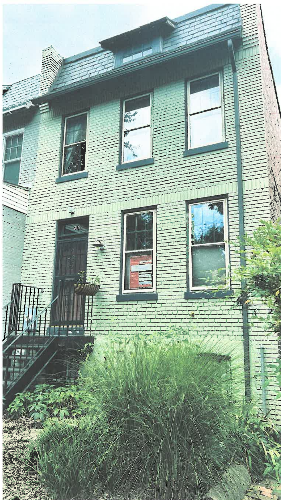
2. 916 D Street BZA sign in front window from sidewalk