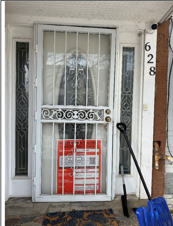
Sign posted securely and visible from the street.