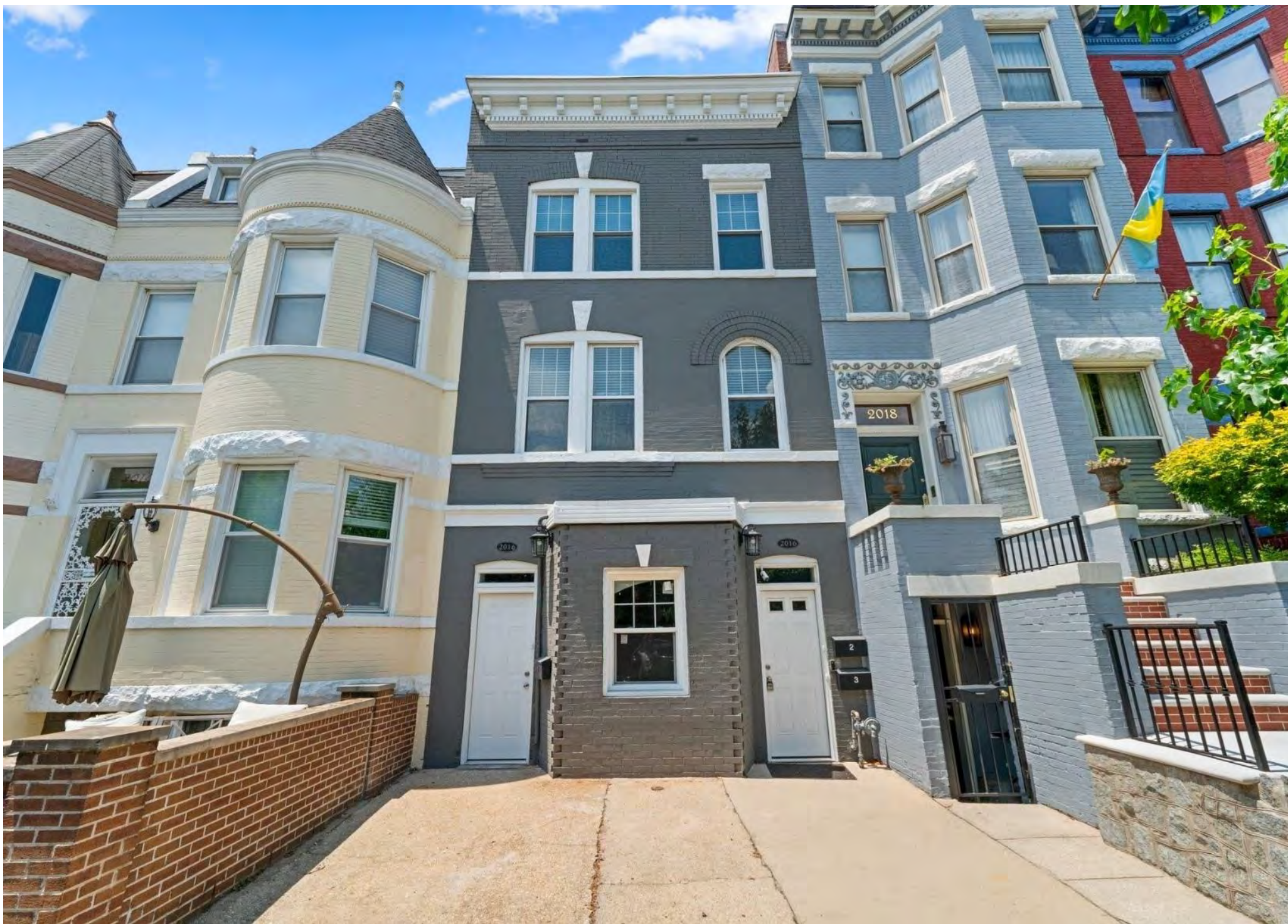
2016 1st Street, NW - FRONT EXHIBIT 7