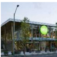
WHOLE FOODS WYNNWOOD

Whole Foods Markets , (MV+A) Project Manager and design team leader for multiple facilities in the Mid-Atlantic Region. Responsibilities included updating technical standards and specifications and response to production quality control and consistency requirements with compressed schedules and delivery times. Responsible for multiple designs of 40,000 sf building shells and 'tenant' improvement packages, working closely with the WFM team to help shape thoughtful design responses to regional themes and make improvements and renovations to existing stores and warehouse space. Signature store building envelop designs in Wynnewood, PA, Springhouse, PA, Rocky River, OH, and Ashburn, VA.