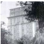
HAMILTON CROWN PLAZA