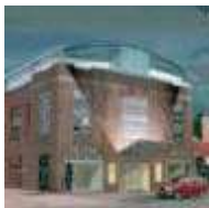
U ST LOFTS