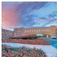
VIRGINIA TECH ACITC