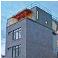
731 8TH STREET SE

IBM Divisional Headquarters- Rockville, MD (KCF) 250,000 SF Construction Administration of shell building. Project Architect, design and CA services of corporate offices.