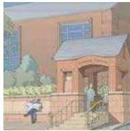
GW MT VVERNON GATE

The American University, Fine Arts Building - Washington, DC (KCF) 25,000 SF addition for new faculty offices, galleries, painting, drawing and dance studios. Not built.