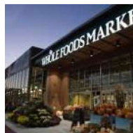
WHOLE FOODS CLEVELAND