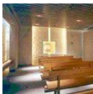
CUA LAW CHAPEL