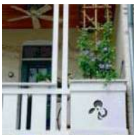
18TH ST PORCH DETAILS