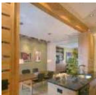
2912 18TH ST