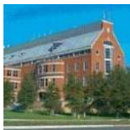
GW NO VA CAMPUS