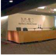
MATTHEWS MEDIA GROUP