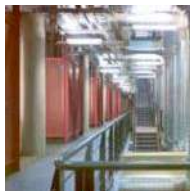
GW NVA CAMPUS