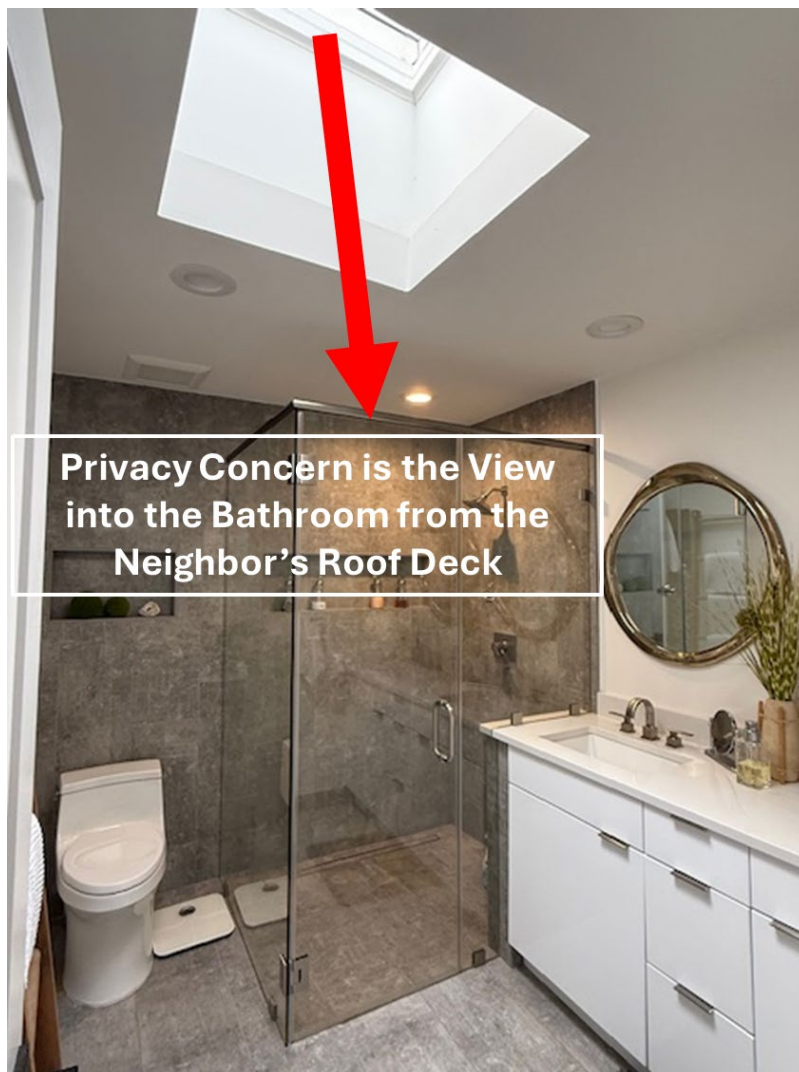
Privacy concern with the potential view into our bathroom and shower

The BZA requested additional comments related to the revised plans. Below is the applicant's most recent elevation drawing showing both the building special exception extension along with the multiple decks. Together these provide a much more significant invasion of our privacy by providing increased angles to look deeper into our properties at every level.