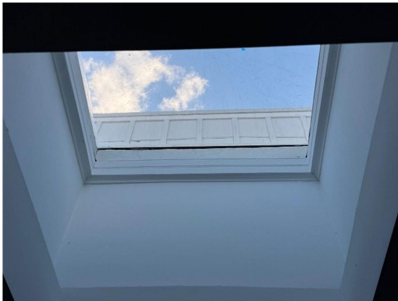
Looking out of our bathroom skylight showing the clear view of the neighbor's roofline

The following picture shows the view looking out the skylight clearly showing the existing roof line of the neighbor to the west. The applicant's roof will provide a similar view from the east; however, it will have a view into our shower.