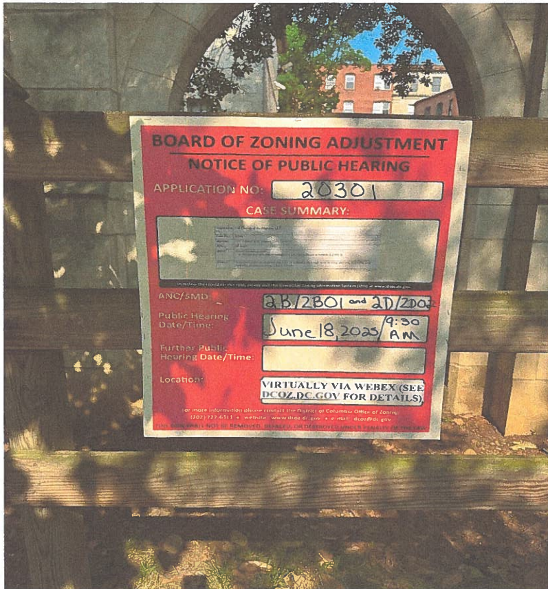
Picture 1 - facing 22nd street NW