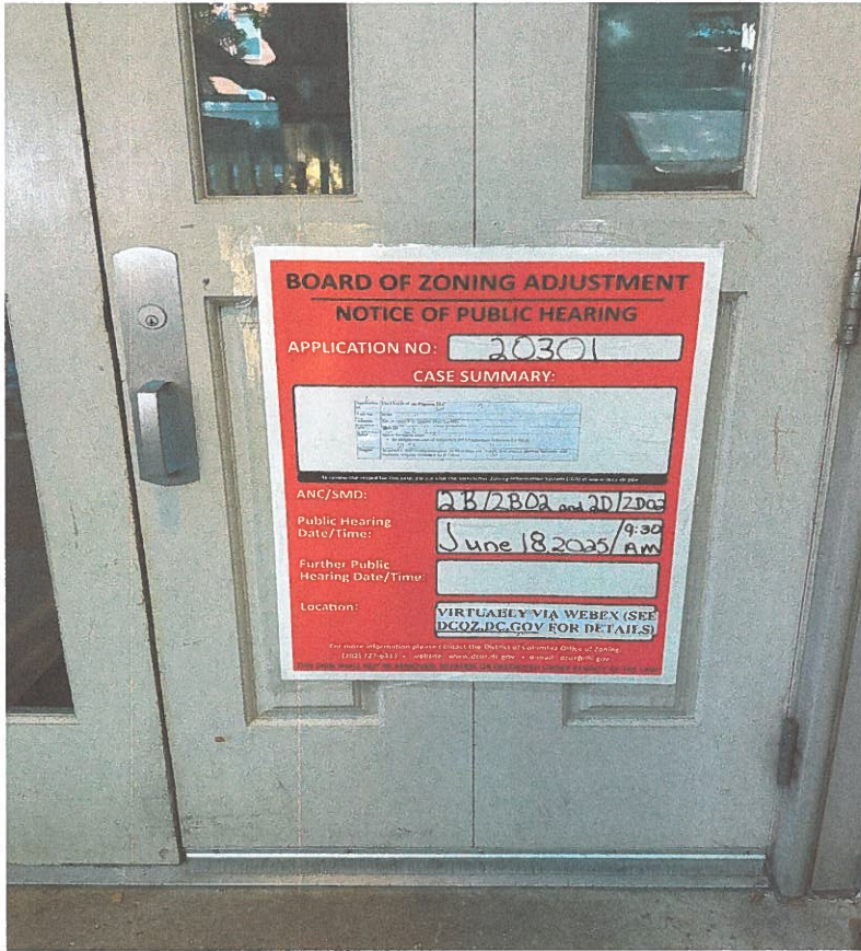
Picture 2 - on the entry door to