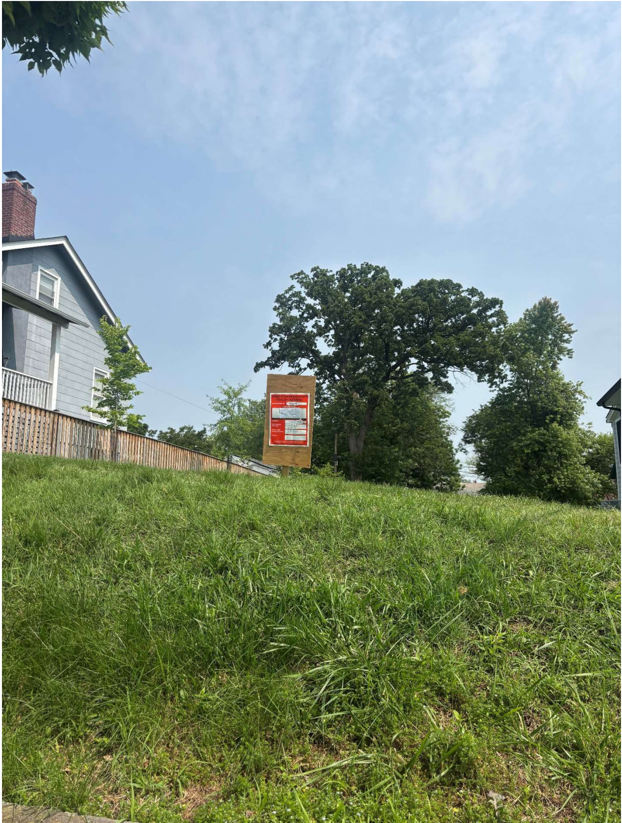
Picture 3 - Unaddressed Lot 0009 - From Street