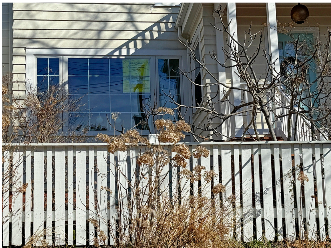
Photograph 1 - Warren Street NW