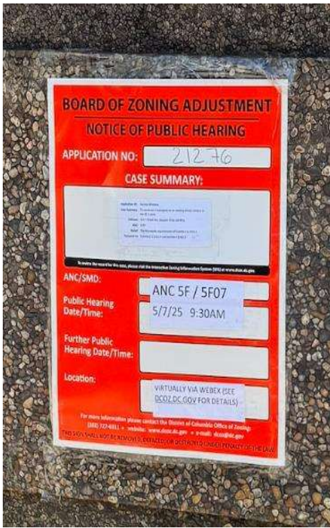
1. 5/2/25 – T Street NE