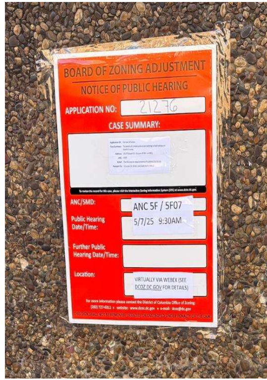
2. 5/2/25 – 2nd Street NE