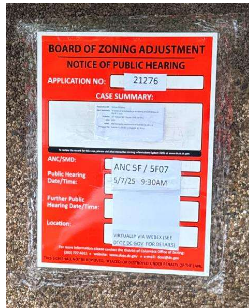
5/5/25 – R Street NE