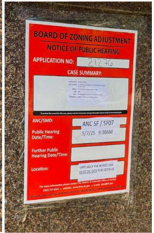
3. 5/2/25 – R Street