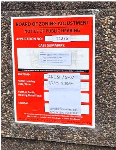
5/5/25 – T Street NE